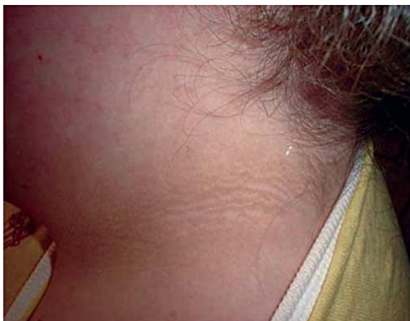
Fig. 2. Acanthosis nigricans of the neck folds in a patient with Albright Hereditary Osteodystrophy (Nwosu, 2009)

A patient with Albright hereditary osteodystrophy-like syndrome with a normal GNAS gene that was complicated by type 2 diabetes mellitus with severe insulin resistance, growth-hormone deficiency and diabetes insipidus has been described (Sakaguchi, 1998). Long et al. (Long, 2007) reported that obesity is a more prominent feature of PHP 1a than of PPHP, and that severe obesity is characteristic of PHP 1a. They postulated that paternal imprinting of G s α occurs in the hypothalamus such that maternal, but not paternal, G s α mutations lead to loss of the melanocortin signaling cascade, which is important for signaling satiety. This loss of satiety signaling then leads to greater alteration in energy balance and notably greater insulin resistance in individuals with PHP 1a (as shown in Figure 2) than in those with PPHP.