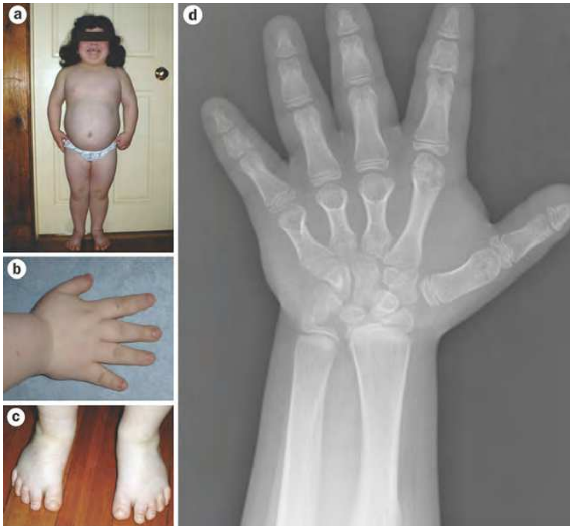
Fig. 1. a, b, c, d. Features suggestive of Albright hereditary osteodystrophy(Nwosu, 2009) Figure 1 | Features suggestive of Albright hereditary osteodystrophy in the patient. a | Photo of a patient at 5 years of age showing an obese phenotype, round face, broad chest, short neck and digits consistent with pseudohypoparathyroidism type 1a. b | Photo of the patient's hand at 5 years of age showing brachyphalangism of the fingers, especially the third through fifth digits. c | Photo of the patient's feet at 5 years of age showing brachyphalangism of the toes. d | Bone age radiograph of the patient at 7 years of age showing premature fusion of the epiphyses of the distal phalanges of the thumb, midphalanges of both the second and fifth fingers, and shortening of the third through fifth metacarpals. Her bone age was read as 13 years at a chronological age of 7 years and 8 months.

metacarpals(Poznanski, 1977; Steinbach, 1965). Shortening of the metatarsals (Figure 1c), especially the third and fourth, is seen in about 70% of persons with AHO(Steinbach, 1966).