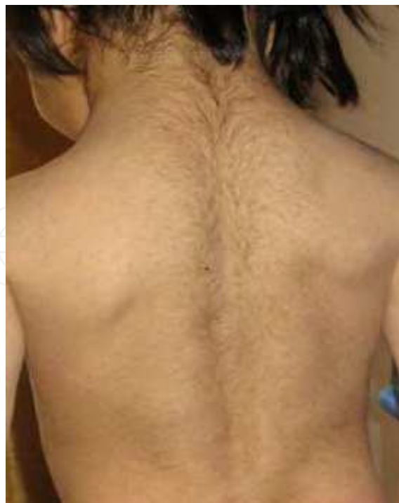
Fig. 2. A 6-year-old girl with congenital primary hypothyroidism. Dark and thick hairs on her back are seen.

Other important thyroid hormone target in the perinatal period is bone, as evidenced by the striking growth retardation, decreased growth velocity and delayed ossification of the epiphyseal growth plate characteristic of long-standing untreated hypothyroidism in infancy and childhood. Thyroid hormone-mediated bone maturation involves both direct and indirect actions. The indirect action mediated by regulation of growth hormone gene expression and the IGF system (Robson et al., 2000, 2002). T 3 regulates endochondral ossification and controls chondrocyte differentiation in the growth plate both in vitro and in vivo as a direct (Robson et al., 2000; Ball et al., 1997). Osteoblasts and growth plate chondrocytes both express TRs and several T 3 -specific target genes have been identified in bone (Stevens et al., 2003). T 3 also stimulates closure of the skull sutures in vivo, the basis for the enlarged anterior and posterior fontanelle characteristic of infants with congenital hypothyroidism (Akita et al., 1994). Due to delayed bone maturation, there were skeletal deformed, kyphoscoliosis, on thoraco lumbar vertebrae in a 21 year old female with delayed diagnosis of hypothyroidism (fig 3). Bone age is retarded in hypothyroidism almost always exceeds the retardation in linear growth. Tooth eruption may be delayed, and in rare cases stippled epiphyses are evident radiographically.