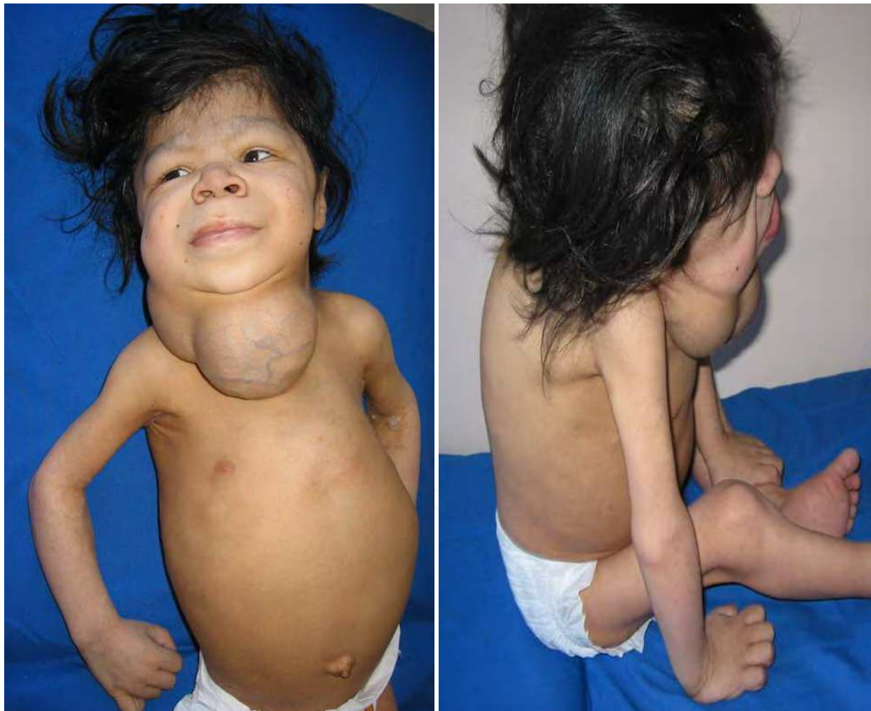
Fig. 1a, 1b. A 19-year-old girl with congenital primary hypothyroidism. Enlarged thyroid gland, coarse facial, umbilical hernia, thick hair, outpouring of the medial parts of the eyebrows, abdominal distention and delayed pubertal findings are seen ( Nobel Med , 2010; 6(1):74-77).

The most prominent finding in view of the rough face of delayed diagnosis. In some cases, depending on the TSH stimulation can be found enlarged thyroid gland (fig 1a-1b). During the perinatal period, brown adipose tissue is essential for non-shivering thermogenesis. Thyroid hormone stimulates transcription of thermogenin that protein that uncouples nucleotide phosphorylation and the storage of energy as ATP. As the child matures, shivering thermogenesis assumes greater importance and brown adipose tissue disappears (Brown, 2009). In children with thyroid hormone deficiency is impaired temperature regulation. Thus the skin is rough and cold skin, and is evidence " cutis marmorata " signs. Hypertrichosis in children with delayed diagnosis and treatment of hypothyroidism can be seen in the back (fig 2).