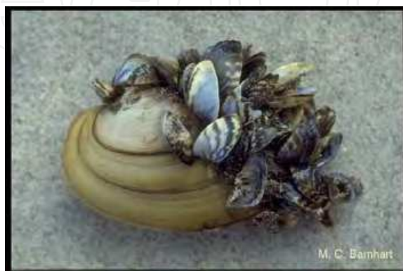
Fig. 4. Invasive zebra mussels, Dreissena polymorpha , infesting a native fatmucket, Lampsilis siliquoidea .

Invasion of exotic species is a global phenomenon that threatens terrestrial and aquatic ecosystems alike. The zebra mussel ( Dreissena polymorpha ) and Asian clams ( Corbicula fluminea ) are the two non-native species of greatest concern in North America (although there is some debate over the impact of C. fluminea ) (Strayer et al., 1999). D. polymorpha is highly invasive and fecund, and will attach to any solid substance including the shells of living Unionid mussels. They can occur in densities greater than 750,000 individuals/m 2 , with veliger (their pelagic larvae) densities reaching 400/liter of water (Leach, 1993). Zebra mussels spread rapidly, and one group of researchers has noted a 4-8 year delay from time of introduction of D. polymorpha and extirpation of Unionid mussels in many ecosystems (Ricciardi et al., 2003). They compete for food and habitat with native mussels, although it is believed that epizoid colonization (infestation) of the surface of Unionid mussel shells is the most direct and ecologically destructive characteristic of D. polymorpha (Hunter and Bailey, 1992; Mackie, 1993). Infestation densities of zebra mussels have been found to exceed 10,000/Freshwater mussel (Nalepa et al., 1993).