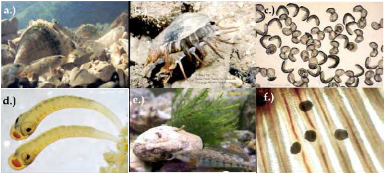
Fig. 3. a.) Fish-imitating lure of a gravid female broken-ray mussel, Lampsilis reeveiana ; b.) Crawfish-imitating lure of the rainbow-shell mussel, Villosa iris ; c.) Glochidia of the fluted kidneyshell, Ptychobranchus subtentum . Each glochidia is approximately 220 micrometers long; d.) Fish-imitating conglutinate of the Ouchita kidneyshell, Ptychobranchus occidentalis ; e.) Rainbow darter, Etheostoma caeruleum , attacking a conglutinate of Ptychobranchus occidentalis ; f.) Glochidia attached to the gills of a host fish. After attachment, the host fish's gill tissue forms a cyst around the glochidia.