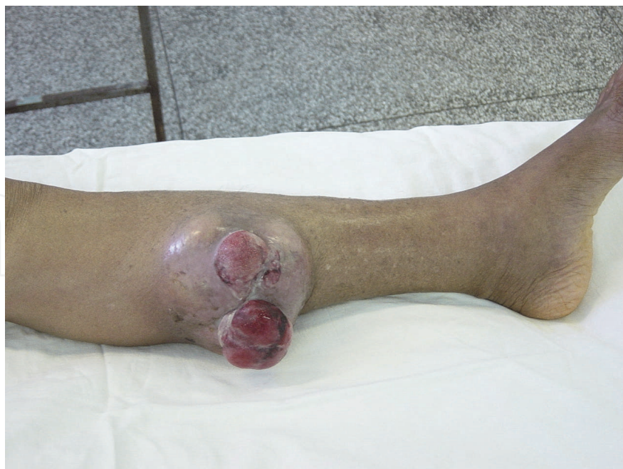
Fig. 2. Large tumors representing an adverse effect in survival

The factors associated with tumors seem to be the most important ones to determine the prognostic of systemic spread. Among them, we call special attention for size, histological and genetic aspects and the histological subtypes.