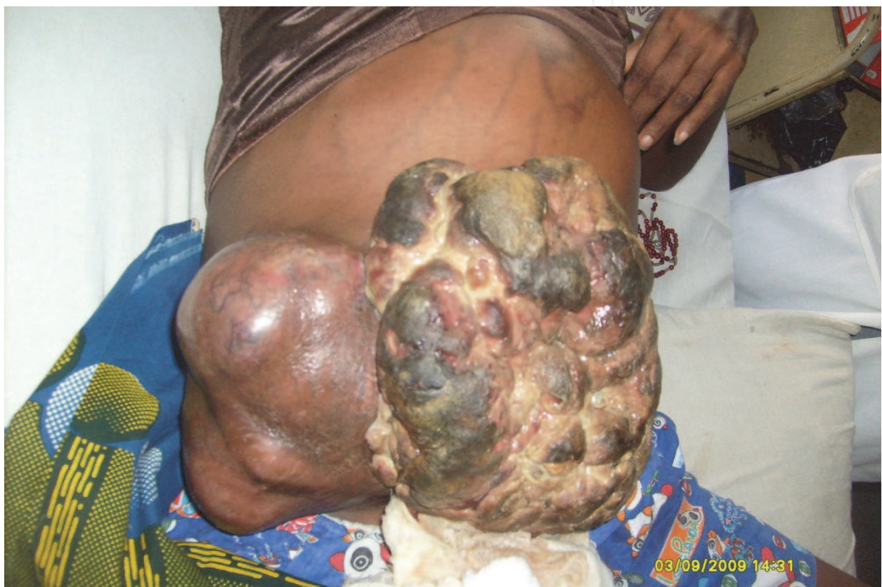
Fig. 1. Recurrence in pregnancy after 3rd excision, now very aggressive and fatal.resection.