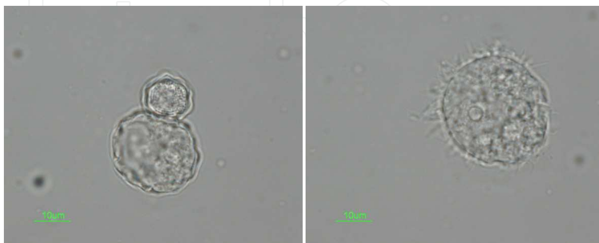
Fig. 1. Trophozoite (right) and Cyst stages (left) in Acanthamoeba sp.