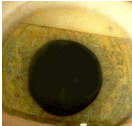
Fig. 2. ‘inverted hypopyon’ , emulsified oil in the Anterior chamber

Oil in the anterior chamber should be removed early to prevent problems with glaucoma. If oil is present in the vitreal cavity, care must be taken to ensure that it doesn’t come forward during the removal of the oil in the anterior chamber. This can be done with the use of 2 anterior chamber paracentesis. In one opening viscoelastic is injected into the AC pushing the oil towards the other paracentesis site where it is removed. The patient would be placed on anti glaucoma drugs until the viscoelastic reabsorbed, which can sometimes be delayed in eyes with reduced aqueous outflow. If only one paracentesis is used to aspirate the oil from the AC, the oil in the vitreal cavity will come forward to replace it, resulting in more oil in the AC.