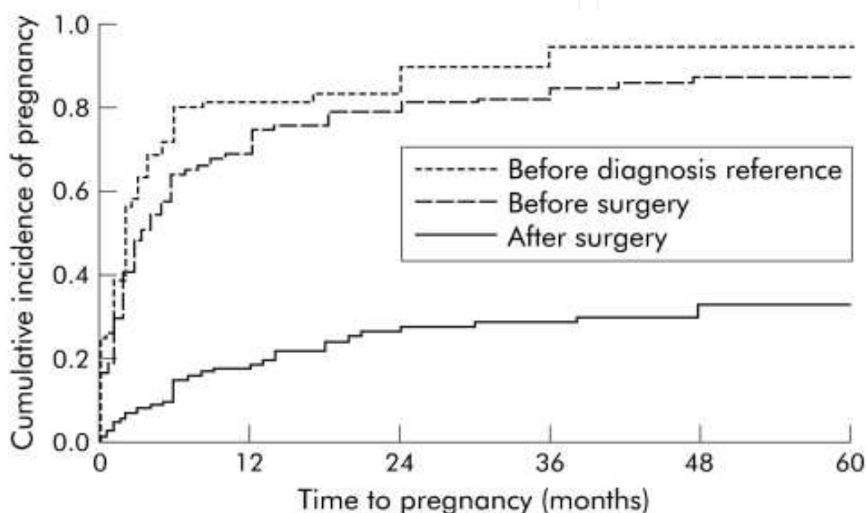
Fig. 1. Fecundability ratio in patients with ulcerative colitis before and after diagnosis, and after ileal pouch anal anastomosis compared with healthy controls. Reprinted from Olsen and colleagues [7]

Corticosteroids are used to induce remission during exacerbations of UC. They have been shown in rat studies to depress serum testosterone levels, but have no effect on gonadotropin levels [12]. Serum testosterone levels returned to normal on withdrawal of steroid treatment. Lerman et al demonstrated similar effects on fertility in male rats, although no change was seen in sperm number and motility [13]. There is limited data on the effects of exogenous steroids on male fertility in humans. A study by Roberts et al, suggested that an increase in endogenous cortisol levels observed following strenuous exercise was associated with a subsequent decrease in sperm concentration [14]. Therefore, steroids should only be used short term to control disease activity. The use of steroids for different diseases in females has not been associated with impaired fertility.