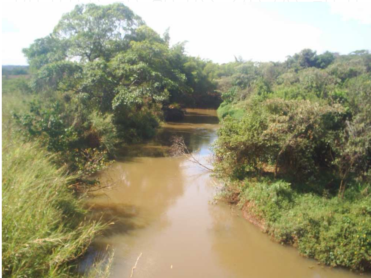
Fig. 2. João Leite river upstream of Goiania, after interbreeding Jurubatuba stream with the Posse stream, municipality of Goianapolis (Santos et al., 2008).

In this river two sites were selected for sampling: one located at 16°37'40.18"S latitude and 49°14'26.08"W longitude (JL1) (Figure 2), when this body of water reaches Goiânia, and the other located at 16°19'37.52"S latitude and 49°13'24.53"W longitude (JL2), before Goiânia. Figure 3 shows hydrographic map with the four sampling points in the rivers under study: João Leite (JL1 and JL2) and Meia Ponte (MP1 and MP2).