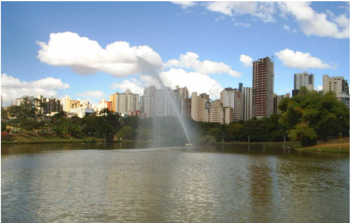
Fig. 4. Photography of Vaca Brava lake, demonstrating the puopulsion system of water (Santos et al., 2008).