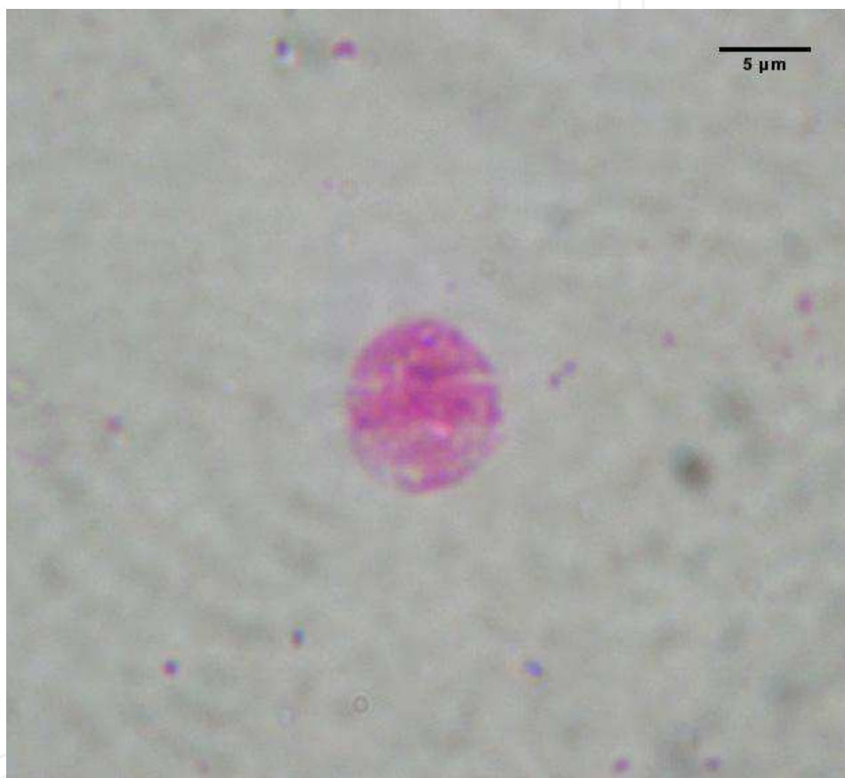
Fig. 6. Cryptosporidium sp. oocyst stained by the modified Ziehl-Neelsen (magnitude 100x) technique and confirmed by the MERIFLUOR® direct immunofluorescence assay kit and PCR (Santos et al., 2010).

Using the modified Ziehl-Neelsen-stain technique, 2.7% (2/72) samples were positive for Coccidia, and the presence of Cryptosporidium sp. was detected in two samples and confirmed by the MERIFLUOR® direct immunofluorescence assay kit Figure 6 shows a Cryptosporidium sp. oocyst and Figure 7 displays a Cryptosporidium parvum oocyst, which is approximately 5 \mu\text{m} in diameter, whereas Cryptosporidium hominis oocyst is approximately 4 \mu\text{m} in diameter.