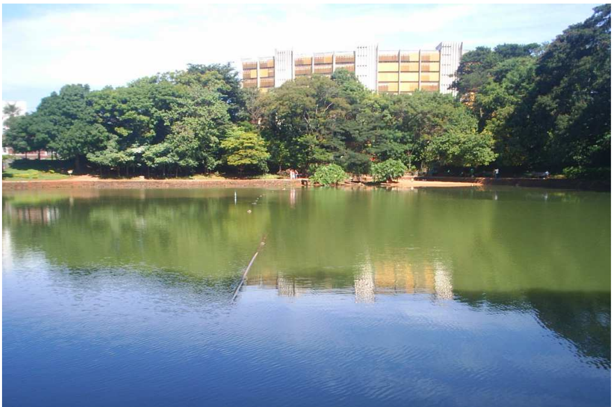
Fig. 5. Bosque dos Buritis lake, where we observe the dark Green water (an indicator of eutrophication) (Santos et al., 2008).