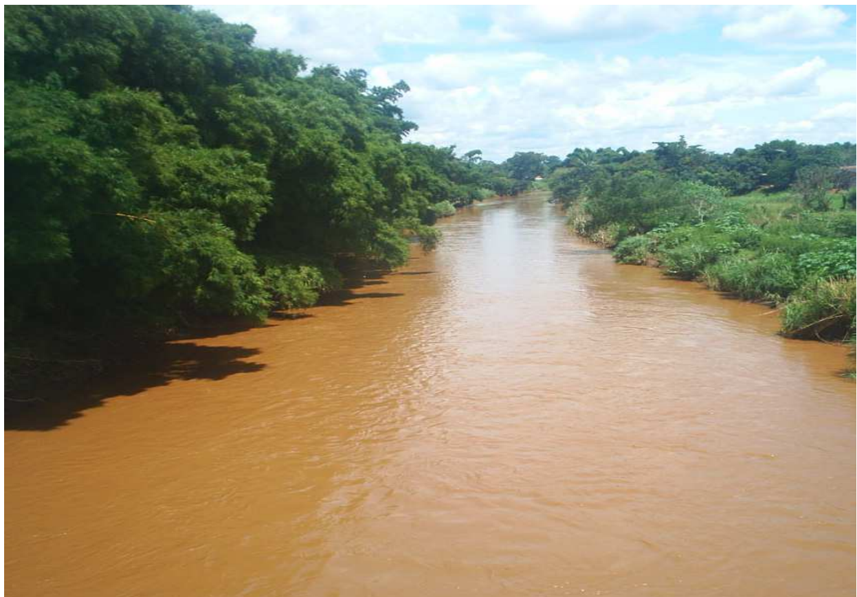
Fig. 1. Photograph of Meia Ponte river at the time of sampling during the rainy season, showing the high volume of water and its coloring (Santos et al., 2008).

In this river two sites were selected for sampling: the first, 1 km after the emission of wastewater treated by the municipal wastewater treatment plant of Goiânia, located at 16°37'40.94"S latitude and 49°16'13.41"W longitude (MP1), and the second, located at 16°38'22.39"S latitude and 49°15'50.68"W longitude (MP2) (Figure 1).