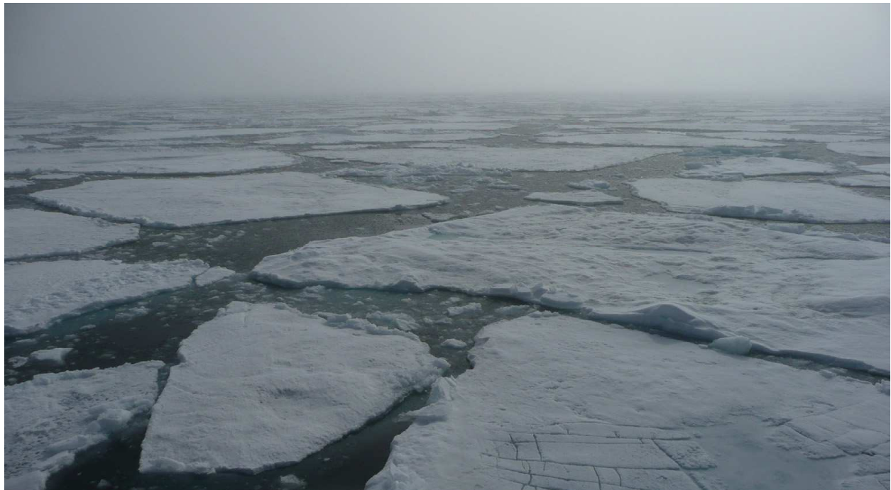
Fig. 2. Although sea ice has partially broken up on this bay, thin ice is beginning to form over the open water areas again. Such observations of episodic ice thaw are one type of observation sought in the IceWatch Canada program.

particularly for those parts of the country at higher latitudes where the population of Canada is sparse.