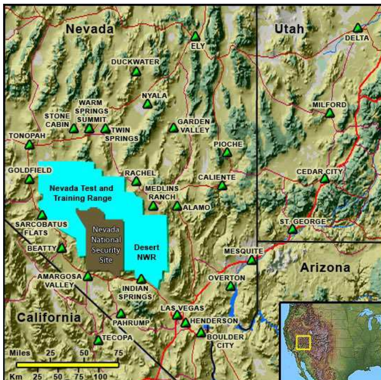
Fig. 3. The monitoring stations that make up the CEMP are located in communities and ranch sites scattered across a 160,000 km 2 area of southern Nevada, south-eastern California, and south-western Utah in the U.S.

The CEMP is funded by the U.S. Department of Energy (DOE), National Nuclear Security Administration, and administered by the Desert Research Institute (DRI), a non-profit environmental research arm of the Nevada System of Higher Education. While the DOE has historically been viewed by many in the region with distrust as the agency responsible for radioactive contamination of downwind areas, particularly during the era of above ground nuclear testing, the administration of the program by a state agency associated with the higher education system helps to improve confidence in the monitoring results. However, it is the participation of residents of the local communities that achieves the greatest benefit for the program in terms of public trust, communication, and education.