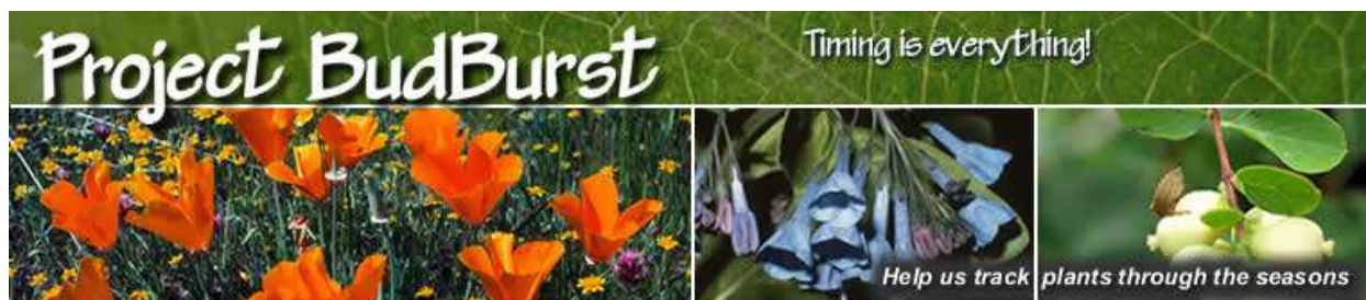
Fig. 1. On-line banner for Project BudBurst, a collaboration between the NEON program funded by the U.S. National Science Foundation and the Chicago Botanic Garden. The project also aims to integrate phenological observation programs initiated by other organizations, universities, and national laboratories.

Global climate change is already resulting in the changes in the timing of leafing, flowering, and fruiting of plants (plant phenophases) with a general lengthening of the growing season. While there have been many local records developed, there remain significant geographic gaps and gaps in the types of plants for which phenological records have been developed (Backlund et al. 2008). Project BudBurst, co-managed by National Ecological Observatory Network (NEON) of the U.S. National Science Foundation (Keller et al. 2008) and the Chicago Botanic Garden ( http://neoninc.org/budburst/_AboutBudBurst.php , accessed July 2011) is designed to address these data needs through public participation. The principle objective of NEON is establishing observational and experimental sites in 20 ecoclimatic domains in the contiguous U.S. as well as the states of Alaska and Hawaii. Project BudBurst's contribution is in expanding the number of locations and species for which information on the response to climate change is collected in the U.S. and Canada by using citizen scientists referred to as "Project BudBurst Observers." See Fig. 1.