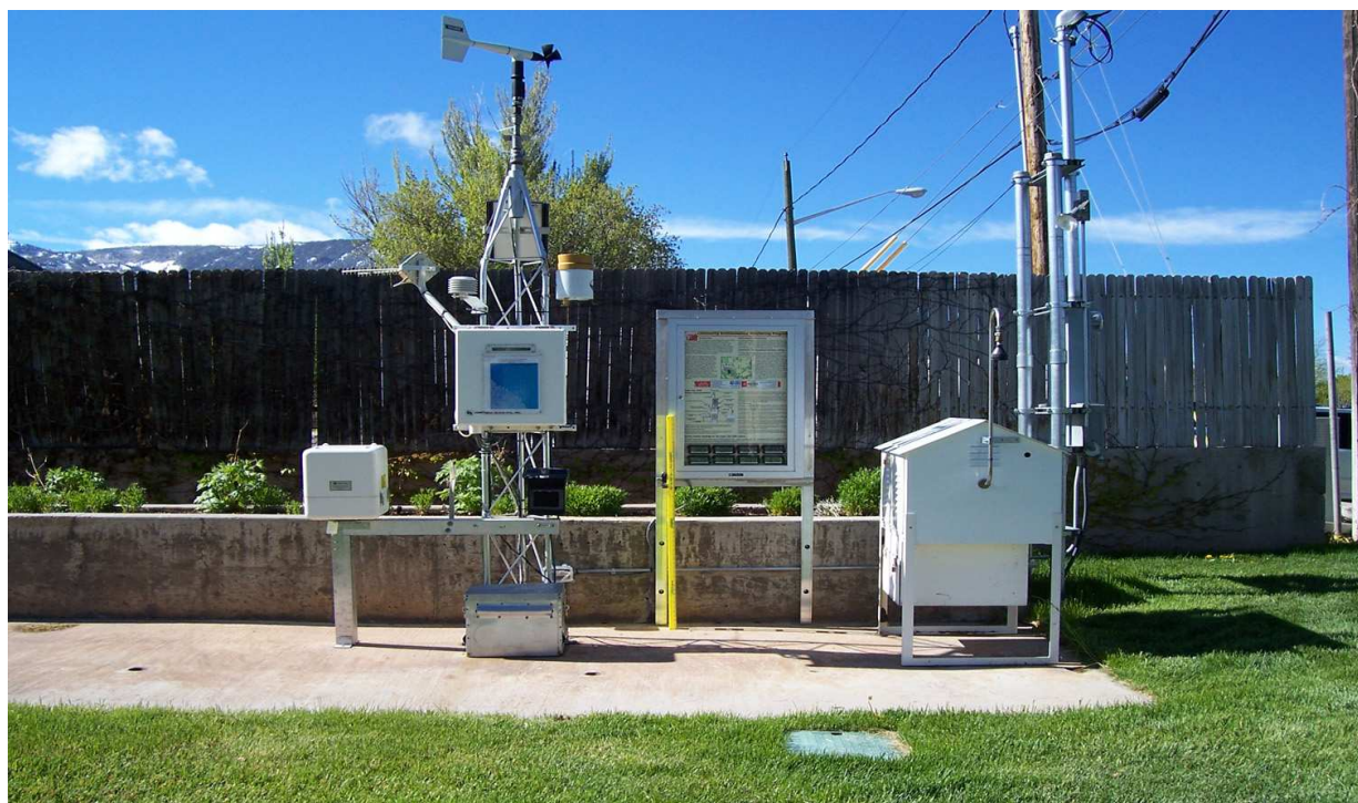
Fig. 4. A typical CEMP environmental monitoring station, with a full suite of meteorological sensors, radiation detection equipment, air sampler, and interpretive display with real-time sensor readouts.

The public participants in this program are not strictly volunteers, but receive a small monthly stipend for their duties as employees of DRI. The decision to hire them as employees was made in part to stress the importance of their sample collection duties, but also to offer them protection for any injuries that might occur during the discharge of their duties. The amount they are paid (approximately $150 US per month) is small, so as not to create the public perception that they are "in the pocket" of the DOE sponsors, and simply being given messages to parrot to their communities. On the contrary, CEMs are provided with regular training on the basics of ionizing radiation, and become knowledgeable on subjects ranging from radiation detection to local environmental conditions. Through attendance at these training workshops, the CEMs also become effective liaisons between local and federal entities, helping to identify concerns of people in their communities.