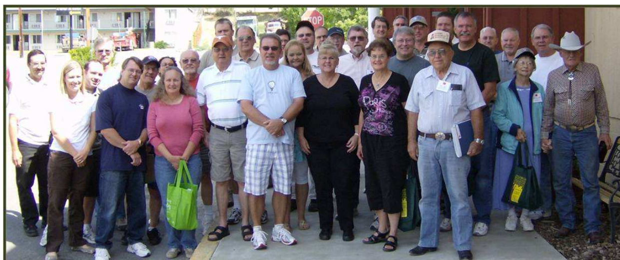
Fig. 6. Residents of 23 communities in southern Nevada, south-eastern California, and south-western Utah in the U.S., most of whom are schoolteachers, come together for regular workshops that train them to become effective communicators on issues related to the monitoring of ionizing radiation in their communities.