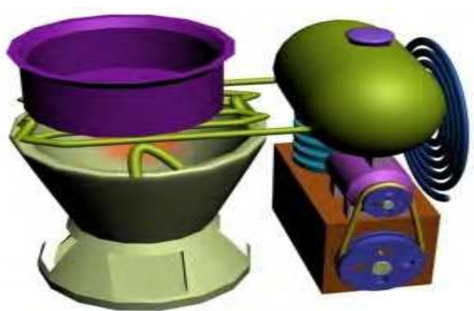
Fig. 9. The 3D Concept of the Steam –Electrical Generator Prototype (Source DIT R&PGS-2011)

There is few biomass based-co-generation plants in the country. These include sugar processing plants: Tanganyika Planting Company (TPC), Kilombero Sugar Company (KSC), Mtibwa Sugar Estates (MSE) and Kagera Sugar Company, Tanwat (Tanning) and Sao Hill Sawmill have waste that can be used in generating electricity. Table 13 shows electricity generated from cogeneration technology.