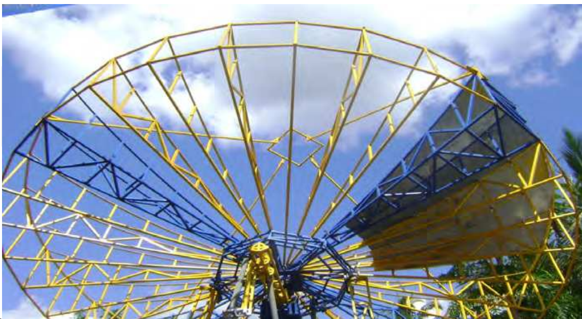
Fig. 8. A Parabolic Concentrator Heliostat