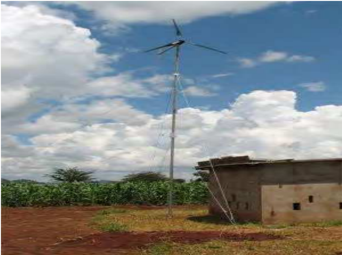
Fig. 1. Wind Turbine used to Generate Electricity for Water Pumping