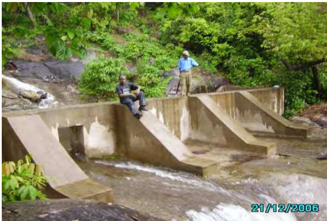
Fig. 3. Water falls for mini-hydro power at Chita-Kilombero