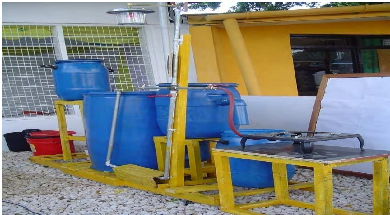
Fig. 4. A biogas plant using plastic containers

Organisation (SIDO), GAMARTEC, VETA, and private enterprises are researching and developing biogas plants for domestic and institution applications.