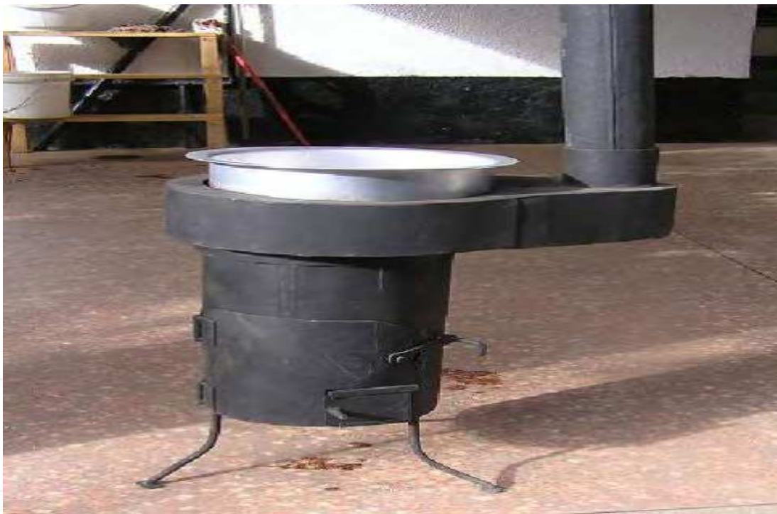
Fig. 5. Jiko Mbono Underdevelopment

Other benefits are income generation opportunities especially to village technicians. Stove improvement technology adds value on indigenous technology that uses indigenous fuel resources and material. Improved stove technology project is designed to start with small models that can be replicated in the whole country. The project will relate to construction of the efficient stoves and imparting knowledge on proper management of woodfuels. Amongst of the improved stove is “ Jiko Mbono ” shown in Figure 5. The stove is a Top-Lit-UpDraft (TLUP) gasification stove with natural draft air supply. The stove can use Jatropha seeds directly instead of Jatropha oil.