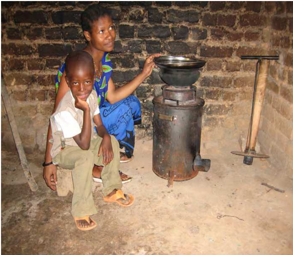
Fig. 7. Sawdust stove in Rural Tanzania