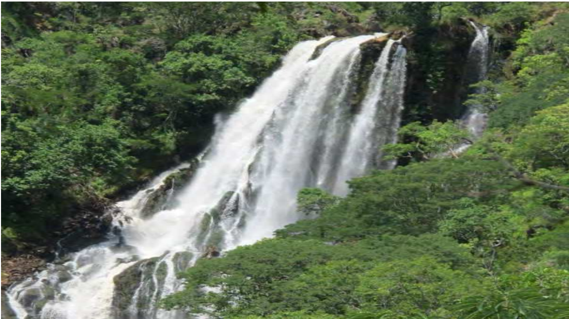
Fig. 2. Water fall at Madaba in South-Western Tanzania

Mbeya, Kigoma and Njoloma. Identified potential river sites for small hydro power generation are given in Table 12. Assessments of actual power available from the established sites are still being worked out. However, the established sites have the potential of generating enough electricity to spur rural electrification in the identified areas. Water falls from the identified area is shown in Figures 2 and 3.