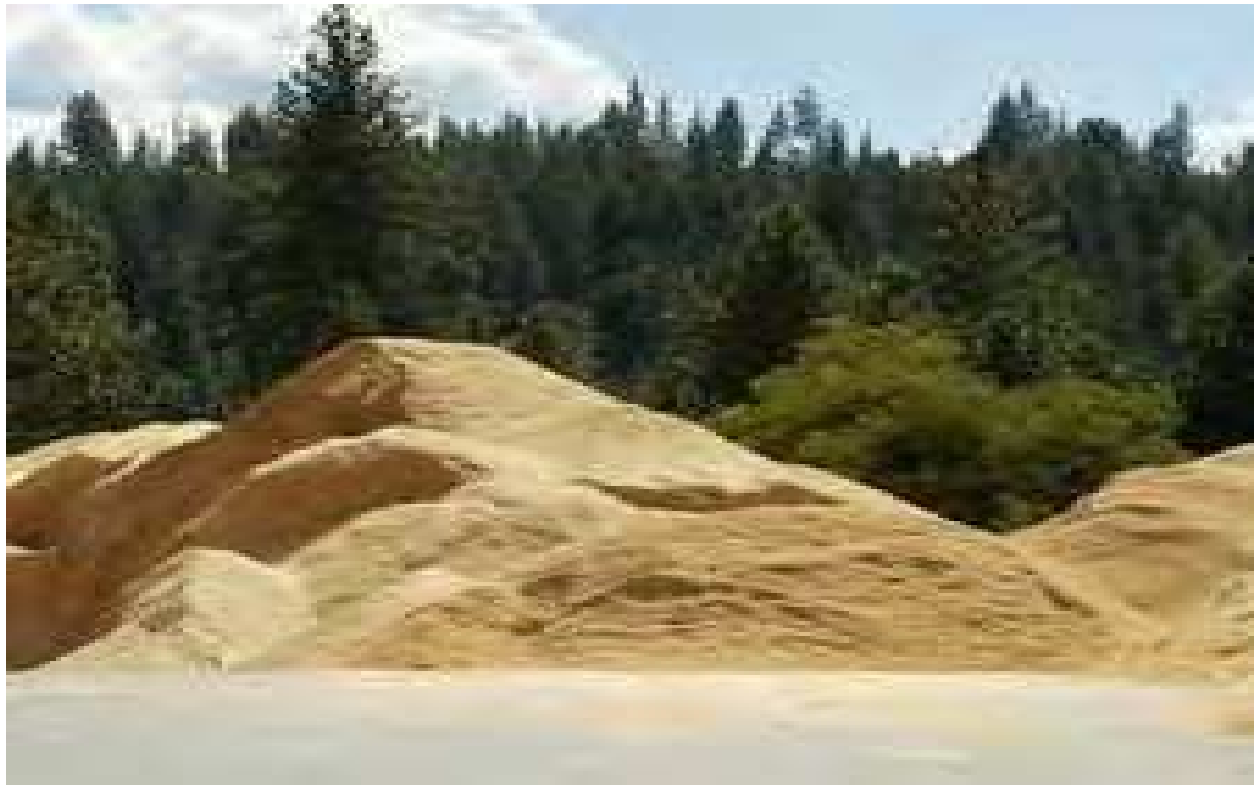
Fig. 6. Sawdust accumulation at one of Timber Processing Industry in Tanzania