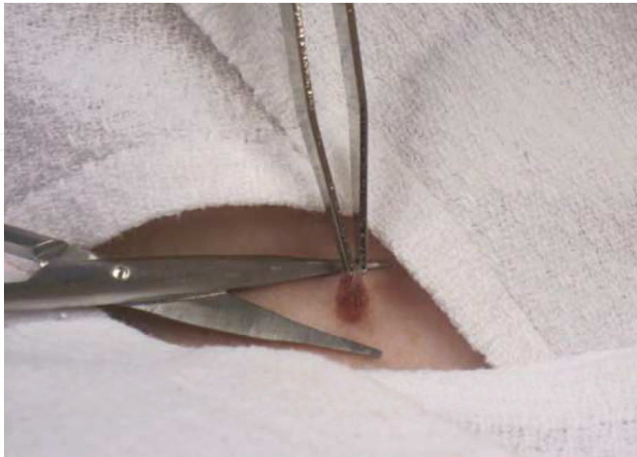
Fig. 14. Snip Biopsy

Snip biopsies are especially indicated for very superficial or pedunculated lesions such as acrochordons (skin tags), filiform warts, or seborrheic keratosis. The lesion is secured with a forceps and raised. This enables one to expose the base of the lesion and provide traction. A sharp scissors is then placed at the base of the lesion and it is cut (or snipped off). (Fig. 14)