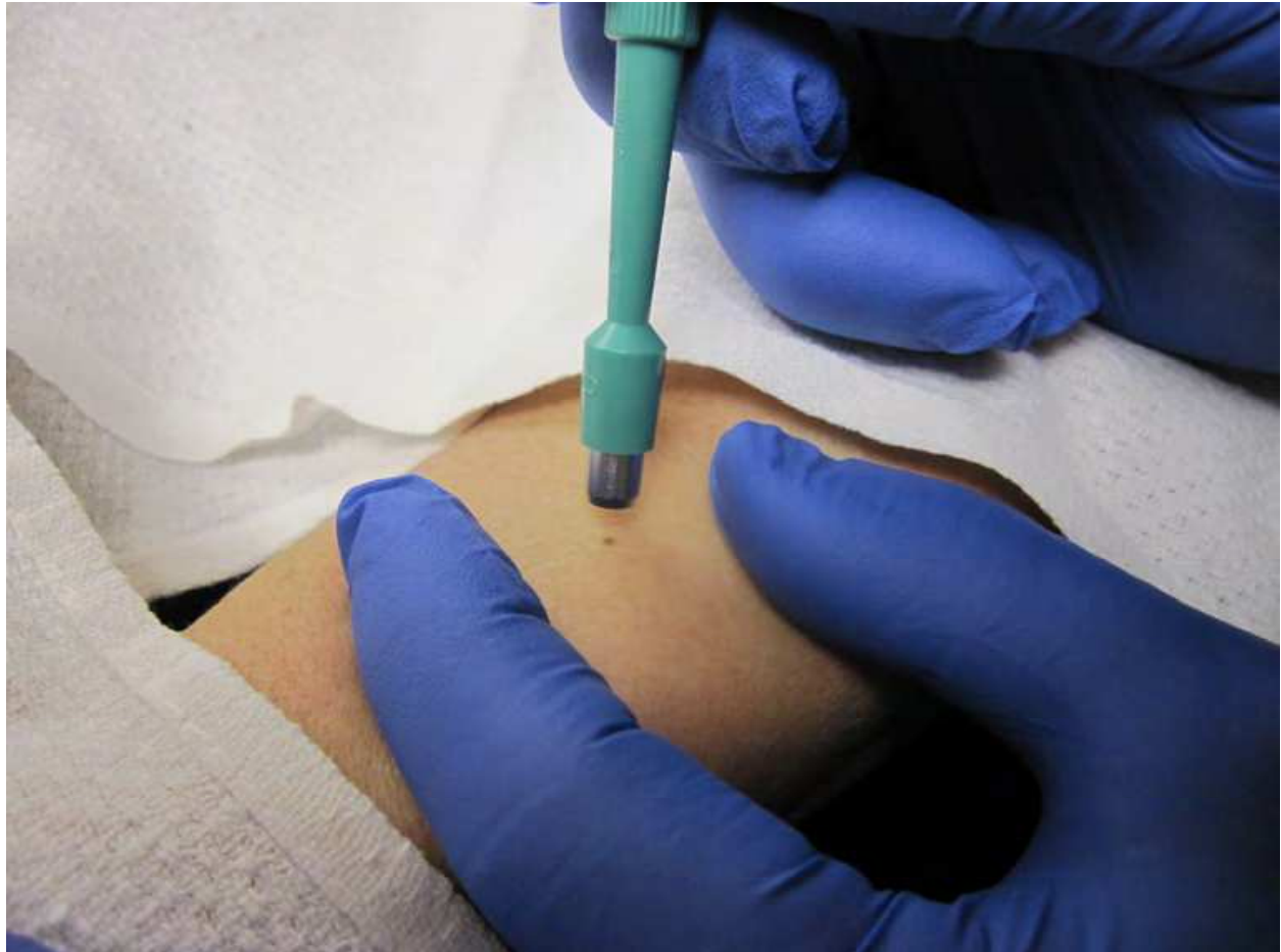
Fig. 7. Performing punch biopsy procedure

A definite "give" occurs when the punch reaches the subcutaneous fat, indicating that a full-thickness cut has been made. Remove the punch and apply downward finger pressure at the sides of the wound to pop up the core. Completely elevate the core with gentle use of forceps or a needle tip and excise it at its base with small tissue scissors. The pressure applied through forceps to elevate the core should be gentle to minimize the destruction and distortion of tissue in the biopsy sample. After finishing the harvest of the tissue, prepare the biopsy site for closure.