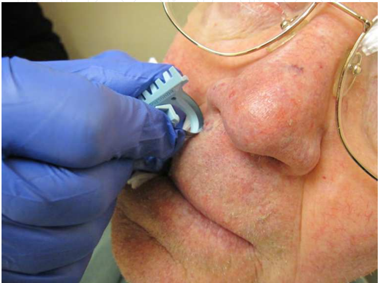
Fig. 4. Performing shave biopsy

a wheal of injected anesthetic, allowing the lesion to be propped up and stabilized between the thumb and forefinger. 8, 14 To shave a lesion, a number 15 blade is held parallel to the skin surface, and the biopsy is performed by using a smooth sweeping stroke rather than a sawing motion. (Fig. 4) Near the end of the shave maneuver, place the index finger on top of the lesion to stabilize and prevent tearing with the exit of the blade. The depth of the biopsy is controlled by the angle of the blade. Care should be taken to keep the blade parallel to the skin surface, avoiding irregular, deep penetration.