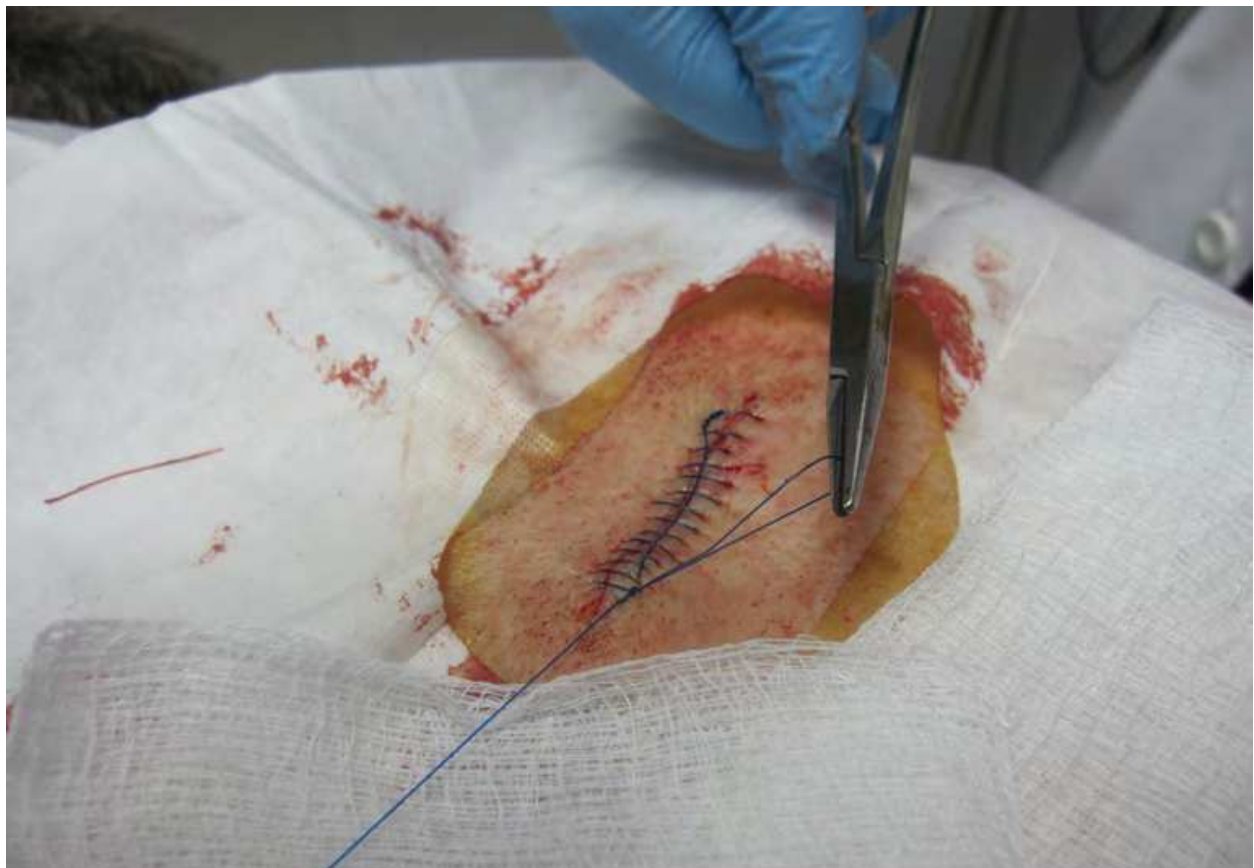
Fig. 13. Placement of sutures at excisional biopsy site

The instrument tie is fast and efficient. To begin, hold the needle holder parallel to the long axis of the wound with the free end and needle end of the suture on either side of the holder. Wrap the needle end of the suture twice around the holder, then grasp the free end of the suture with the holder and pull through, tightening the knot. (Fig. 13) At this point the needle end and free end of the suture should have switched sides relative to the beginning. The process is repeated as needed, reversing the position of the free end and needle end of the suture with each knot. "Approximate, don't strangulate" acknowledges the importance of proper tension on the suture. Excessive tension can be recognized by blanching of the wound edges, and may indicate the need for subcutaneous sutures or simply less tension on each suture.