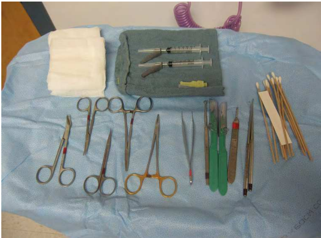
Fig. 1. Instruments used in skin biopsy procedures

Performing skin biopsies places the operator at risk of blood-borne infections. Accordingly, vaccination for hepatitis B is indicated, and universal precautions should be observed by wearing gloves and eye-guards. 7 Shave and punch biopsies are clean but not sterile procedures so mask, gown and sterile gloves are not necessary. 5 A mask is recommended for operators or assistants known to be respiratory carriers of Staphylococcus or Streptococcus organisms. Mask, gown, and sterile gloves are indicated for excisions, and are reasonable for any patient at increased risk of infection. 5 Recapping used needles increases the risk of needle sticks, and should never be attempted. Use of forceps during handling of surgical needles is highly recommended to minimize chances of injury. (Fig. 1) Materials that are contaminated with blood or other body fluids should be disposed appropriately in contaminated-materials plastic bags.