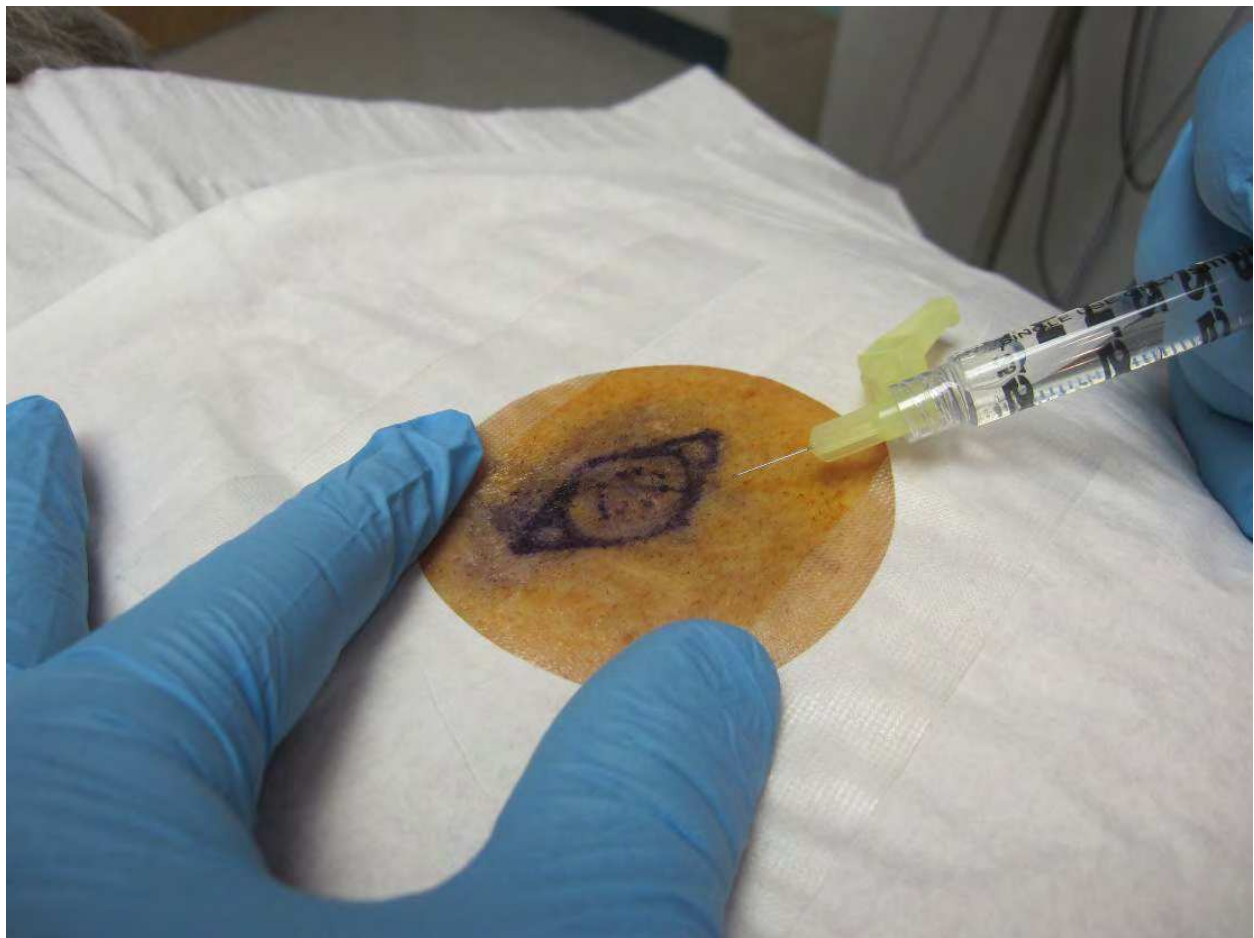
Fig. 3. Administration of local anesthetic agent at the site of skin biopsy

The sting of injection can be minimized (presumably by raising the pH) by mixing 1 mL of \text{NaHCO}_3 with 9 mL of lidocaine, using a 30-gauge needle, and by making the initial injection perpendicular to the skin. 3, 7, 12 Deep injections sting less than superficial injections, but prolong the time to adequate anesthesia. 3 Small syringes (1 and 3 cc) permit easier injection and are less cumbersome to handle. For small lesions the anesthetic can be injected directly into, or immediately adjacent to, the lesion. Some schools of thought recommend not injecting directly into lesions in which a malignancy is being considered highly among the differential diagnoses. This practice protects against the small potential of seeding the area during the procedure. For larger lesions, perform a field block by placing a ring of anesthesia around the surgical site, always advancing and injecting through a site that has been previously anesthetized. 7, 1