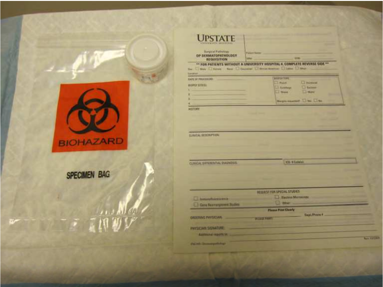
Fig. 10. 10% buffered formalin solution and Pathology request form

formalin, but larger specimens will require more formalin for adequate fixation. (Fig. 10) If a large complicated specimen needs to be sectioned, clue the pathologist to the location of the lesion by sectioning through its center and marking the normal skin borders with surgical marker. Careful attention must be paid to labeling the specimen. Include patient and physician name, date, and location of the lesion. The latter is especially critical if more than one lesion is removed. The specimen label must match the pathology request form and the description in the medical record. On the request form, list the clinical diagnoses and give a short clinical history and description of the lesion or rash. 10, 12 Focused clinical history and differential diagnoses are of immense help to the pathologist to arrive at a correct histological diagnosis. If a tumor has been removed, request that the margins be checked for tumor. Whenever possible, the specimen should be submitted to a dermatopathologist. 3