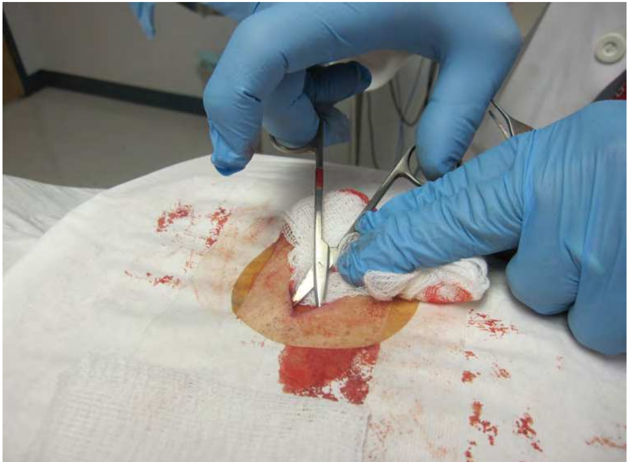
Fig. 11. Undermining the excision site prior to suturing

the sutures. (Fig. 11) It is a very useful technique; however care should be taken not to overdo it to minimize tissue destruction, risk of bleeding and post procedure pain. 3, 5, 16