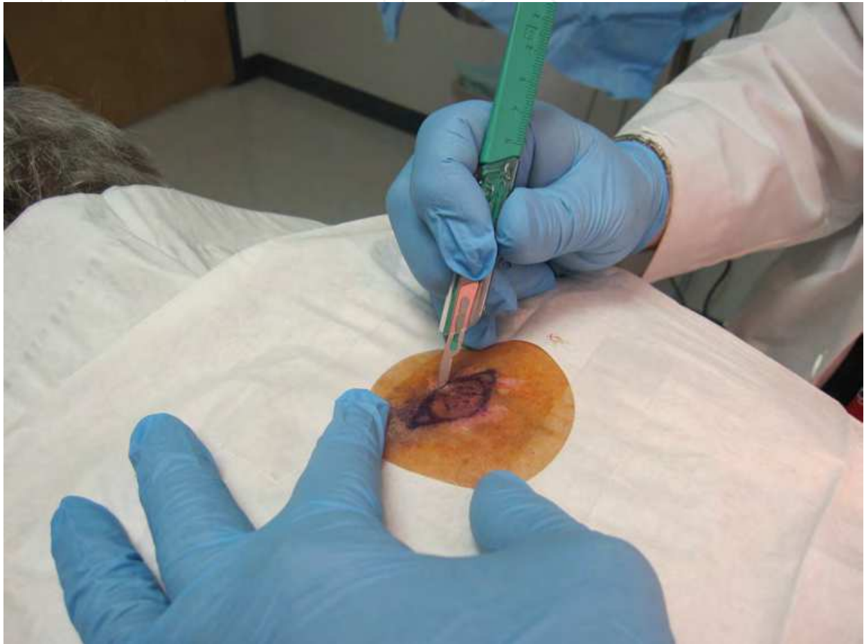
Fig. 9. Performing excisional biopsy

The blade should be angled away from the lesion, slightly undermining the wound edge. This will allow for easier eversion of the wound edge during closure, improving the cosmetic result and decreasing the risk of dehiscence. (Fig. 9) Carefully lift the sample edge with fine forceps once the ellipse has been incised and completely undermine the sample at the level of the subcutaneous fat with scalpel or scissors. Apply pressure to the wound with gauze in preparation for closing.