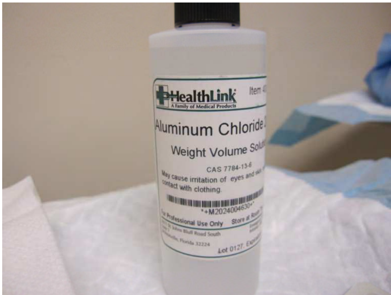
Fig. 5. Aluminum chloride: Most commonly used hemostatic agent

Shave biopsies are quick and do not require sutures for closure. Bleeding following small shave biopsies can often be controlled with pressure alone. Persistent oozing can be stopped with 20% aluminum chloride in absolute alcohol, which is the most commonly used haemostatic agent. (Fig. 5) It is very efficacious and causes minimum tissue destruction. Other hemostatic agents, in order of increasing corrosiveness, are Monsel's solution (ferric sub sulfate), trichloroacetic acid, and silver nitrate. Although Monsel's solution is more effective than aluminum chloride, it also causes more tissue destruction and, like silver nitrate, can result in skin pigmentation. 3,7