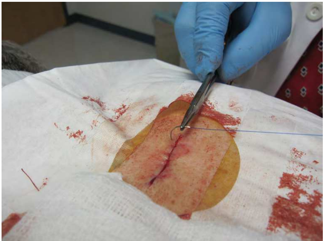
Fig. 12. Handling technique for suture needles

Suture needles are made of noncorrosive stainless steel, especially forged to achieve maximum strength and ductility, the ability to bend under pressure without breaking. 22 Suture needles have an eye, body, and point. Most needles have a swaged eye where the metal of the needle is molded around the end of the suture. This part of the needle is soft and likely to bend or break if mishandled. The body of the needle is designed for great strength and secure grasping; it is usually flattened with slight convex or concave sides to avoid rotation in the holder while suturing. Three types of needle points are common: cutting, tapered, and blunt. Cutting needles allow for easy passage through tough tissue and are ideal for skin. The size of the needle is ranked by a number, with higher numbers identifying larger needles. Needle curvature is measured in terms of proportion of a circle, with one-quarter, one-half, and three-eighth curves available. When wound closing seems more difficult than expected, reassess the appropriateness of the instruments. Needle selection is often a prime factor in the ease of suturing and final cosmetic result. 17