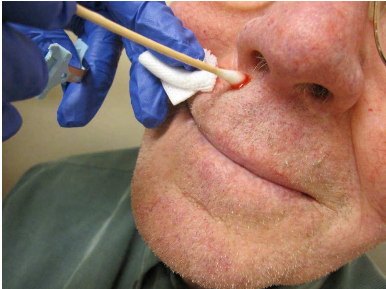
Fig. 6. Application of local haemostatic agent