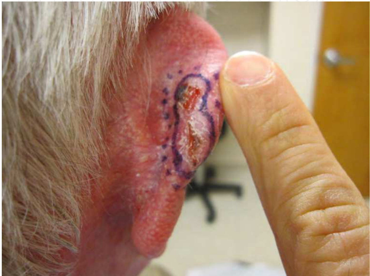
Fig. 2. Lesion on the back of right ear marked for biopsy

surgical marker as it may be temporarily obliterated following injection of the anesthetic. (Fig. 2) Marking the outlines for excisional biopsies can be very helpful. For excisions, place a fenestrated surgical drape over the biopsy site after cleansing, but before anesthesia. Round wounds tend to be pulled open in the direction of skin tension lines known as Langer's lines, which are generally parallel to the direction of collagen in the dermis. Tension lines can be demonstrated by gently compressing relaxed skin with the thumb and index finger, and wrinkle lines on the face are another good indicator. Surgical incisions placed parallel to tension lines will close more easily and cosmetically than those placed at right angles. 7,8,9