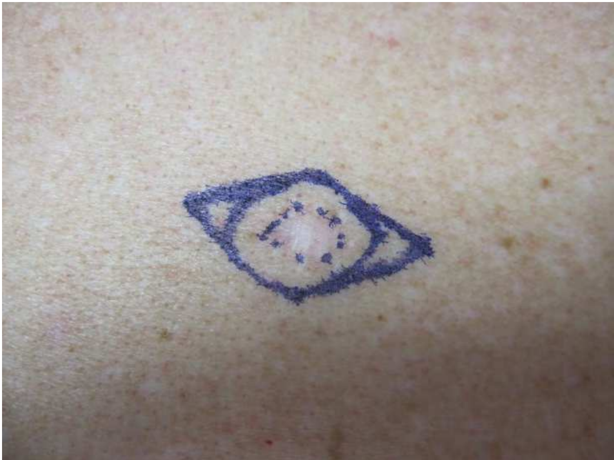
Fig. 8. Lesion marked in elliptical fashion prior to excisional biopsy

These are performed for lesions that require complete removal for diagnostic or therapeutic purposes. An excisional biopsy allows for histopathologic examination of an entire lesion. Another advantage of an excisional biopsy is the amount of tissue that can be excised, allowing for multiple studies (culture, histopathology, immunofluorescence, electron microscopy) from one biopsy site. 5 The direction of the skin tension lines should be determined in preparation for an excision. Align the long axis of the excision parallel to the skin tension lines. Using a surgical marking pen, draw an ellipse around the lesion to be excised, including a 2 to 5 mm margin of normal skin around the lesion, with 30° angles at each apex, and the length three times the width. (Fig. 8) Holding the scalpel with a number 15 blade like a pen, begin the incision at one apex with the blade perpendicular to the skin. As the incision progresses, use more of the belly of the blade, raising it to the perpendicular again at the next apex. 14