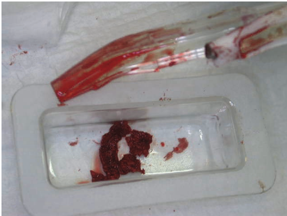
Fig. 2. Autogenous bone graft collected from the same surgical site by safe scraper.