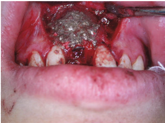
Fig. 4. Immediate dental implant placement into fresh socket and augmented with combined bone graft.