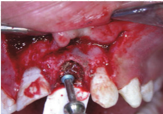
Fig. 1. Immediate dental implant placement into fresh socket augmented with autogenous bone graft.

be exhibited by only a minute segment of the patient population. When the donor site and recipient site are located within the same half of the mandibular arch, the surgical procedure is reduced to one mutually inclusive incision, which gains access to the donor bone on the lingual aspect and the recipient site on the buccal aspect. The removal of the tori can be accomplished with minimal trauma and low postoperative morbidity. Therefore, the cortical and cancellous nature of the bone, with a thickened outer cortical plate of haversian bone, makes it an excellent choice as a donor site for onlay grafting procedures.