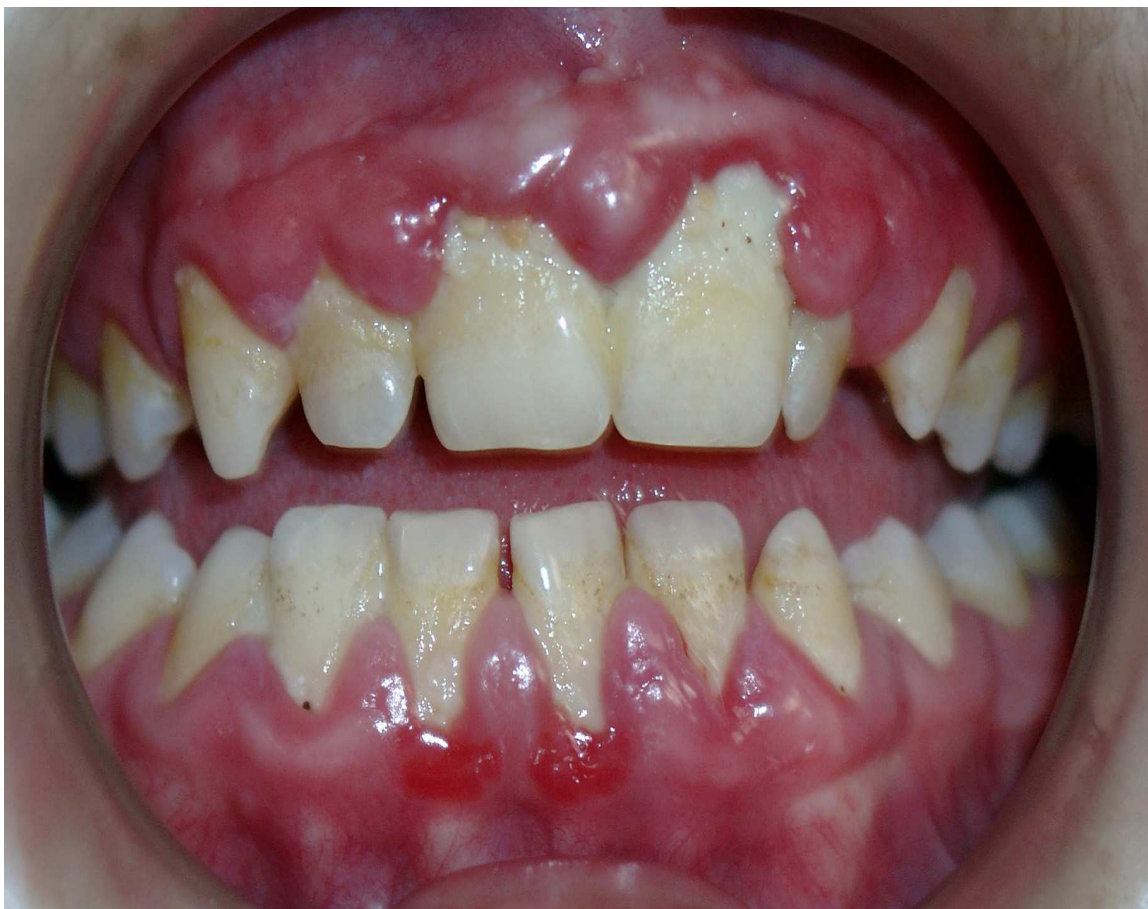
Fig. 1. Severe gingival enlargement in a child with epilepsy.

understanding the importance of oral hygiene is difficult for them, which results in the progression of dental caries as well as inflammatory disease of the periodontium (Mann et al., 1984). Patients living with epilepsy have special needs during dental treatment. In almost all aspects of oral health and dental status, the condition of patients with epilepsy is significantly worse than age-matched groups in the general (nonepileptic) population (Karolyhazy et al., 2003). Furthermore, patients who have poorly controlled epilepsy and experience frequent generalized tonic-clonic seizures exhibit worse oral health in comparison with patients who are better controlled or only have seizures that do not involve the masticatory apparatus (Karolyhazy, et al., 2003).