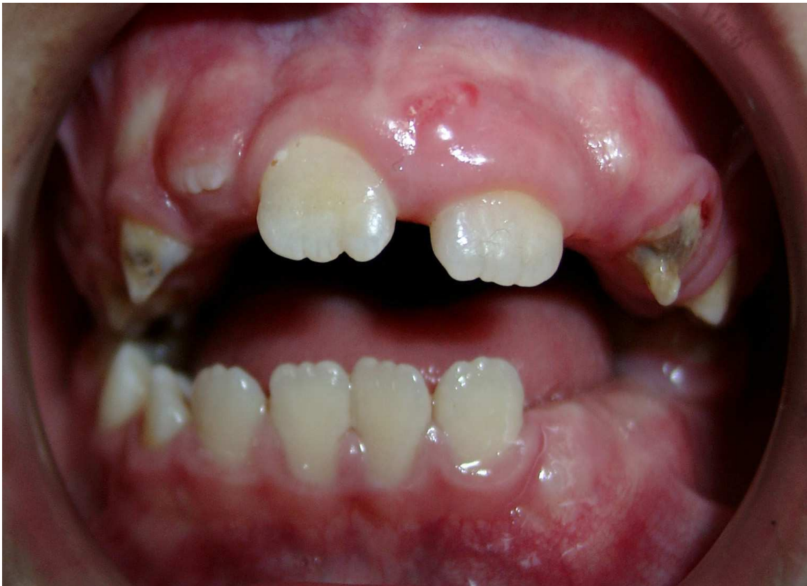
Fig. 2. Tooth eruption problem in a child with epilepsy.

than the general population. This situation can be especially true in patients who have development disabilities, who may have trouble accessing dental care anyway. The seizures themselves can cause injuries to the teeth and dental prostheses. Some of the drugs can cause periodontal disease. Specific considerations for epileptic patients include the treatment of oral soft tissue side effects of medications and damage to the hard and soft tissue of the orofacial region secondary to seizure trauma, especially in patients who suffer from poorly controlled generalized tonic-clonic seizures (Robbins, 2009).