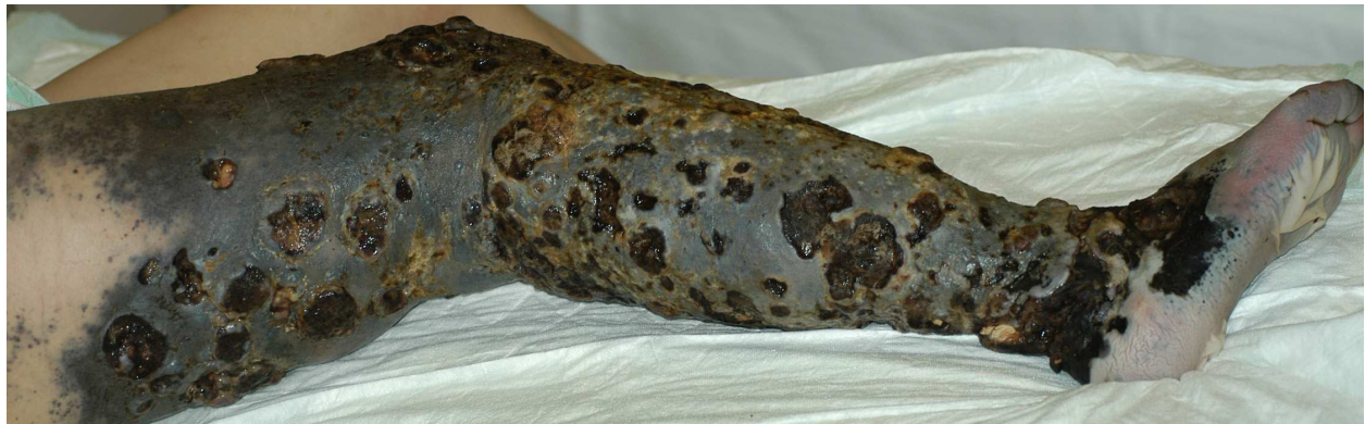
Fig. 3. Infected diffuse metastases from malignant melanoma