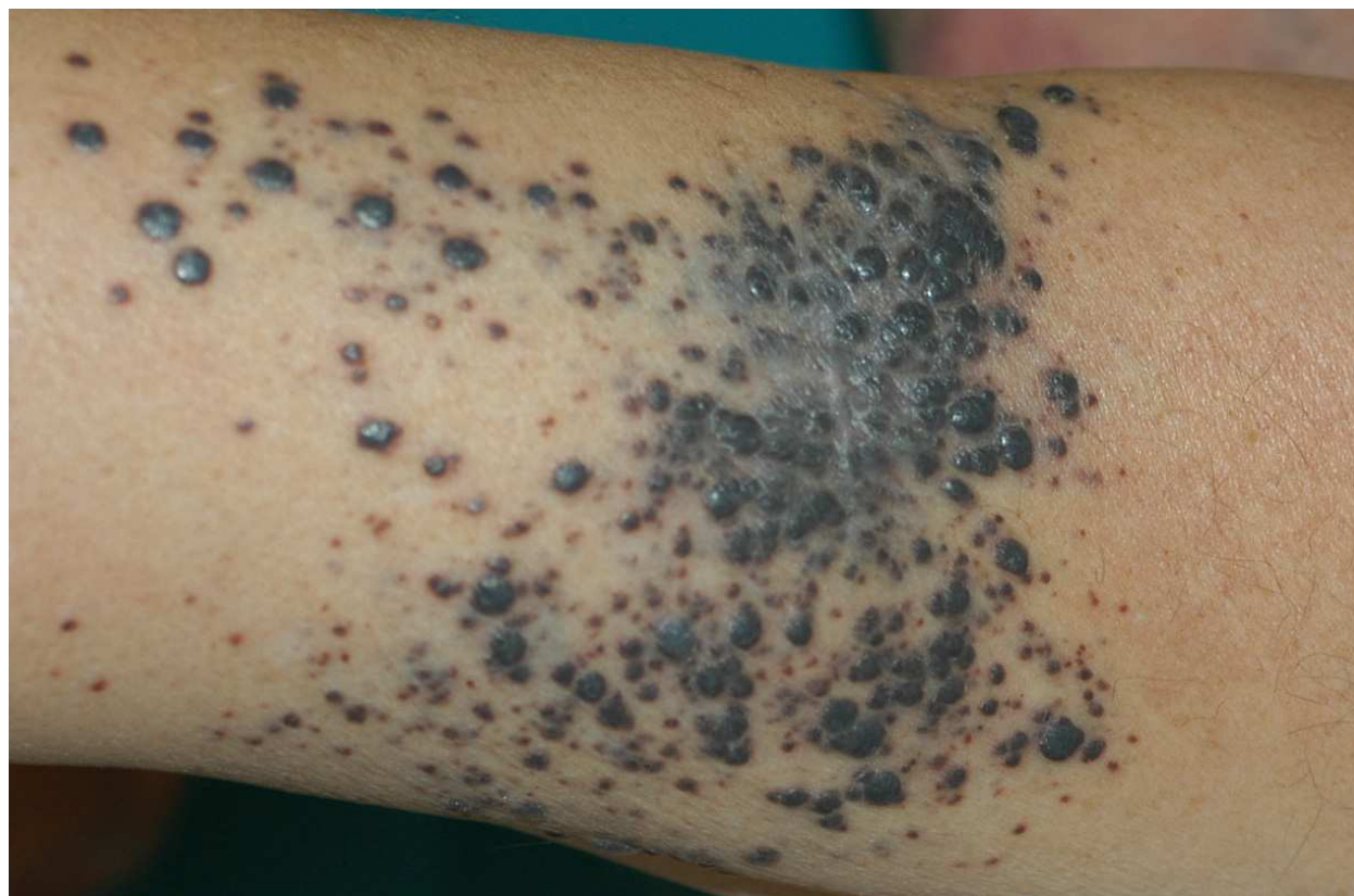
Fig. 1. Clinical features of local recurrences that are defined as the reappearance of melanoma in or contiguous with an excision scar or graft and bearing an in situ component.

Less frequently, a wide morphological spectrum of lesions has been described, including erythematous patches or plaques, inflammatory erysipela-like lesions, diffuse sclerodermiform lesions with indurations of the skin ("en cuirasse" metastatic carcinoma), telangiectatic papulovesicles, purpuric plaques mimicking vasculitis, and alopecia areate-like scalp lesions (Saeed, Keehn & Morgan 2004, Sarya et al 2007). In these cases, clinical diagnosis could be more challenging and metastases can be suspicious for benign entities (Figure 1).