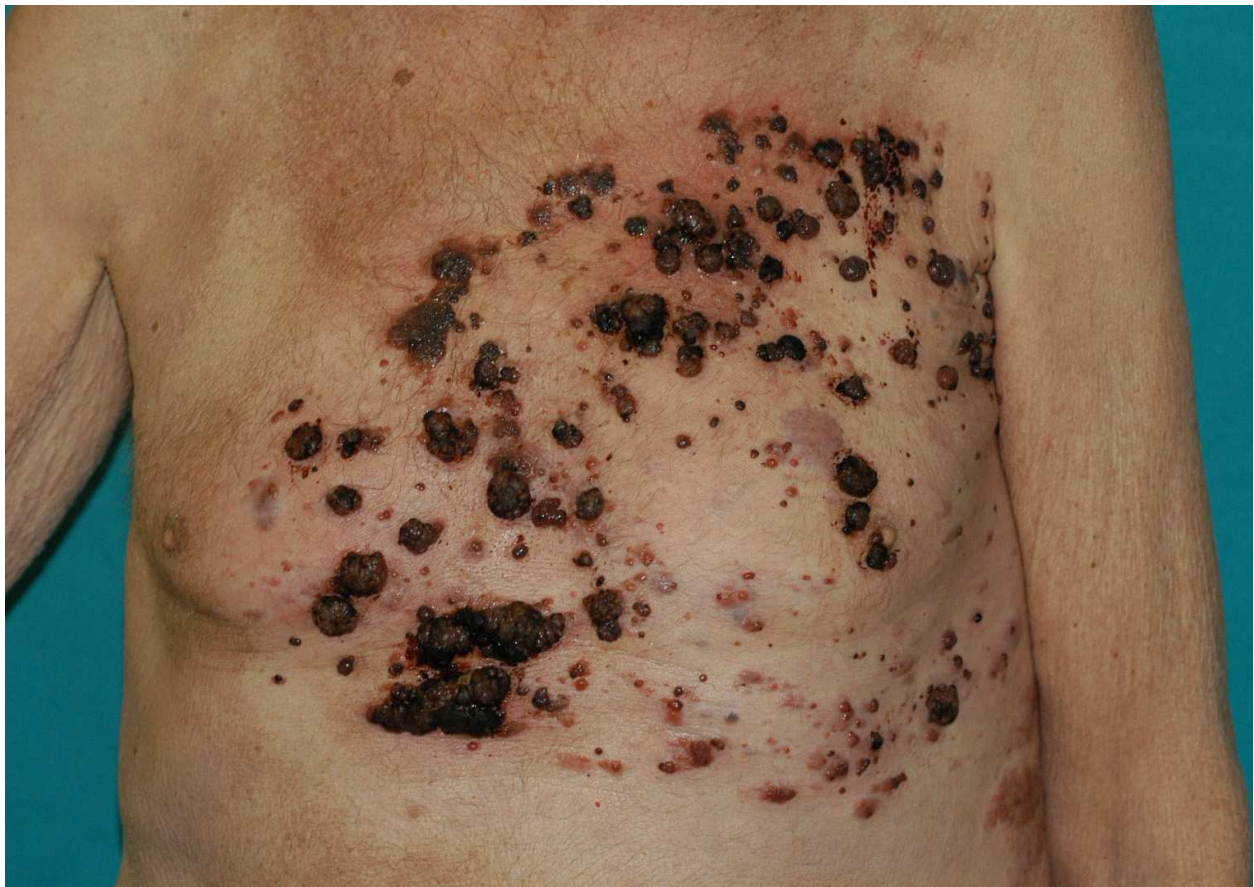
Fig. 2. Zosteriform metastases among thoracic dermatomes.

Moreover, there are also rare cases of so-called zosteriform metastases, with vesicobullous herpetiform lesions or papules and nodules distributed along one or more dermatomes. A previous Varicella Zoster Virus (VZV) infection or widespread lymphatic obstruction by tumor cells can justify the zosteriform pattern (Figure 2).