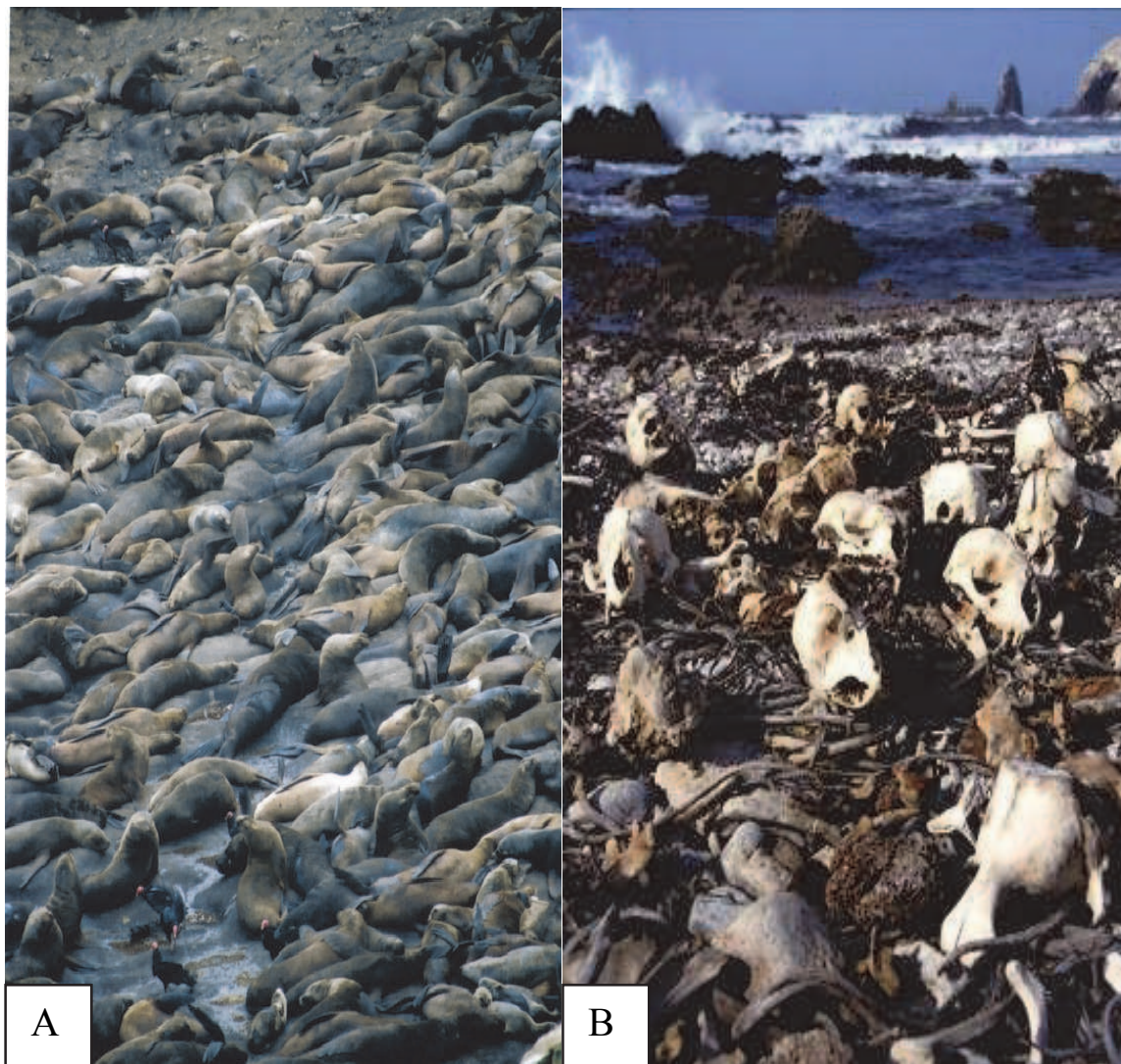
Fig. 1. South American sea lion ( Otaria flavescens ) breeding colony at Punta San Juan, Peru. A. during a non-ENSO period. B. during 1997-98 ENSO.

An important application of N_e in conservation biology is the estimation of the minimum viable effective population size, particularly in cases like the Peruvian fur seals and sea lions that suffered significant declines after an environmental change due to ENSO. Adequate assessment of viability requires, in part, determining whether the population is large enough to avoid inbreeding or to maintain adaptive genetic variation (Vucetich & Waite, 1998). A population with a high N_e retains high levels of genetic diversity and reduces the probability of effects of inbreeding depression. In contrast, a population with a very low N_e is more susceptible to genetic drift and less able to respond to selection. This is because in small populations there is less genetic variation for natural selection to act upon, and there is a higher probability that beneficial alleles will not be maintained by selection and will instead be lost from the population because of random drift effects (Willi et al., 2007). Furthermore, the estimate of N_e reflects the number of individuals responsible for maintaining the genetic diversity of the species as well as its evolutionary potential. Since the goal is the conservation of species as dynamic entities capable of evolving to cope with environmental change, it is