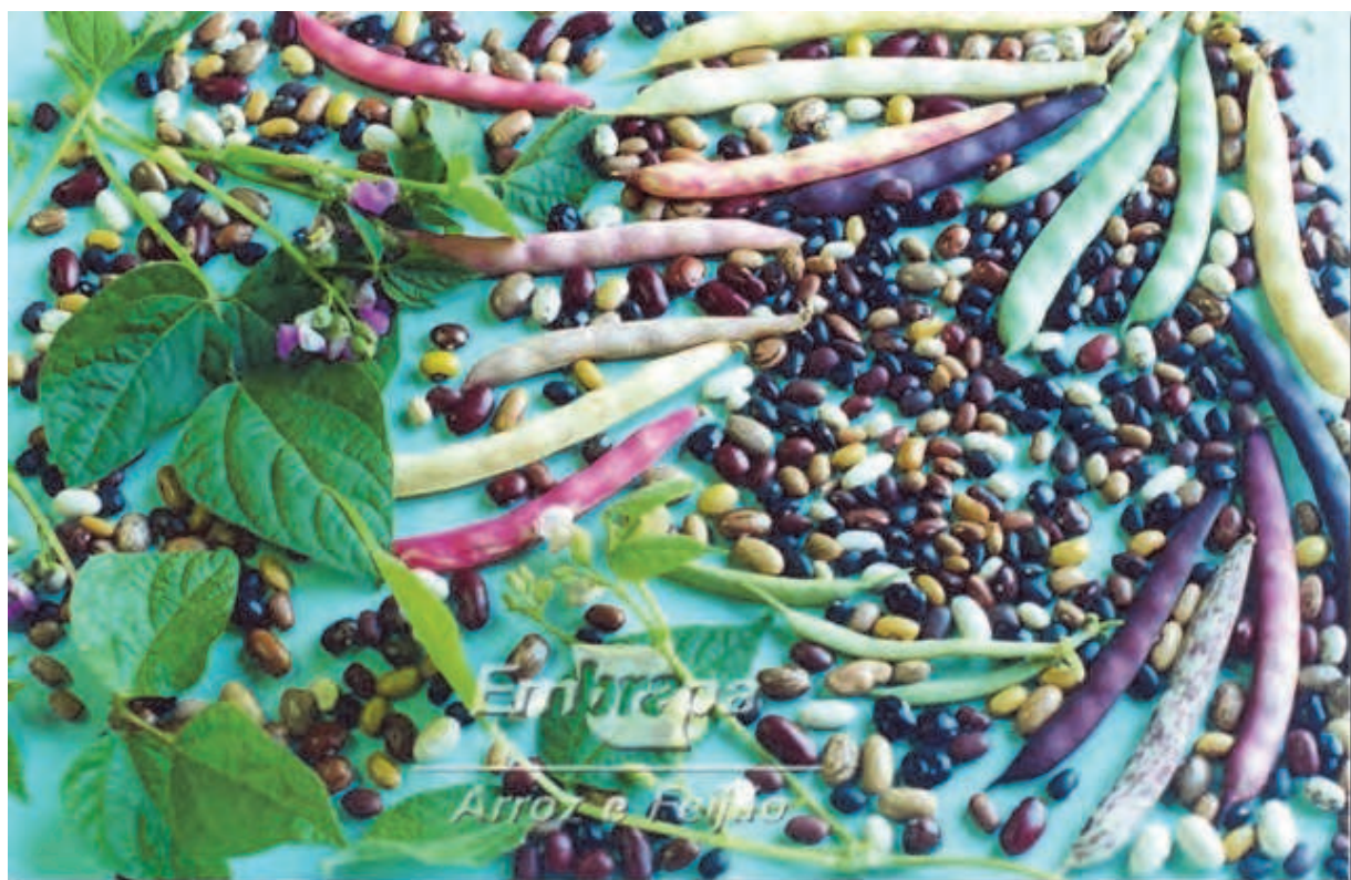
Fig. 1. Sampling of common bean ( Phaseolus vulgaris ) diversity.

The competent maintenance of diversity within crops and their wild relatives, as well as plants with social-economic potential interest, is strategic not only to breeding programs but to pharmaceutical and biofuels industries, food security among others causes. But despite the immense potential that diversity holds for humankind, its unknown value comprises the major risk factor for its irreparable losses. Among the most prominent causes of diversity losses are the high rates of demographic growth and, as a result, the quick devastation of natural resources (Nass, 2001). Tropical and sub-tropical countries, which hold the greatest proportion of biodiversity (Figure 1, Figure 2), are the ones that undergo higher rates of natural devastation.