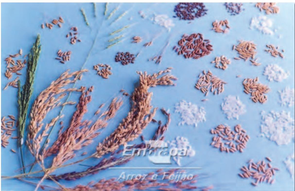
Fig. 2. Sampling of cultivated rice ( Oryza sativa ) diversity. Archives of Embrapa Rice and Beans, Francisco Lins, 1999.

Along with the available tools for the management of diversity there are molecular markers, or “observing” DNA fragments which can be associated to genetic heritable traits.