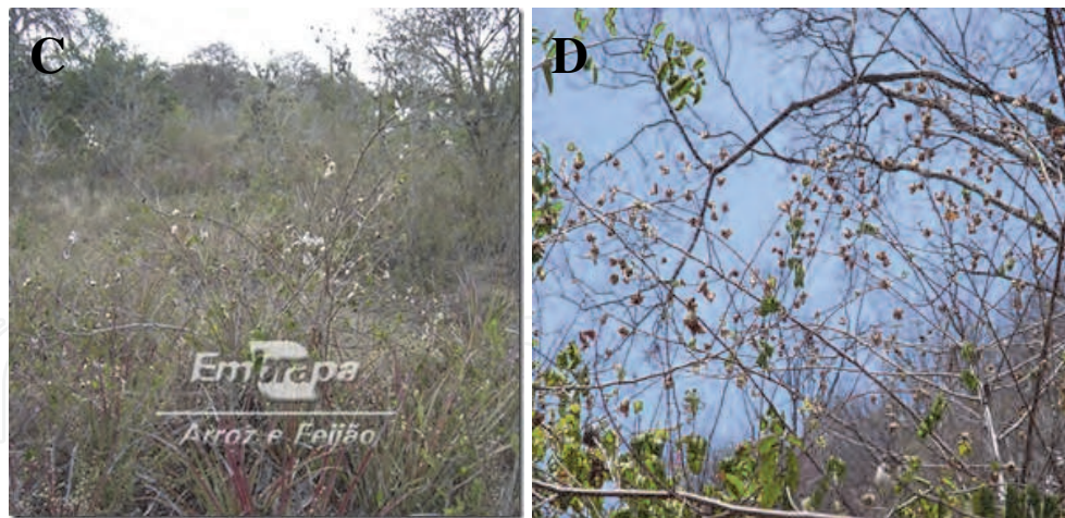
Fig. 5. Gossypium mustelinum , a native cotton species endemic to northeast Brazil semiarid region. While the cultivated cotton (A) retains the fiber and seeds, a trait selected by plant domestication, the seeds of the wild cotton are naturally released from the boll (B) and will be dispersed through streams. Young plants survive due the protection from goat feeding by a common thorn plant Bromelia laciniosa (C). Adult plants can be high (D) so animals damage but not destroy them.