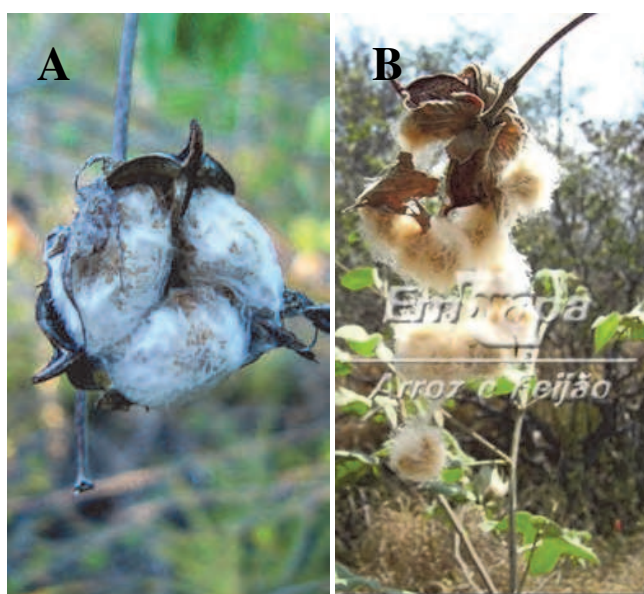
Fig. 5. (Continued)

Because breeding programs are expensive, and a great number of the populations which are conducted may not produce interesting seeds of varieties, models have been developed to use the evaluation by molecular data of candidate parents for prediction of the performance of the population resulting from their crossings (Barroso et al., 2003).