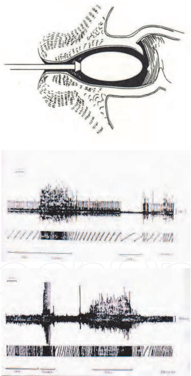
Fig. 2. Rectal balloon expulsion test. Pressure or EMG activity is registered in the anal canal while the subject tries to expel a balloon from the rectum (top). Under normal circumstances there is no increase in anal pressure or EMG activity (middle). In patients with Parkinson’s disease there is paradox contraction of the external anal sphincter (bottom).

Anorectal physiology tests are only performed in a minority of patients with PD. The most common tests are manometry of the anal canal at rest and during squeeze, sensation during rectal balloon distension and anal manometry at attempted defecation of a balloon (Ashraf 1995, Edwards 1994, Mathers 1988). The later test is the most important in patients with PD as it may reveal abnormal contraction of the external anal sphincter during attempted defecation. Evacuation proctography is performed after installation of barium contrast in the rectum. The subject is seated on a commode in front of the camera and videoradiography is taken during attempted defecation. The method may show structural changes during defecation and it gives a semi-quantitative description of incomplete evacuation. It is, however, rarely performed in PD. New methods such as evacuation scintigraphy may have a future clinical role (Krogh 2003).