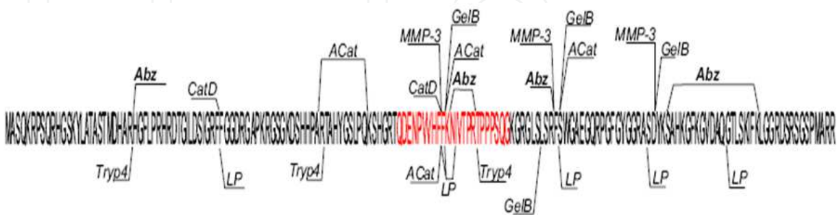
Fig. 1. MBP sites of proteolysis by different enzymes-proteases and Abs-proteases and as a result of spontaneous autocatalytic hydrolysis. The sequence of the encephalitogenic peptide 81-103 is shown in red. Abbreviations: GelB (Gelatinase B), MMP-3 (matrix metalloproteinase-3), CatD (Cathepsin D), ACat (Autocatalytic cleavage), Abz (Abzyme), LP (Lysosomal Proteases), Tryp4 (Trypsin 4).

Different from MOG, and PLP (proteolipid protein), MBP is found in both central and peripheral myelin, and MBP transcripts have also been demonstrated in peripheral lymphoid organs such as lymph nodes and thymus.