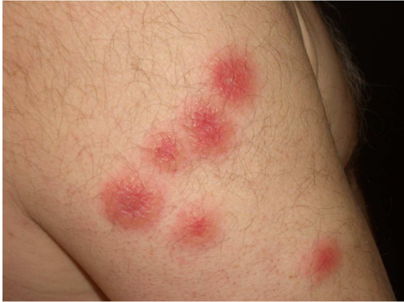
Fig. 1. Erythematous plaques with vesicular and bullous appearance due to a intense dermal edema.