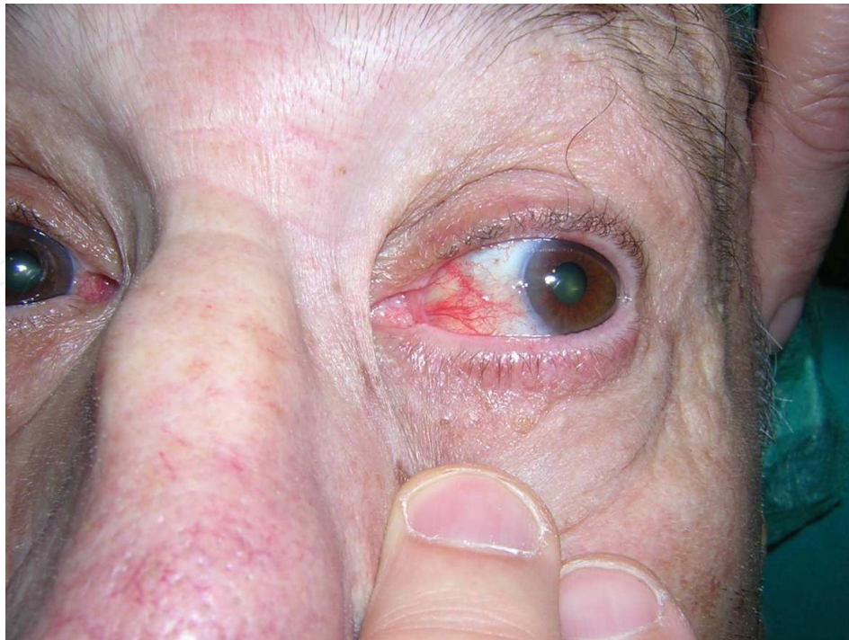
Fig. 3. Epiescleritis in a patient – with Sweet syndrome