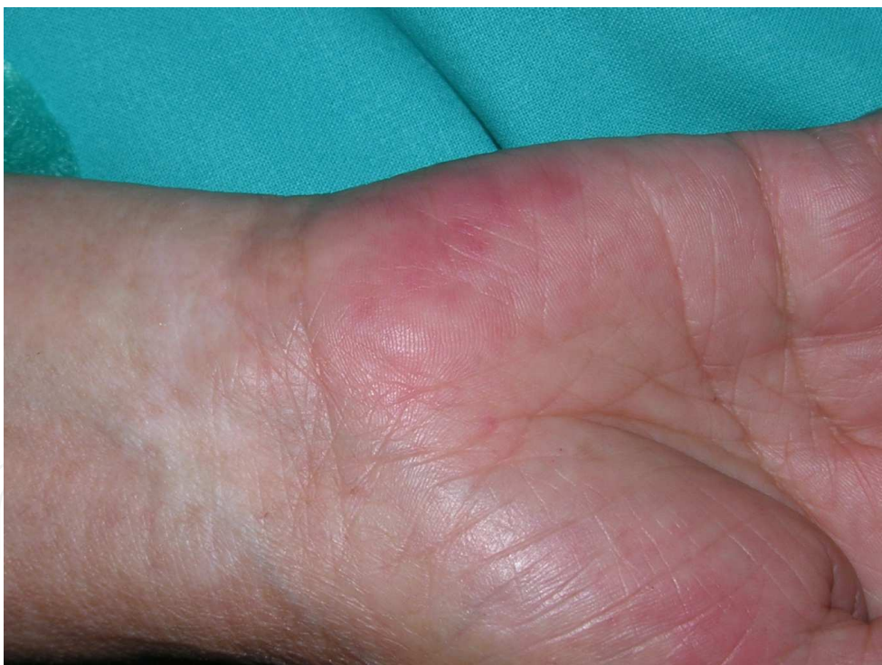
Fig. 2. The plaques on tenar and hypotenar skin have frequently a characteristic appearance of "mountain range"