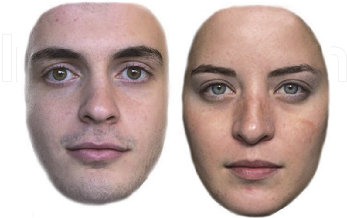
Fig. 1. Fig. 1. Example of a female face (right) and a male face (left)

resolution of 72 pixels. The faces were presented by a Pentium 2 computer on a 17" screen with SuperLab Pro for Windows.