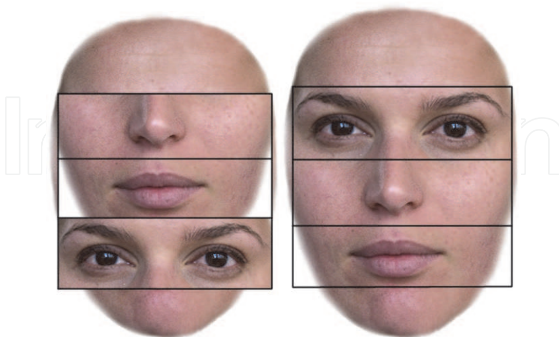
Fig. 2. Example of a "face" stimulus (right) and a "non-face" stimulus (left)

Classification task: The 80 faces, modified by Adobe Photoshop 6.0 ME so that the eyes, nose, and mouth were each surrounded by a rectangle, were considered "faces". "Non-faces" were created by jumbling the internal features of these stimuli (Figure 2).