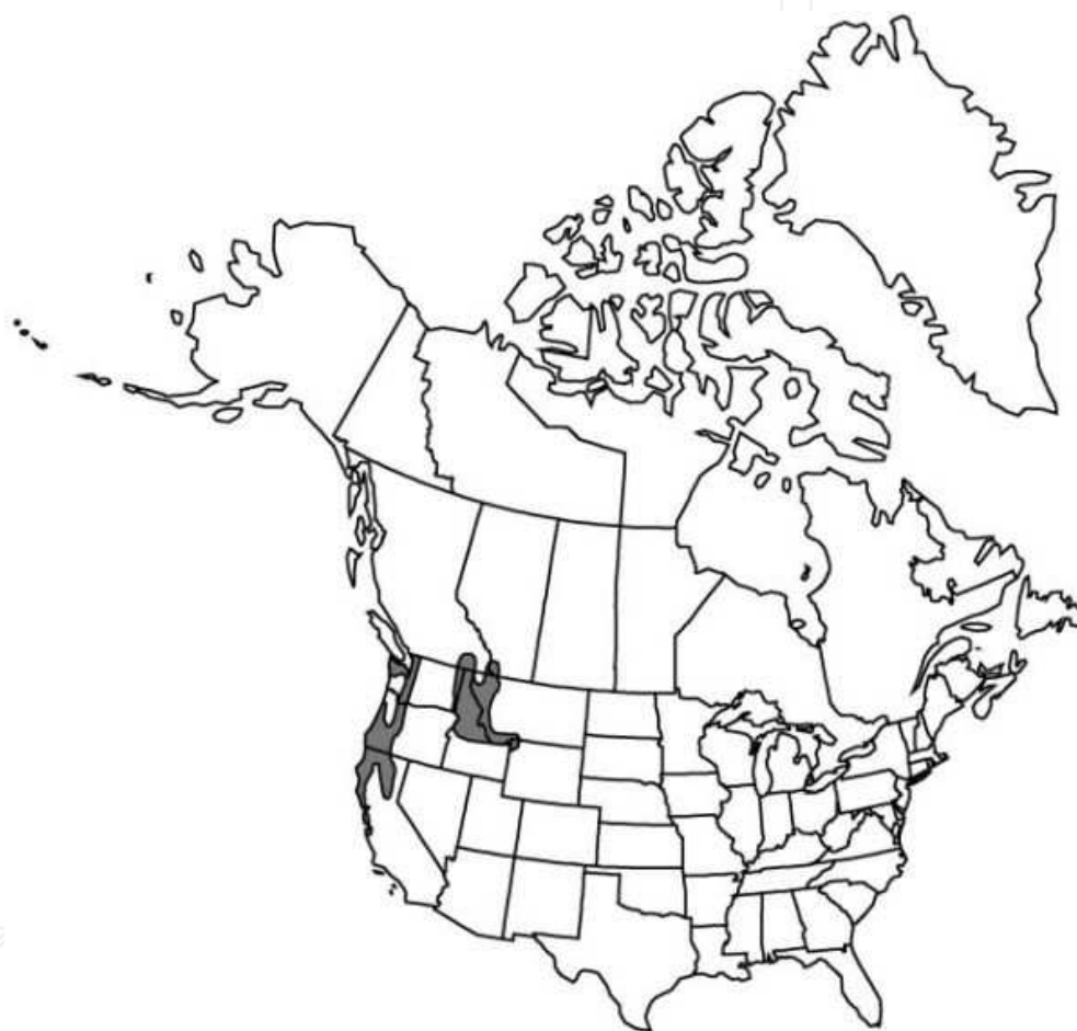
Fig. 2. Distribution of beargrass in western North America.

Across the range of beargrass many changes are occurring in the frequency, intensity, and severity of natural and anthropogenic disturbances, including fire regimes, timber management, and leaf harvest practices. These changes impact the plant, its pollinators, and the people who use it in an interconnected web of ecosystem relations that are incompletely understood. We suspect that these impacts are – or could be – negative for multiple species and some of the people that are part of the ecosystems where beargrass grows; indeed, they have already been detrimental for some cultural uses of beargrass. Thus, beargrass offers one example of how terrestrial ecosystem conservation strategies might be developed and implemented, taking into consideration both the ecological and social importance of a species within an ecosystem.