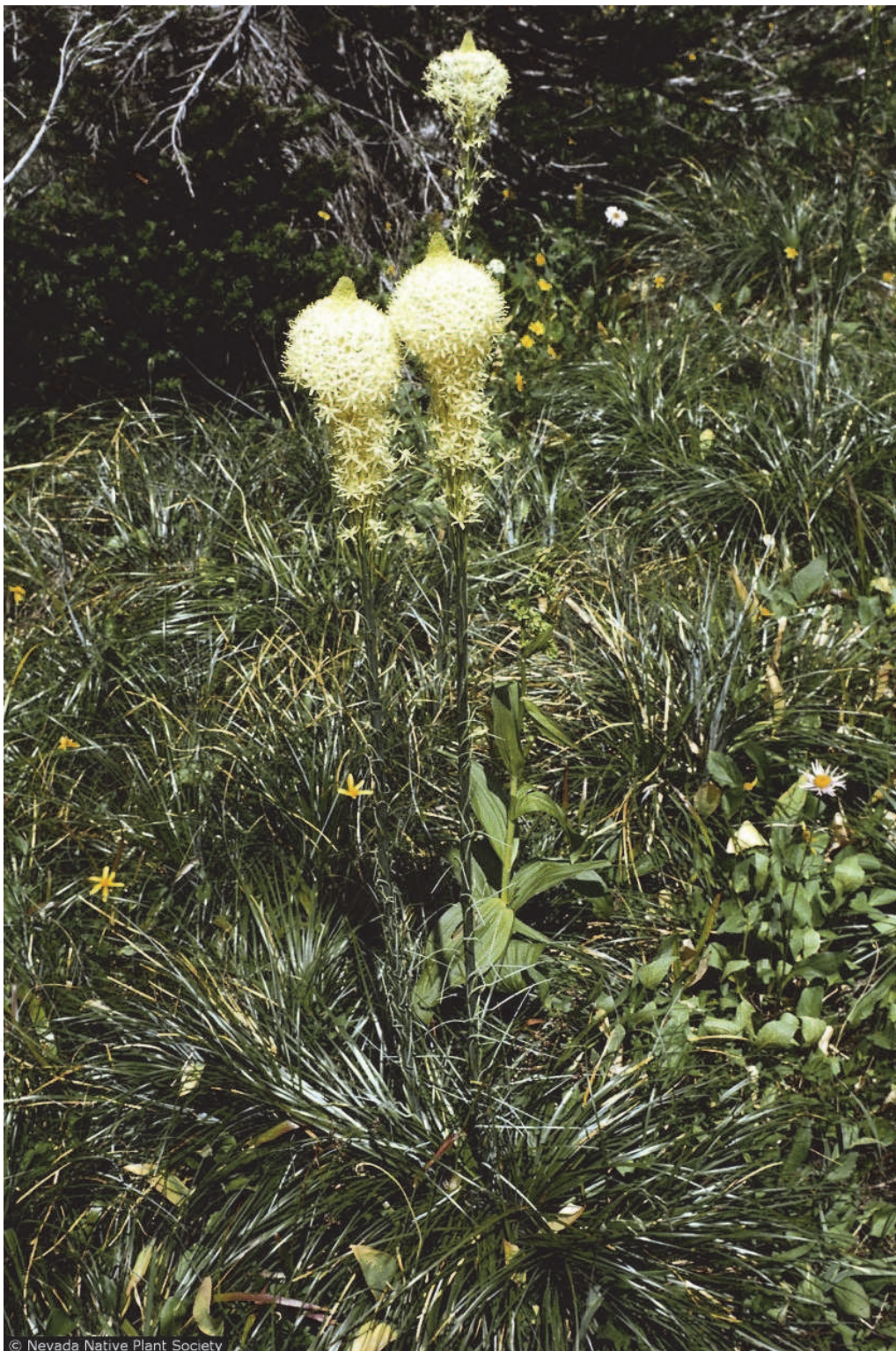
Fig. 1. Beargrass ( Xerophyllum tenax ).

cultural and economic value. For centuries the plant has been used by Native Americans, who harvest the leaves for basketry and other uses. In recent decades, beargrass has become an important part of the international floral industry because its leaves are useful for different decorative products.