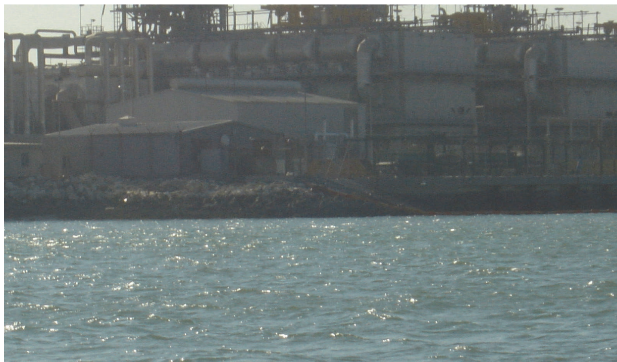
Fig. 4. Sitra Power and Water Station.

Bahrain, like most of the Arabian Gulf countries, depends mainly on desalination seawater as a source of potable water. In Bahrain, there are currently four major desalination plants producing fresh water and energy (Zainal et al., 2008). Sitra Power and Water Station (SPWS) is the largest plant in Bahrain (Fig. 4) with a capacity of 125 megawatts of electrical power and around 100 \times 10^6 L day -1 of desalinated water using multi-stage flash technology (Khalaf & Redha, 2001).