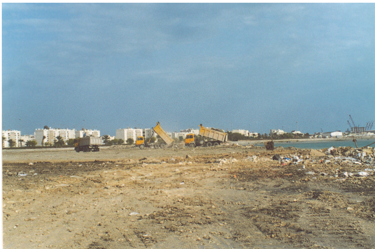
Fig. 2. Reclamation of sandy and muddy coasts of Tubli Bay.

direct removal and burial of macrobenthic assemblages in the coastal and marine environments. Therefore, biodiversity and abundance of macrobenthos are severely affected by mortality and smothering associated with dredging and reclamation activities.