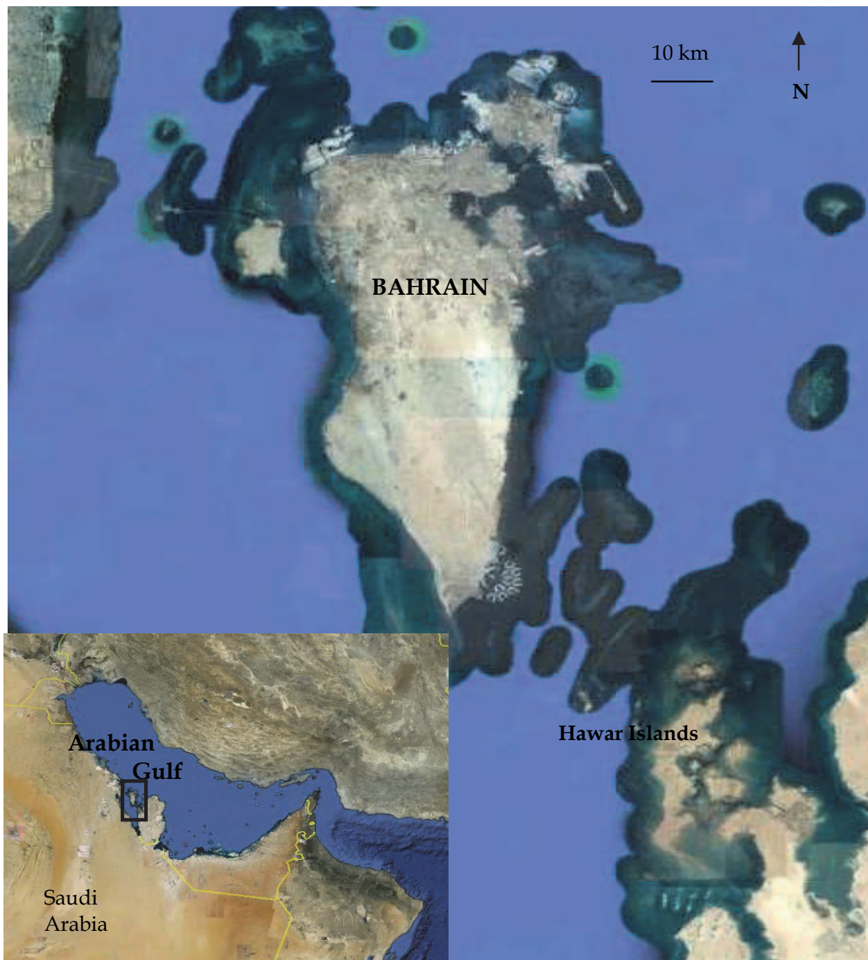
Fig. 1. Maps showing the Arabian Gulf and Bahrain.

particularly in south of Bahrain, where salinity could reach 70 - 80 psu in areas with restricted water flow such as tidal pools and lagoons (Al-Zayani, 2003).