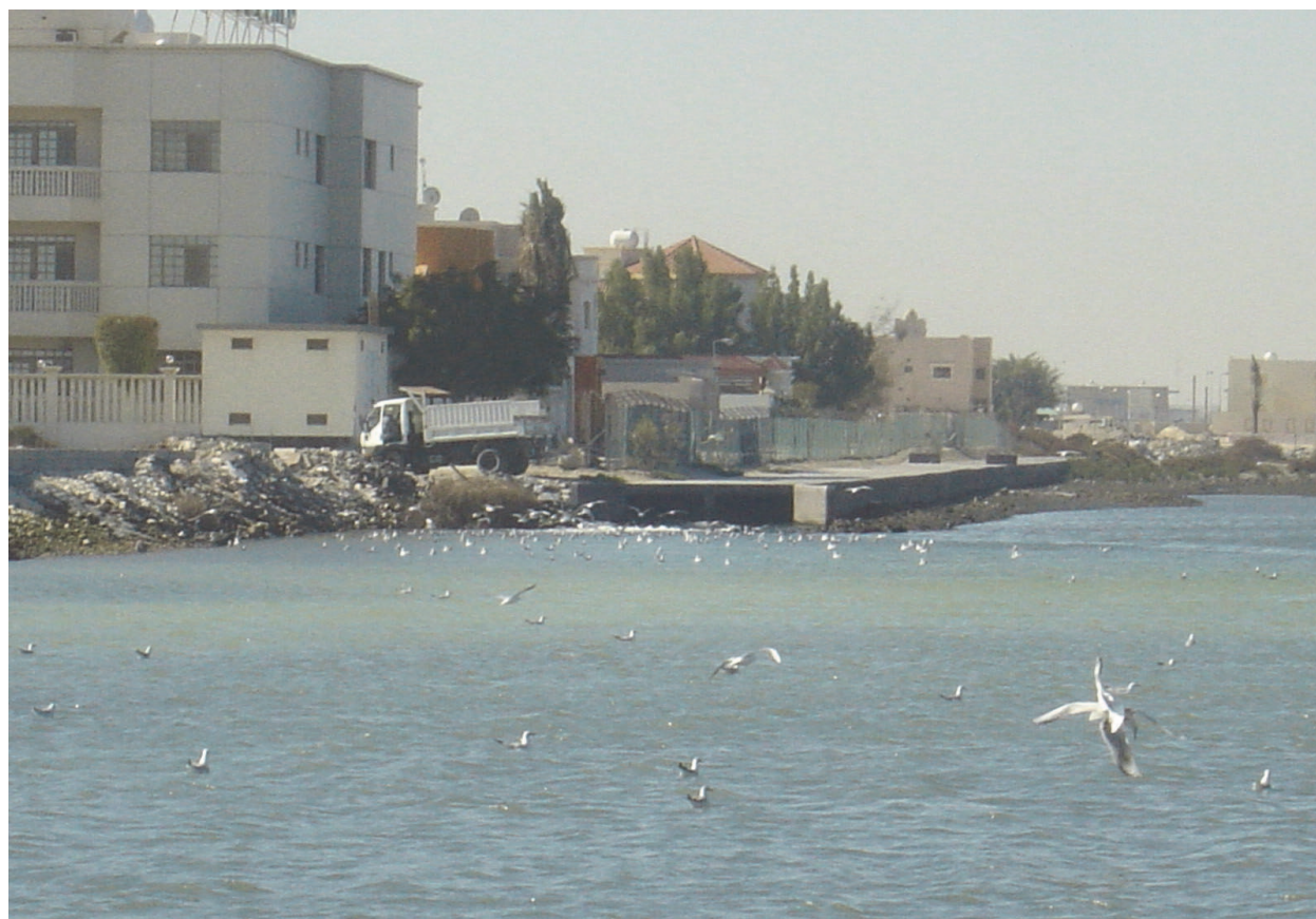
Fig. 3. The outfall of Tubli Water Pollution Control Centre, the main sewage treatment plant in Bahrain.

Sewage effluents are major sources of coastal pollution in Bahrain. Several sewage treatment plants varying in size and degree of treatment are discharging effluents to the coastal and subtidal areas in Bahrain. The main one is Tubli Water Pollution Control Centre (TWPCC), which discharges around 160,000 \text{ m}^3 \text{ day}^{-1} of treated effluents into the shallow water of Tubli Bay (Fig. 3). These effluents are characterized by high-suspended solid reaching up to 290 FTU. Seawaters adjacent the TWPCC are distinguished by high load of nutrients such as ammonia, nitrate and phosphate with concentrations reaching 1.40, 0.90, and 3.60 \text{ mg l}^{-1} respectively. In particular, phosphate largely exceeded the maximum value of 2.0 \text{ mg l}^{-1} recommended in the Bahraini effluent standards (Naser, 2010a).