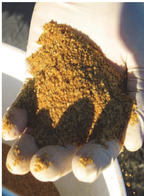
Photo 1. Typical sample of DDGS from ethanol production.

Over the past 15 years, dry-grind corn processing has become the primary method for producing ethanol in the U.S., favored over wet milling and dry milling (Rausch and Belyea, 2006; RFA, 2011). The simplified steps for making ethanol from corn using the dry-grind method are 1) mixing ground grain corn with water, 2) cooking the mixture and adding amylase enzyme, and 3) liquefying the mixture and adding glucoamylase enzyme and yeast for fermentation. The products of fermentation are ethanol, water, and solids. The solids, also referred to as “whole stillage”, are removed from the bottom of the fermentation unit and centrifuged to separate the solids into wet grains and thin stillage. The thin stillage is generally evaporated to form a thick syrup, which is added back to the wet grains. These wet grains are referred to as wet distillers grains with solubles (syrup) added, or WDGS. The final step of this process is to dry the wet grains to form DDGS with solubles (syrup) added, or DDGS (Rausch and Belyea, 2006).