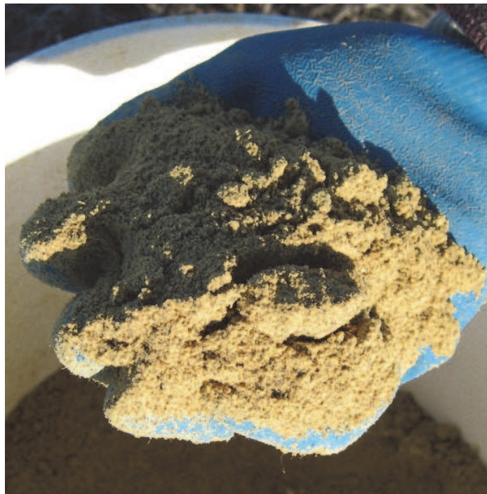
Photo 2. Typical sample of canola meal from oil-pressed canola seeds.

The main components used to make biodiesel are soybean or canola oil and an alcohol source, typically methanol. Seed meal byproducts are left after oil is extracted from soybeans and canola oil. While the methods used for extracting oil vary slightly between soybeans and canola seeds, oil is extracted from most oilseeds through a process of cleaning, drying, dehulling, size reduction, flaking, cooking, and tempering (Dunford). The most critical step of this process is cooking/tempering, which is also referred to as conditioning. During this step, oilseeds are cooked or tempered to denature proteins, which releases oil from the seeds and inactivates enzymes. Once they reach a specified temperature, cooked/tempered seeds are pressed to separate oil from the seed. The portion of seed solids remaining after this process is referred to as the meal. The oilseed meal can be used immediately as an animal feed without further treatment.