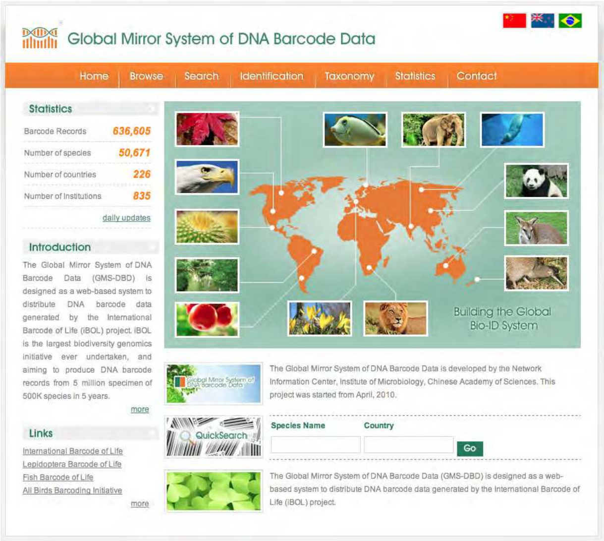
Fig. 4. Homepage of the mirror of BOLD data.

One of the main tasks of iBOL project is to setup global mirror sites for DNA barcode data, and this is assigned as the mission of working group 3.2 (that is chaired by the author Juncai Ma). Mirror sites play roles not only for data security but also for the global access and use of DNA barcode data fast and stably. In addition to iBOL’s task, the Chinese DNA Barcode of Life Information Systems requires to mirror BOLD as well. For the current stage, the entire BOLD system is difficult to mirror, in both the storage and the analytical workbench. For this reason, we developed the mirror site of BOLD data ( http://www.boldmirror.net ) (Fig. 4) in China in 2010, and served it as one of the major components of the Chinese DNA Barcode of Life Information Systems. In late 2010, we started to encapsulate the mirror site into a distributable mirror system, namely the Global Mirror System of DNA Barcode Data (GMS-DBD). Different from BOLD systems, GMS-DBD is designed and currently served as a system for the presentation and analysis of DNA barcode data only, but not the management of DNA barcode projects. Moreover, GMS-DBD is designed to feature in the fast deployment and fast use of the DNA barcode data.