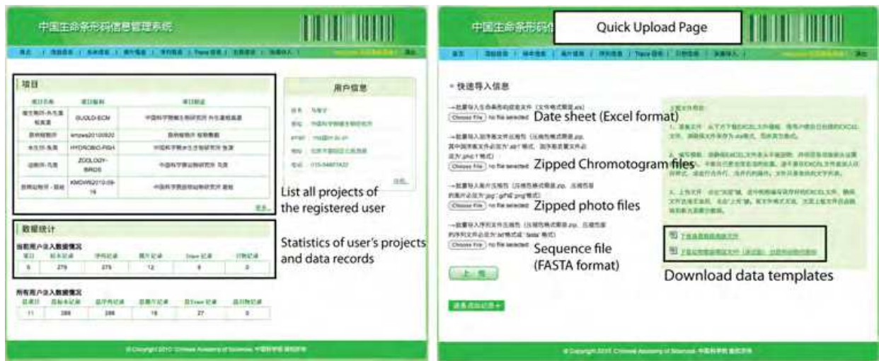
Fig. 6. Snapshots of DNA barcode management system in China. Left, user’s project page, summarizing the projects and records. Right, Quick Upload Page.

BOLD has exemplified the management of DNA barcode data as a centralized data centre and shall be the reference for the development of core functionality of the Central Nodes. However, the development of such a comprehensive system needs a long period, and inapplicable for the immediate use. Moreover, things are to some extent different in China than in Canada. First, there is no constructed barcoding centre like CCDB before varied DNA barcoding projects were issued. Second, the research campaigns studying animal, plant and fungus barcoding respectively have already defined the working structure for