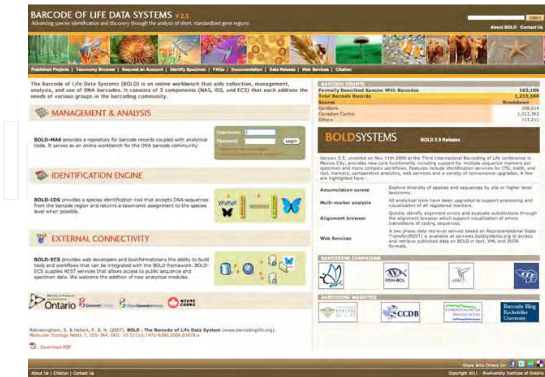
Fig. 2. Homepage of Barcode of Life Data System (BOLD).