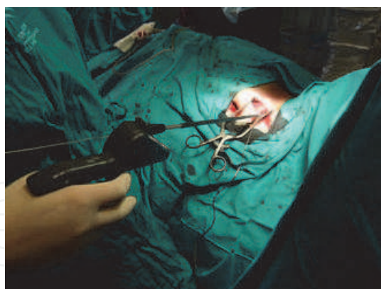
Fig. 1. Intraoperative image of a lead extraction with an electro-surgical sheath.

Compared to laser ablation, electro-surgical sheaths are designed to be more supple so that they may be easier to maneuver. The radiofrequency energy is confined to less than one fourth of the circumference of the sheath allowing a directed and careful dissection of the tissue and reducing the chance of vascular damage; but in the other hand this directional control reduces the cutting efficacy through the fibrosis (Verma & Wilkoff, 2004).