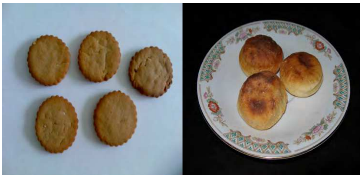
Picture 1. SPI enriched cookies (left) and SMP-enriched cookies (right).

styles, to minimize differences in energy intake from day to day, to maintain their body weight, and to avoid the use of lipid-lowering drugs throughout the study. The physical characteristics, nutrient intake, and physical activities of subjects were documented. The blood samples were taken after a lead-in period of 2-3 weeks. Samples of serum were frozen and analyses of lipids, GPT and GOT were performed. From the total number of subjects thirty (9 males and 21 females) aged 32 - 64 years were selected on the basis of ability to follow the protocol. The inclusion criteria were overweight (BMI 25-34 kg/m 2 ), fasting serum total cholesterol 240-330 mg/dL, non-HDL-cholesterol 150-280 mg/dL, HDL-cholesterol 40-70 mg/dL, and triglycerides 100-280 mg/dL. The exclusion criteria were the presence of endocrine, liver, renal and gastrointestinal diseases. The protocol was approved by the Amur State Medical Academy Ethics Committee in accordance with the Helsinki Declaration on human studies. Informed consent from all participants was obtained in writing.