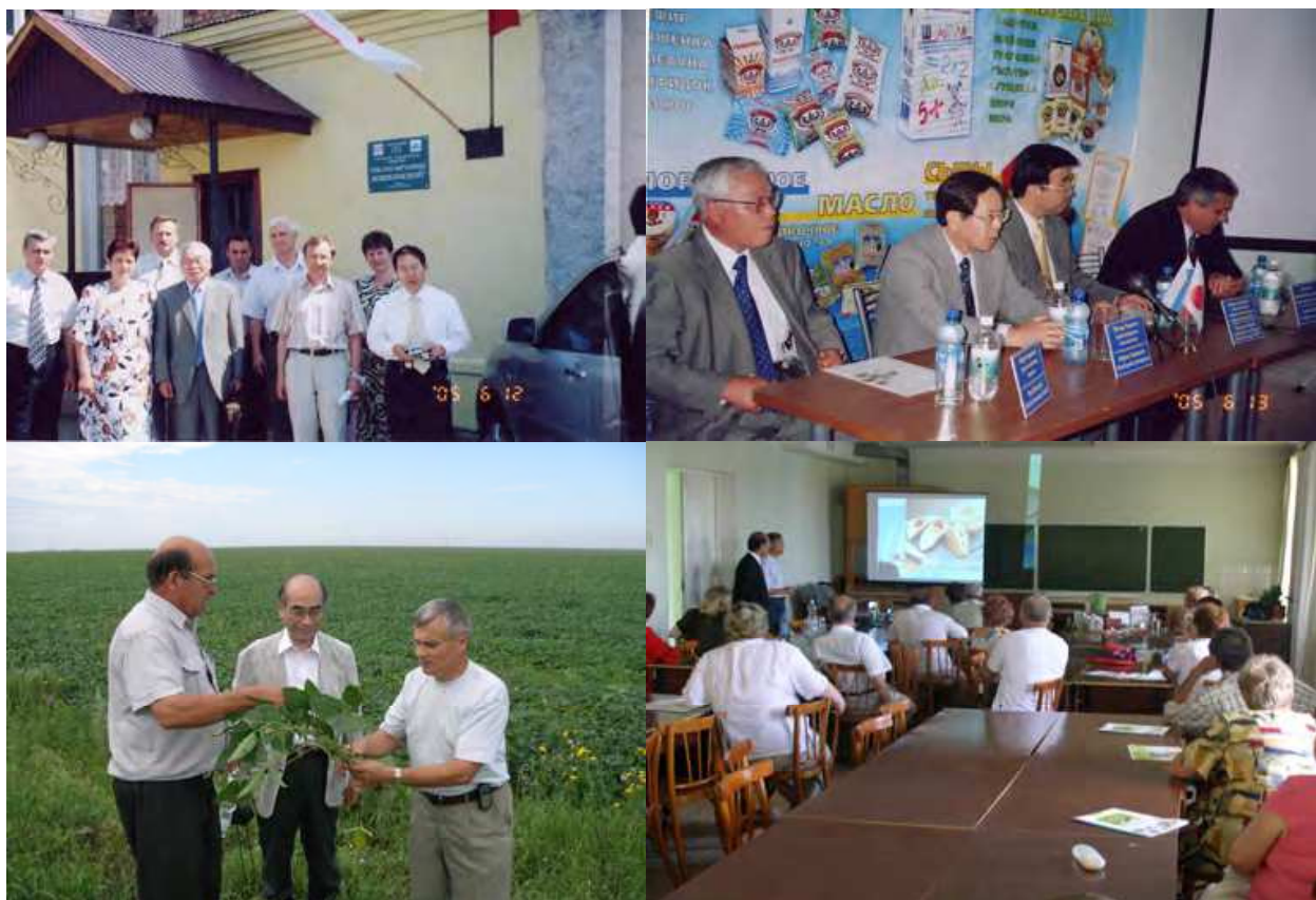
Picture 3. Promotion campaign of the Fuji Oil Co (Osaka, Japan) in Russia (2005-2007 years) The visit to the milk plant “Alev” (up left) and the conference with the mass media, medical specialist and cookery experts (up right) in Ulianovsk region; soy field in Amur region (bottom left); meeting with the participants of the study in the biochemistry department of the Amur State Medical Academy –(bottom right).

Russian people. This informational support should be constant and prolonged. Our experience of promotion of soy foods in Russia with a help of specialists from Japan (Fuji Oil co.) shows that when Russian people have a chance to taste modern soy foods produced in Japan, they highly praised these foods and express desire to consume them (picture 3).