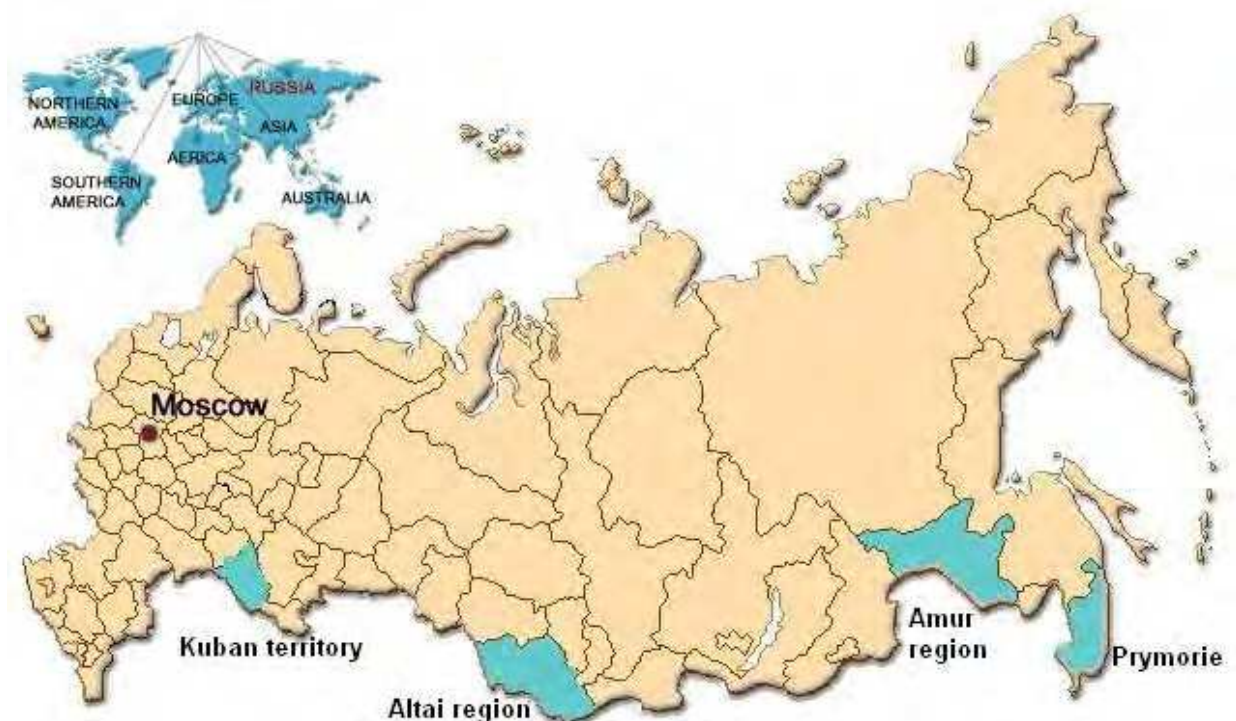
Picture 2. Soy planting in Russia. The regions farming soya are colored in turquoise (blue/green).

Initially, soybean was brought to Russia from northeastern China. Currently, soybean is planted in the Far East of Russia (the Amur region and Prymorie), the Altai region and in the Kuban territory near the Black Sea. (picture 2).