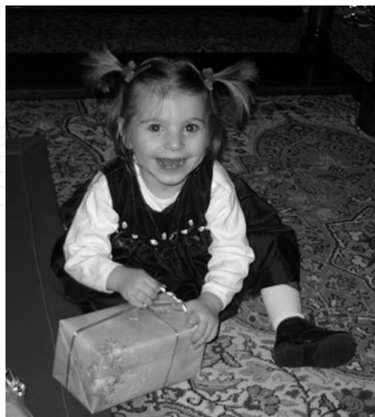
Fig. 1. Facial characteristics of a child with Angelman syndrome. Visual contact, fair eyes, midface hypoplasia, wide smiling mouth.