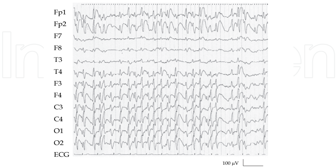
Fig. 1. Electroencephalography (EEG) tracing taken during sleep in case 1. Such patterns occupied 85 % to 90% of the hours normally given to slow-wave

The first patient was a male who presented with complex partial seizures at 4 years of age. The patient was born normally, and his psychomotor development was normal before the onset of seizures. The patient’s history of illness and the family history were noncontributory. EEG revealed sharp waves at bilateral centro-temporal regions superimposed on normal background activity. Carbamazepine (CBZ) was started initially. At 6 years of age, he started exhibiting atypical absence seizures. On the EEG, the ESES pattern was revealed (Fig. 1). He became irritable, hyperactive, aggressive and disinhibited, displaying difficulty interacting with his environment. Treatment was changed to using valproate sodium (VPA). However, no improvement of his clinical state was recognized. Clobazam (CLB) was started in addition to VPA, which led to improvement. Eleven months after replacement of antiepileptic drugs (AEDs), the ESES pattern resolved with no further seizures. However, he presented a progressive cognitive and behavioral deterioration up to the present, and IQ dropped from 85 to 67 of total score. The duration of the CSWS period was 14 months.