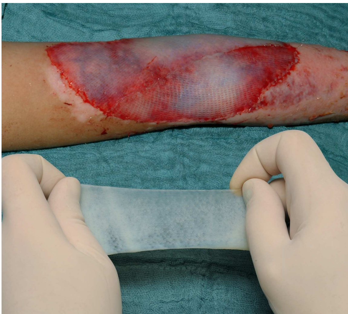
Fig. 2. Example of Glyaderm

This novel dermal substitute is called Glyaderm, which is an abbreviation for Glycerol-preserved Acellular Dermis. Before application of Glyaderm, the wound bed must show viable granulation tissue. In most cases, woundbed preparation with allogeneic donor skin is needed; in burns this takes about 7 days after debridement. Glyaderm is preserved in