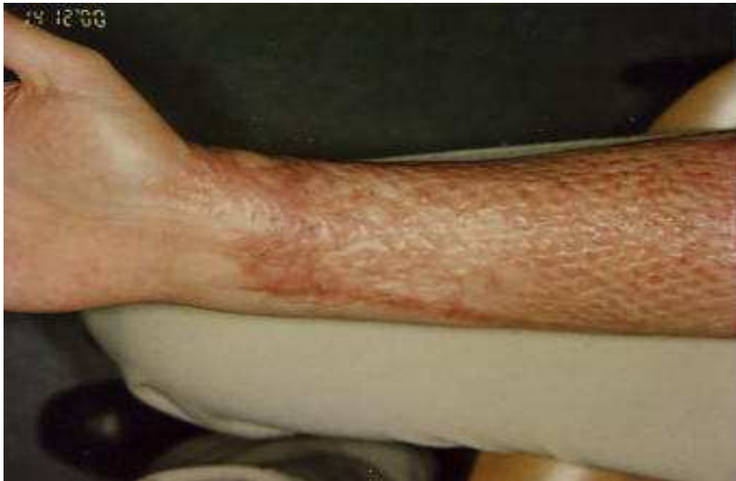
Fig. 1. Typical scar formation results after sandwich grafting, the mesh of the autologous skin graft pattern is still visible.