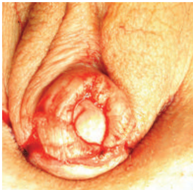
Fig. 2. Buried penis with normal abdomen and scrotal skin and poor penile shaft skin

Surgical approaches vary and should correlate to the etiology of the buried penis. Some patients present with a normal sized scrotum and abdomen without a pannus (Figure 2). In corollary, many patients suffer from a lack of penile skin as in an over exuberant circumcision. In simple situations like this, the penile skin is released and approximated to the base of the penile shaft, and the defect is covered by split thickness skin grafts. In more complicated scenarios, as in a patient with scrotal lymphedema or an abnormally large abdominal pannus, a more aggressive reconstructive surgical approach is mandated.