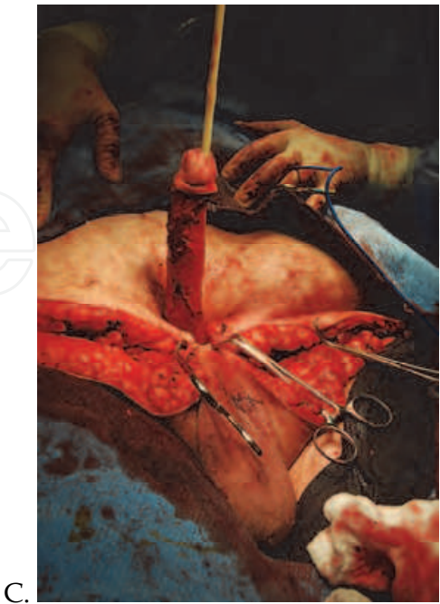
Fig. 3. C: The male escutcheon is reestablished.