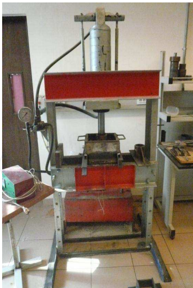
Fig. 9. The hydraulic press used

The required thickness is obtained via right weight selection for the mix and adjusted using thickness cutter.