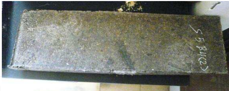
Fig. 10. The sample obtained after pressing