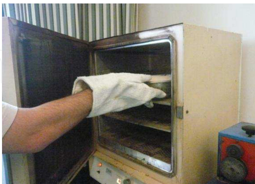
Fig. 2. Oven used to dry waste wood

The dryer used was set at 115 C to avoid wood waste burning. The meshed wood waste is left for 4 hours in the dryer to get rid of the moisture (see figure 2). It was assured that the moisture was totally eliminated through a test that was done. The test consisted of taking two samples of wood waste; sizes of up to 0.5mm and 1.18mm, utilized within experiments and weighs it through a calibrated scale. Then, it was left in the dryer for 2 hours then weighed. Each hour after the second hour, it was weighed. At the 5th and 6th hour the weight was not changed for the two types. Therefore, it was concluded that 4 hours was sufficient to dry the meshed wood waste. The experiment was repeated 3 times to guarantee the results.