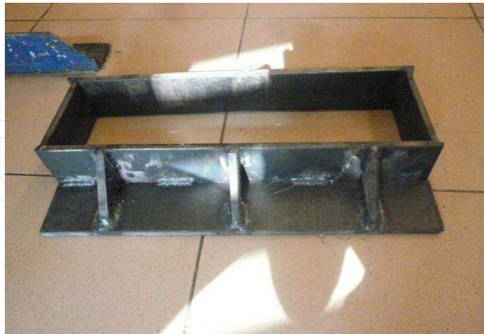
Fig. 8. The custom made die

(see figure 8) to accommodate the size required for the ASTM D 4761 test of flexural test. A sample obtained after pressing is show in figure 10.