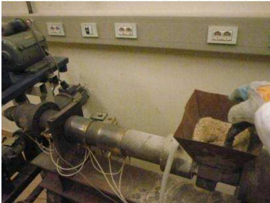
Fig. 3. Feeding the extruder with the mixture

Before feeding the extruder (single screw extruder), the plastic is mixed; using a mixer, with wood waste and talc (if any). The plastic used; which is composed of a mix of HDPE and LDPE with 25 % and 75 % respectively, has the shape of small particles. This mix is composed of shredded plastic waste obtained mainly from garbage plastic bags which are highly contaminated. The talc is used as a mineral additive; to enhance mechanical properties, with percentages varying from 0 to 35 percent by weight of the total. The mix is then being fed into the hopper of the extruder and the process starts as shown in figure 3.