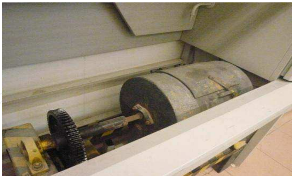
Fig. 7. The furnace used for heating the shredded particles to form a paste

The furnace works for about 15 min at 140 C to form a paste which is then taken to be pressed (see figure 7). The temperature was decided based on pilot trials aimed at forming a homogenous paste without burning.