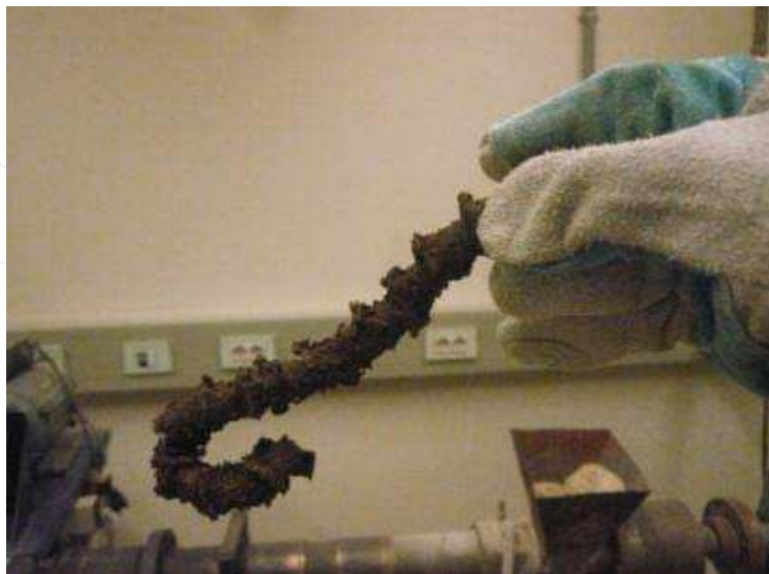
Fig. 5. The final shape of the extrudate

The extrudates (see figure 5) are crushed in the shredder (see figure 6) forming small particles with identical sizes to be fed into the furnace. The shredding operation was important as it avoided bad distribution of the mix during furnace heating within experimentation. As this process at first; during the pilot trials, was done without shredding which resulted in several cases of non homogenous final product. The main reason behind this that the extrudates have different sizes and the material's concentration within each extrudate wasn't distributed the same. Therefore, it was decided to use a shredder.