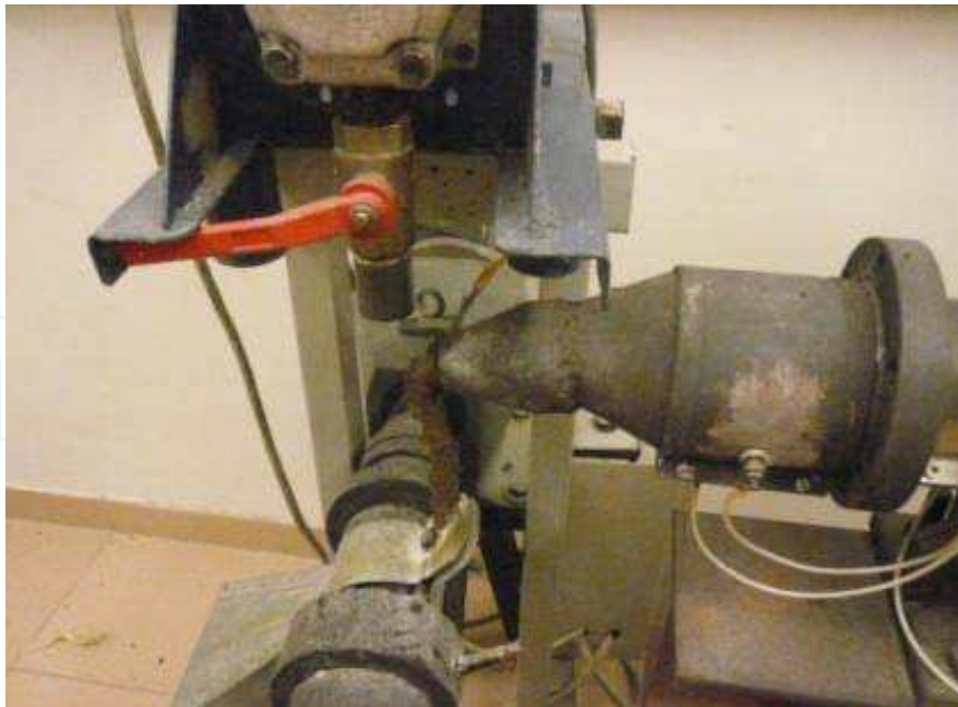
Fig. 4. The hot extrudates coming out of the extruder