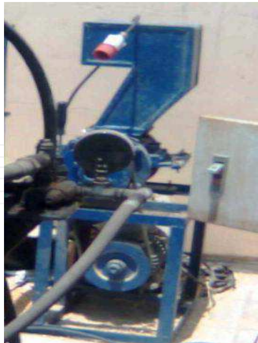
Fig. 6. The shredder adopted in crushing the extrudates