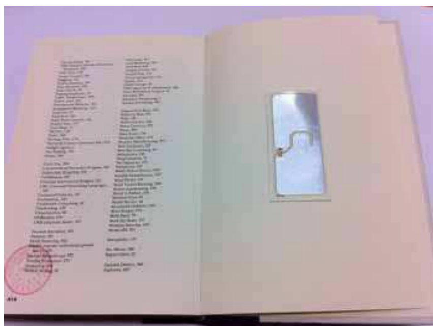
Photo 1. In the pilot test conducted by the CityU HK Library, UHF RFID tags were randomly placed in four different positions at the back covers of the books. The photo shows one of the selected positions.

For the case of the CityU HK Library, the UHF RFID tags that the Project Team has used in its pilot test were of an optimal size with a dimension of 72mm x 30mm. The Semi-Closed Collection where the pilot test was conducted is a very small room of about 75sq.m. only. The self-check machines, the self-return machines and the security detection gates are all in proximity. For instance, the security detection gates are only 4.5 meters away from the nearest bookshelves. Therefore, the Project Team must be even more cautious when choosing the tags. Different tests have been performed to ensure that the size of the buffer zone required around the detection gates is kept to a minimum and at the same time the self-check machines can read the most number of tags when books are placed on top of them so as to maximize the benefit of multiple item identification at the check-out process. In the Semi-Closed Collection, the UHF RFID tags have been placed at the back covers of books with a book plate of 150mm x 100mm on top to act as a camouflage to hide the tags from the scene (Photos 1 and 2). To reduce the tag masking probability, during the tagging process, tags have been randomly placed in four different positions behind the book plates. However, the additional book plates mean additional costs and labour.