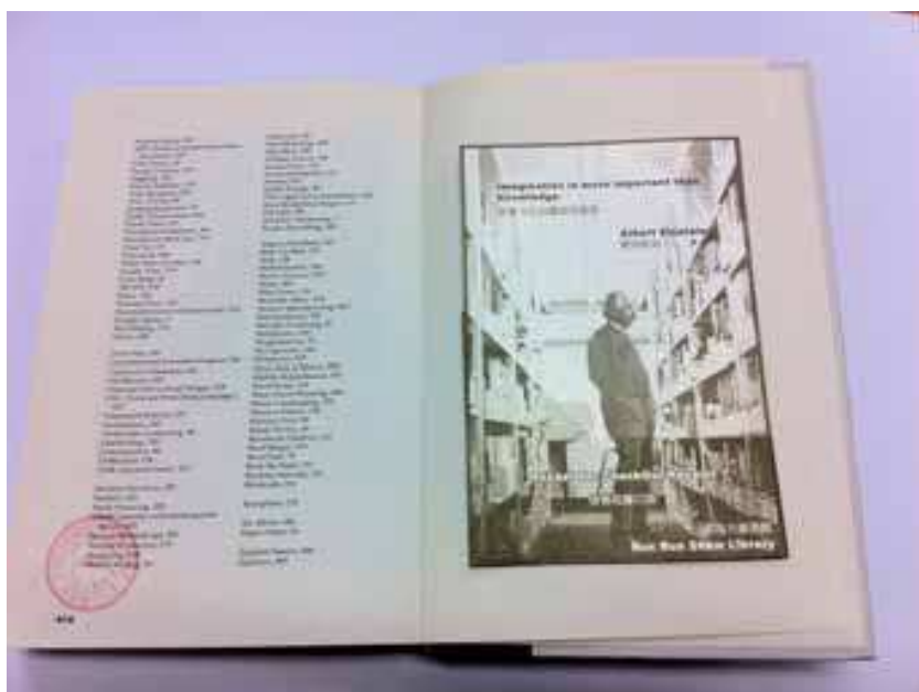
Photo 2. The tags were then covered by a book plate.

inside the machines and they are circularly polarized ones that are supposed to be less orientation sensitive. However, tests conducted by the Project Team reveal that, even with circularly polarized reader antennas, when tags are placed on the book spines and exhibit a perpendicular orientation to the reader antennas, the read rate is far from satisfactory. When books with tags on the book covers are laid flat on the self-check machines and thus sharing the same orientation as the reader antennas, the read rate is much better and the read distance is long. The long read distance enables users to check out more books in any one go 8 and thus capturing the benefits of UHF RFID. (Long read range, however, may generate a concern on misread if the detection area goes beyond the expected one. While the power of the reader antennas can be tuned to adjust the read distance when needed, the Project Team has also put in place a shielding mechanism in the self-check machines to guide the radio waves to go upright instead of sideways so as to safeguard against misread.)