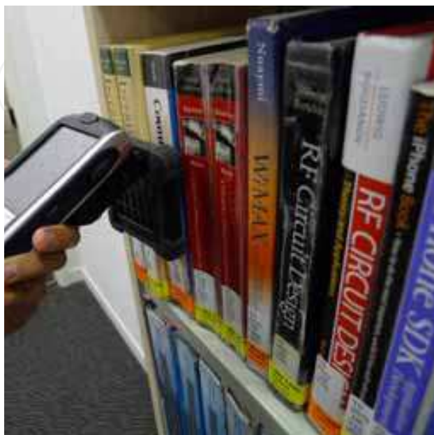
Photo 3. When books are vertically placed on the shelves, tags on the spines share the same orientation as the reader antennas in the handheld scanners while tags on the covers exhibit a perpendicular orientation.

the shelves and the tags on the books too. Smart trolleys and automatic book dispensers are examples of other foreseeable applications that many people have been talking about. Libraries forward-looking enough that will consider adopting these innovative applications in the future may also need to take into consideration the possible requirements of these end-use applications when selecting their tags at the present moment.