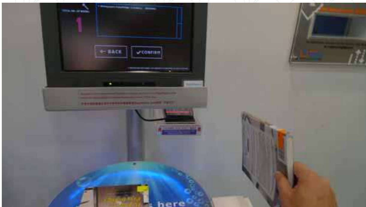
Photo 4. In the pilot test conducted in the CityU HK Library, the UHF RFID reader antenna is laid flat horizontally inside the self-check machines. The radio waves must go far upright to ensure the reading of the maximum number of books. However, the waves are not supposed to go wide to scan the books sideways as well. Any cases like that are misreads and must be rectified. The Project Team thus has made use of metal to provide shielding around the reader antenna and the result is good.

library setup, given the long read range of UHF RFID, it is important that radio waves are confined only to the designated area and distance appropriate for the purposes intended. For example, as discussed earlier, for the self-check machines in the pilot test of the CityU HK Library, the radio waves are expected to go only upright in a distance long enough to allow the most number of tags/ books to be identified in any one go. To ensure that the waves go far but not wide, the Project Team has made use of metal to provide shielding around the reader antenna (Photo 4).