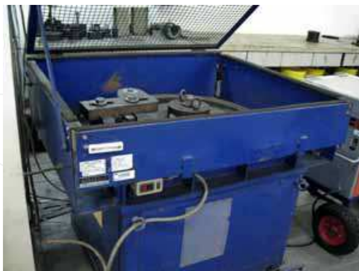
Fig. 3. Displayed the instrument attached UHF RFID tag in the case study (1).

During the setup phase, all the ID of instrument in the RFID tag had been determined and entered the database for system, and then the RFID tag was attached in the instrument. Finally, the tag will be scanned and checked before the maintenance work. Furthermore, the