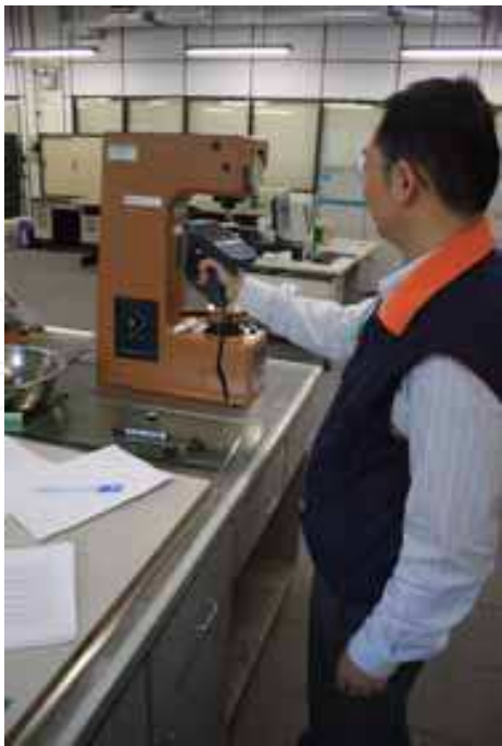
Fig. 5. Displayed maintenance staff member used RFID-enabled PDA to scan RFID tags (1).