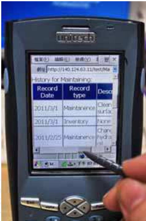
Fig. 7. Displayed maintenance staff member entered the result of inspection, edited the description in the PDA.

Before the inspection/ maintenance work, the instruments staff members can check the instrument list from PDA, refer the relative information and can make the preparation work without printing any paper document. During the inspection/ maintenance progress, the instruments staff member scanned the RFID tag first and to confirm the instrument, then checked the further detail information like maintain procedure, notification, and fittings (see Fig. 5 and 6). The system would support any information of instrument via browser under wireless circumstance. After the instruments were inspected, staff members recorded the