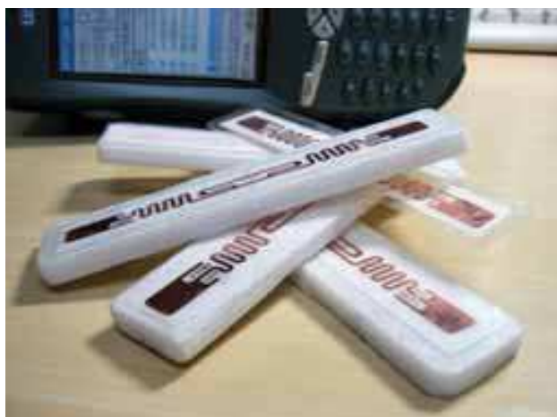
Fig. 2. Displayed the UHF RFID tags using in the case study.

Existing approaches for tracking and managing instruments maintenance adopt manually updated paper-based records. The most of inspection in maintenance work were paper-based work by manual entry although instruments maintenance management system was developed for information management. However, information collected by staff members using such labor-intensive methods is rework and ineffective in the maintenance results entry. Therefore, maintenance management division and maintenance staff members utilized the M-RFIDMM system to enhance instruments inspection and maintenance management in the case study. UHF Passive read/ write RFID tags were used in the case study. After the critical instruments were selected, each UHF RFID tag for the instruments was made, and the unique ID of the instrument was entered into the M-RFIDMM system database. After the instrument was assigned to be monitored for maintenance, the instrument was scanned with a RFID tag to enter the M-RFIDMM system.