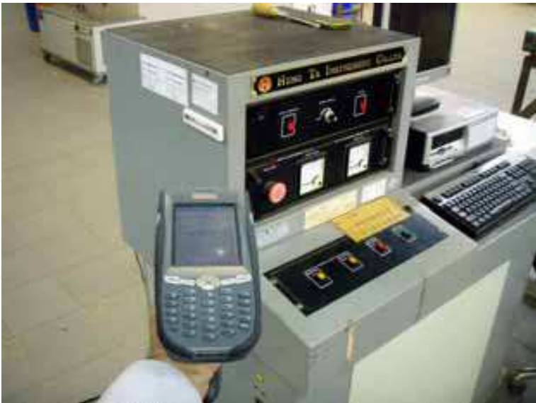
Fig. 6. Displayed maintenance staff member used RFID-enabled PDA to scan RFID tags (2).