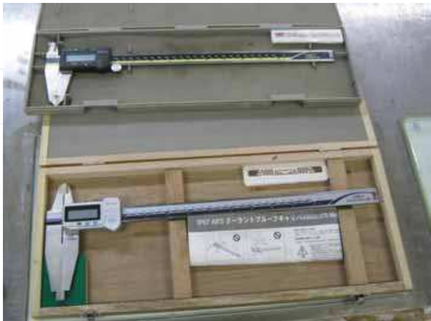
Fig. 4. Displayed the instrument attached UHF RFID tag in the case study (2).

tag suggested to be attached on the non-metal surface (like wooden box) or placed a formcore (about 5 mm) for the interface for decreasing the influence because the RFID tag will be influenced by metal facilities (see Fig. 2-Fig.4).