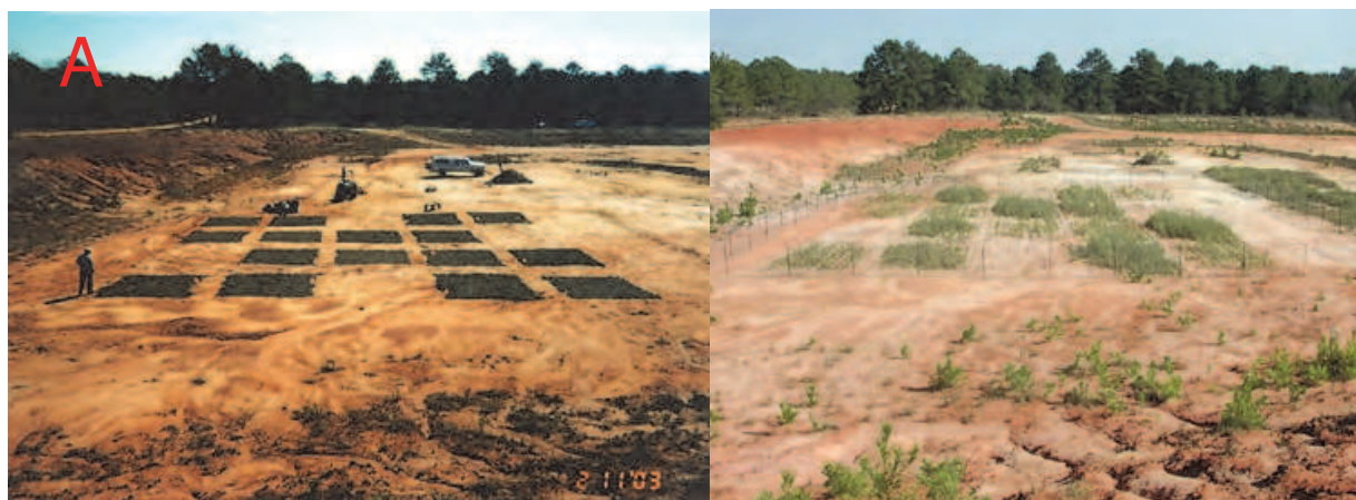
Fig. 2. Borrow Pit field sites on Fort Benning Military Reservation, GA; A) initial application of Fluff, B) plant growth after 2 years.

Based on the results of the species composition and basal cover analyses, establishment of 2 of the 3 native warm season prairie grasses was enhanced with pulp application rates of 36 Mg ha -1 . Indiagrass appears to be relatively unresponsive to the Fluff, but switchgrass and big bluestem showed notable density and cover increases at the highest application rate.