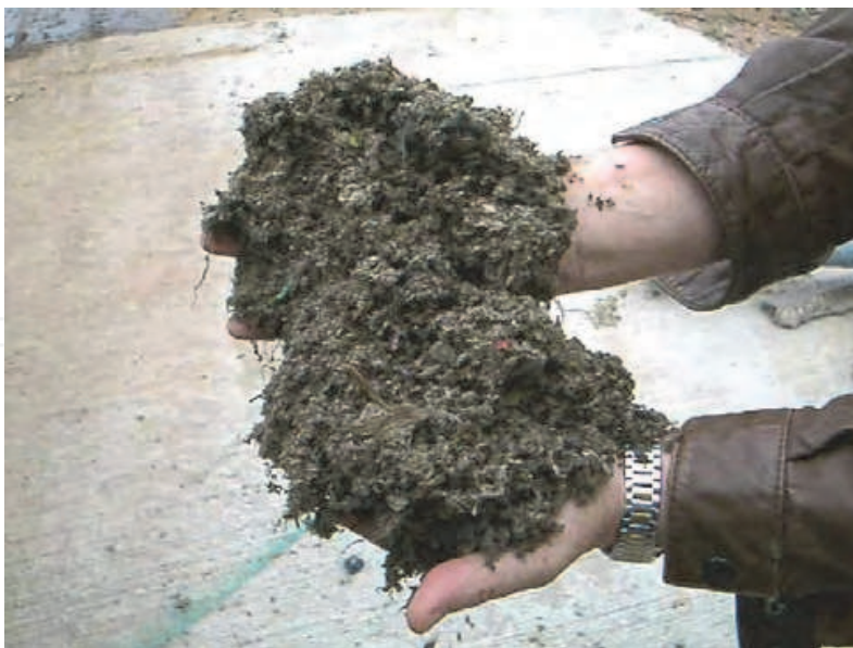
Fig. 1. Picture of Fluff material.