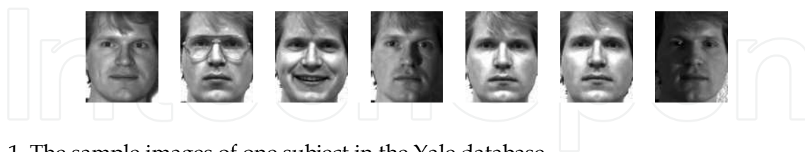
Fig. 1. The sample images of one subject in the Yale database

left-light, without glasses, normal, right-light, sad, sleepy, surprised, and wink. All sample images of one person from the Yale database are shown in Fig. 1. Each image was manually cropped and resized to 100 \times 80 pixels. In all experiments, the five image samples (centerlight, glasses, happy, leftlight, and noglasses) are used for training, and the six remaining images (normal, rightlight, sad, sleepy, surprise and wink) for test.