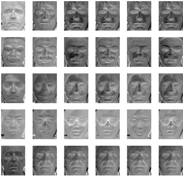
Fig. 5. Samples of class-specific eigen-domain based super-resolution reconstruction images