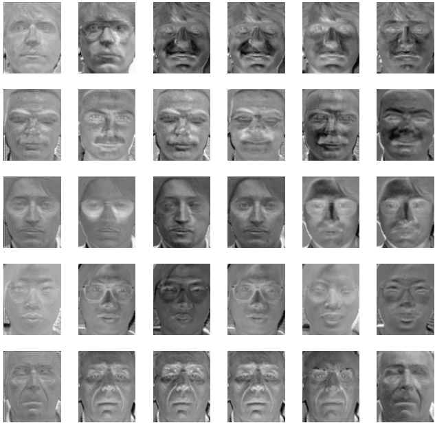
Fig. 4. Samples of class-specific pixel-domain based super-resolution reconstruction images

in the first column are the input testing images. The images from the second to the sixth columns are corresponding to the class-specific super-resolution reconstruction obtained from the corresponding five different set of class-specific eigenfaces. Here, we show five class-specific units. Thus, five reconstructed images are obtained from each input image. Image with least error at i^{th} class-specific unit will be identified to i^{th} class. It should be noted that the images reconstructed using pixel-domain based super-resolution approach give us good perceptual view. However, as shown for eigen-domain based approach, the fourth and fifth input images also give us good perceptual views, while others give comparable reconstruction results. Thus, the reconstruction images based on class-specific super-resolution subspace are more dependent to its corresponding eigen-vectors.