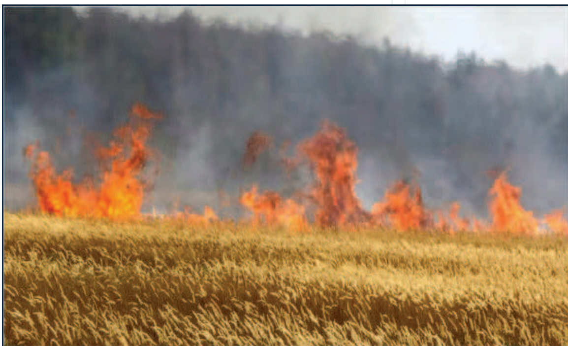
Fig. 5. Burning of crop residue in northern India

It is estimated that 22289 Gg of rice straw surplus is produced in India each year out of which 13915 Gg is estimated to be burnt in the field. On an average, total amount of stubble generated for paddy and wheat per acre was around 23 and 19 quintals, respectively (Kumar & Kumar 2010). The two states namely Punjab and Haryana alone contribute 48 percent of the total and are subject to open field burning (Gadde et al. 2009).