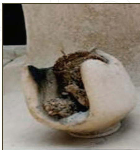
Fig. 8. U shaped household mud stove