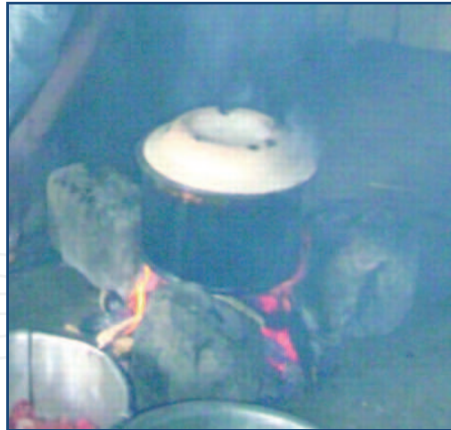
Fig. 9. Three brick cook stove

Environmental tobacco smoke (ETS), is another source of indoor air pollution exposures which can be expected to increase in importance in developing countries. It is important also to recognize that the open hearth (Figure 10) and resulting smoke often have considerable cultural and practical value in the home, including control of insects, lighting, drying food, fuel and housing materials and for flavouring foods (Smith, 1987).