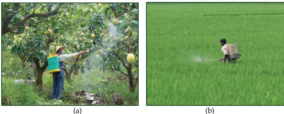
Fig. 6. Localized insecticide (a), pesticide (b) spraying

With placement (localized) spraying of broad spectrum pesticides, wind drift must be minimized, and considerable efforts have been made recently to quantify and control spray drift from hydraulic nozzles (Figure 6). On the other hand, wind drift is also an efficient mechanism for moving droplets of an appropriate size range to their targets over a wide area with ultra-low volume (ULV) spraying. Himel (1974) made a distinction between exo-drift (the transfer of spray out of the target area) and endo-drift, where the active ingredient (AI) in droplets falls into the target area, but does not reach the biological target. Endo-drift is volumetrically more significant and may therefore cause greater ecological contamination