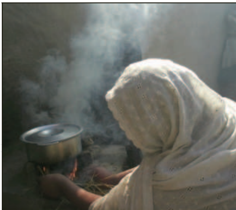
Fig. 10. A women burning crop residue using house hold cook stove

Environmental tobacco smoke (ETS), is another source of indoor air pollution exposures which can be expected to increase in importance in developing countries. It is important also to recognize that the open hearth (Figure 10) and resulting smoke often have considerable cultural and practical value in the home, including control of insects, lighting, drying food, fuel and housing materials and for flavouring foods (Smith, 1987).