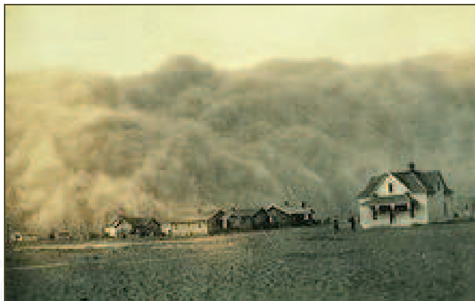
Fig. 4. Air pollution from a dust storm

Abbas et al. (2007) reported in a study on Impacts of Dust Storms on Air Pollution and Public Health in Sistan region in Iran that these caused air pollution and respiratory diseases have spread in the region. Due to all the villages are located in wind corridors' path and most often exposed to dust storms, therefore the number of patients in villages is more than the city. Also, drought and dust storms caused the agricultural land has transformed into wasteland. Hence, villagers live in complete poverty so they are not able to pay remedy costs. Most respiratory patients visit hospital during the summer season when the dust storms occur. Therefore dust storms have led to widespread damage and loss of life. It seems that the loss of life is more than property damage.