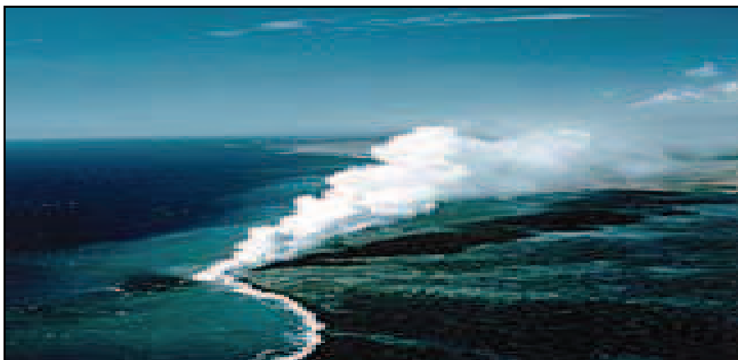
Fig. 3. "Laze" another form of volcanic air pollution

People in areas downwind of the volcano began reporting a wide range of problems, including reduced visibility, health complaints, and damage to crops. The word "vog," an abbreviation for volcanic smog, was coined to identify this form of air pollution, which unfortunately has become a part of everyday life for people in Hawai'i. Vog is a visible haze consisting of gas plus a suspended mixture of tiny liquid and solid particles, called aerosol. The aerosol in vog is composed primarily of sulfuric acid and other sulfate compounds. Small amounts of several toxic metals, including selenium, mercury, arsenic, and iridium, have also been found in the volcanic air pollution coming from Kilauea.