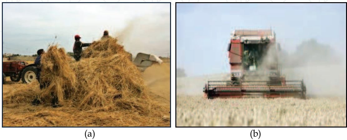
Fig. 7. Grain dust causing air pollution during wheat harvesting by a) threshing b) combine