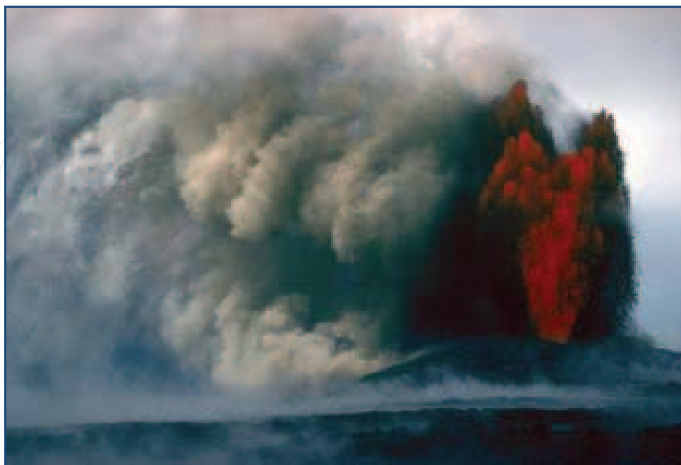
Fig. 2. Kilauea Volcano on the Island of Hawai'i

One of the most important natural causes of air pollution is volcanic eruption. The most problematic gases emitted in a volcanic eruption include sulfur dioxide, carbon dioxide and hydrogen fluoride. In nearby places, sulfur dioxide gas can cause acid rain in nearby places and air pollution in downwind areas from the volcanic site. Besides the volcanic gases, there is also volcanic ash. Volcanic ash can move hundreds to thousands of miles downwind from a volcano. Fresh volcanic ash is gritty, rough, and at times corrosive. The ash can cause respiratory problems for young children, the elderly or those already with respiratory ailments. Volcanic eruptions can generate so much polluting gases and ash into the air that the sun's rays could be blocked, and land temperature in the affected area lowered, as with the Mount Pinatubo eruption in 1991. Kilauea Volcano on the Island of Hawai'i emits about 2,000 tons of sulfur dioxide ( \text{SO}_2 ) gas each day during periods of sustained eruption (Figure 2).