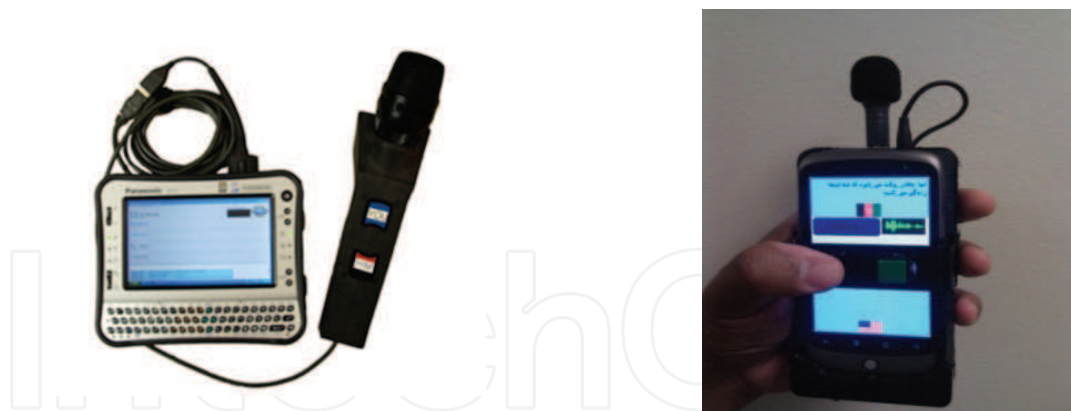
Fig. 2. BBN TransTalk Two-way S2S Translator on UMPC and Smartphone platform.

The foreign language speaker's reply ("Arabic" in Figure 1) is sent to the foreign language recognizer, which outputs text in the foreign language. The foreign language text is translated into English text with a process similar to the one in English-to-Foreign direction. The translated text is then sent to a second speech synthesizer, which speaks it out for the English speaker to hear, and/or displaying it on a screen.