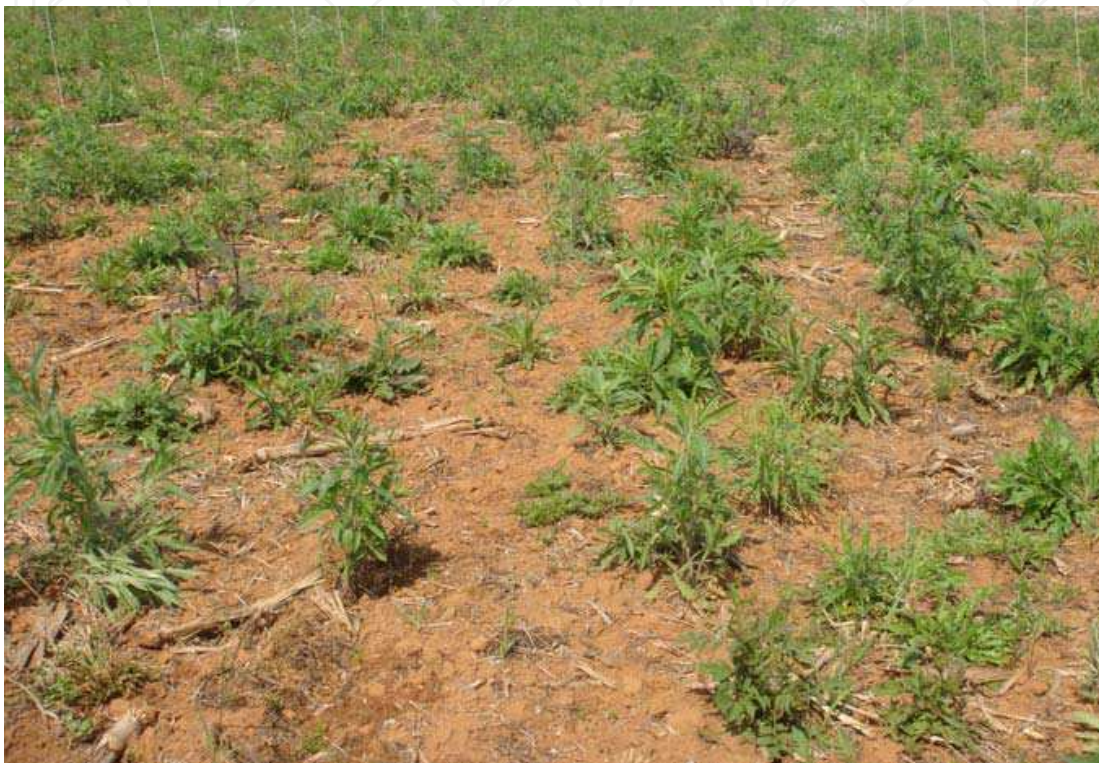
Fig. 1. Corn-soybean crop rotation area infested by Conyza bonariensis resistant to the herbicide Glyphosate, 2010, Castro / PR, Brazil.

advantage of the species is its way of spreading by the wind, allowing only one plant to spread its seeds kilometers away. This fact allied to its high seed production, 110 to 200.000 seeds for C. bonariensis and C. canadensis , respectively (Wu & Walker, 2004), its presence can reduce the soybean productivity up to 80%. The control of this species is linked, in the practice, to herbicides mixtures, with use of ingredients such as flumioxazin and chlorimuron-ethyl. However, research does not stop and new chemicals are being launched to assist North American and Brazilian producers in managing this species.