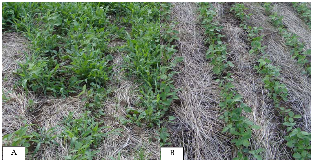
Fig. 2. A) No tillage system on soybean with application of glyphosate in an area with high seed bank Brachiaria plantaginea , in the beginning of soil system adoption - second year of cultivation. B) No tillage system of soybean with application of glyphosate in an area with crop rotation, during the sixth year of cultivation. Ponta Grossa/PR, Brazil.

which requires a further care during the establishment of the system. However, in the long term, its adoption is advantageous for it accelerates the decrease in the seed bank, enabling the uniformity of the seedling emergence and the effectiveness of control measures, especially the chemical.