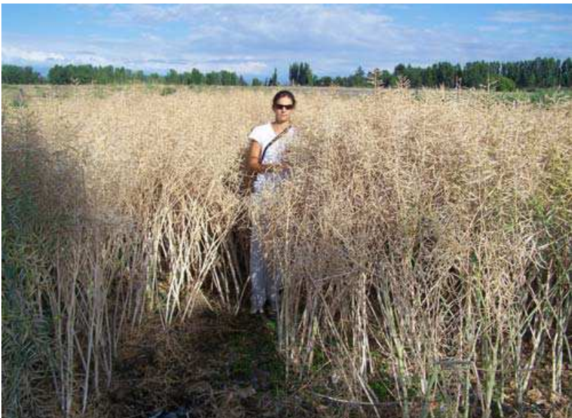
Photo 7. Rape crop before harvest.