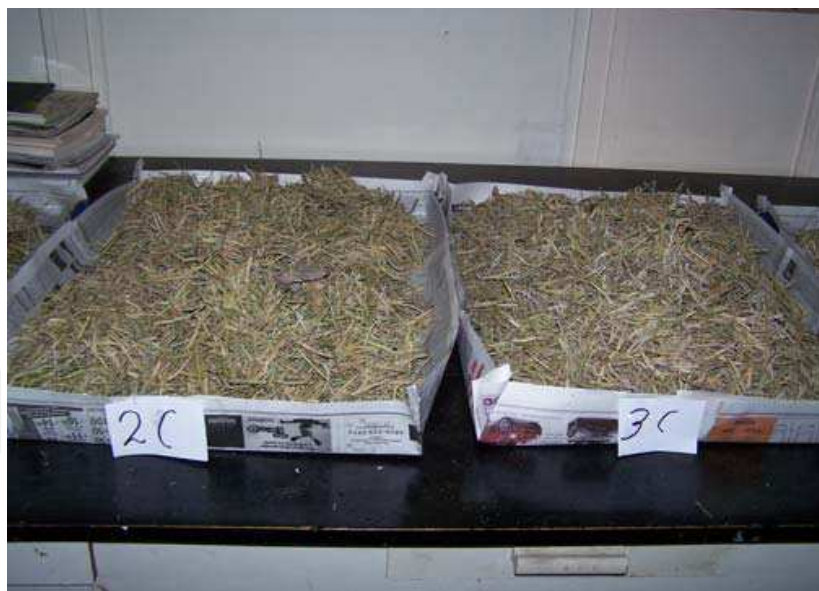
Photo 9. Final dry of siliqua in laboratory.