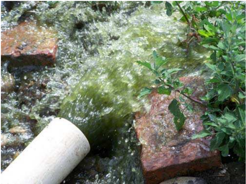
Photo 5. Appearance of the waste water used for irrigation.