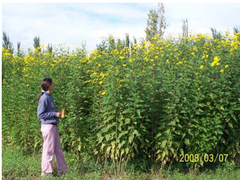
Photo 3. Jerusalem artichoke in flower, March 2008.

Rape is cultivated worldwide for forage, vegetable oil for human consumption and biodiesel. The major producers are the European Union, Canada, United States, Australia, China and India.