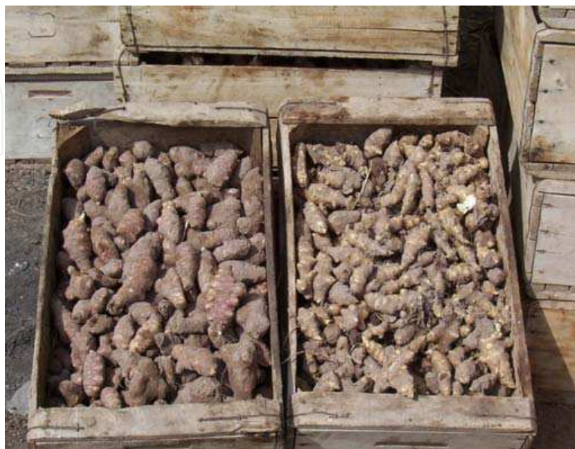
Photo 6. Tubers of the two Jerusalem artichoke cultivars tryed in this experience. R, with red tubers, in the left; and W, with white tubers, in the right.

Two cultivars of Jerusalem artichoke were tryed (red tubers, R , and white tubers, W ), and two kinds of waters were used for irrigation (urban waste water, UWW , an ground water, GW ).