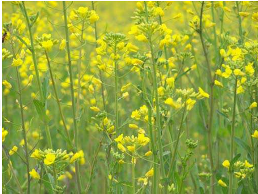
Photo 2. Rape in flower, spring 2008.