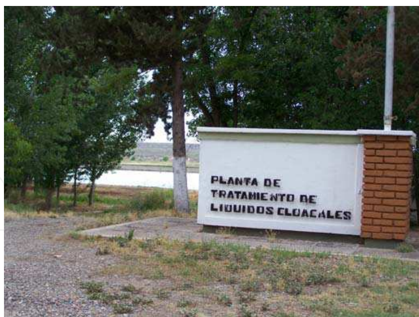
Photo 4. Urban Waste Water Treatment Plant of Obras Sanitarias Mendoza in Tunuyán; the treatment pools are behind the trees.

We conducted a trial in which yield and potential to produce ethanol of Jerusalem artichoke and yield and potential to produce biodiesel of a winter rape cultivar were compared. Two types of irrigation: urban waste water (UWW) and ground water (GW) were used (Table 1). Both researches were conducted in the Urban Waste Water Treatment Plant of Obras Sanitarias Mendoza in Tunuyán (33°32'89" S and 69°00'80" W). The characteristics of the soil of the trial are shown in table 2.