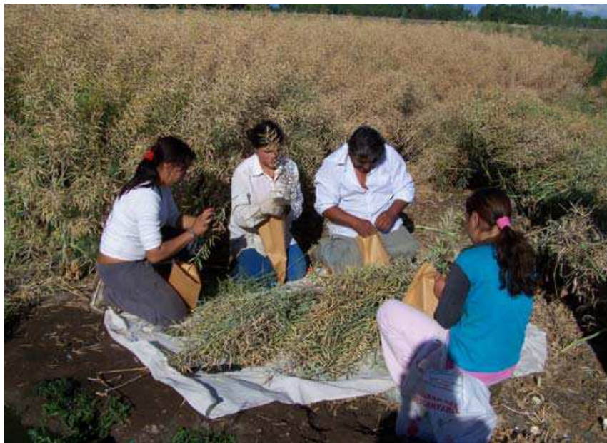
Photo 8. Rape harvest, december 2008.