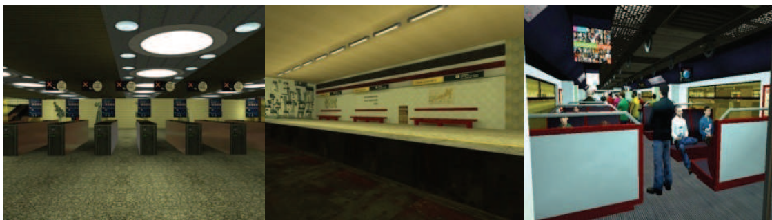
Fig. 2. Screenshots of VR-based Serious Game for Agoraphobia Treatment developed by the Psychology Computational Laboratory of the Universidade Lusófona de Humanidade e Tecnologias, Lisbon, Portugal.

VR holds a set of important features that, allied to the characteristics of SG, ensure a fruitful solution for many situations. One of these characteristics is the rich interactive simulation that VR encloses. The interactivity on a full sensory environment created to a specific end ensures that the objectives of exposure (in whatever field of application) are met in an easier and more controlled way than in traditional imagination exposure. In this way, VR-based SG might be an adequate technique due a better approximation to the real word (Vincelli & Molinari, 1998; Vincelli & Riva, 2002), inducing higher levels of immersion when compared to imagination exposure (Botella et al., 2000; Rothbaum et al., 1995; Vincelli & Riva, 2002). Furthermore, VR allows the development of settings that ensure that ecological validity is taking in consideration. For instance, in cases of fear of subway, before getting in the railway carriage, patient should enter in the subway station; buy the traveling ticket, stamp it and then wait for the train to come (Figure 2).