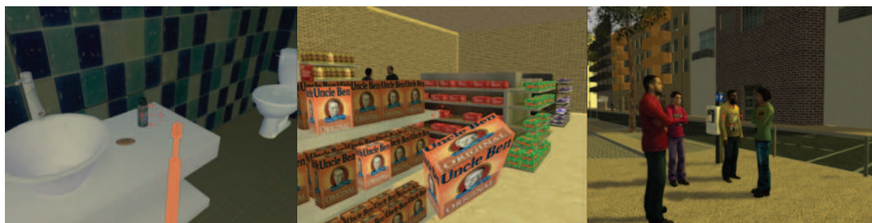
Fig. 1. Online VR platform for cognitive telerehabilitation of TBI patients (Gamito et al. in press).

More recently, Gamito and collaborators (in press) have addressed this issue and studied an online portal to train memory and attention in patients with traumatic brain injury (Figure 1). The study was carried out on single 20 years old male patient with traumatic brain injury where he had to complete a set of 10 online VR sessions. The patient was assessed before, during and after training with neuropsychological measures for working memory and attention. In this case study, the authors found an improvement in cognitive abilities suggesting that this online VR platform can be effective for cognitive rehabilitation of TBI patients.