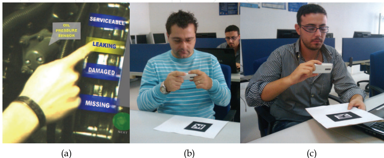
Fig. 2. Three Augmented Reality interaction approaches

A new research direction concerns the combination of AR with the physical manipulation of Tangible User Interfaces. In Fig. 2 (a) the user touches a virtual button to select a menu option. The camera tracks hand gestures and the device camera preview is augmented with overlaid 3D objects to provide visual feedbacks.