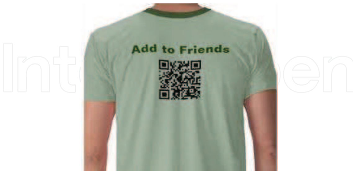
Fig. 3. QR code for labelling not only the world, but also people.

including customer reviews and also enables to write a personal review. The application does not adopt an AR interaction modality.