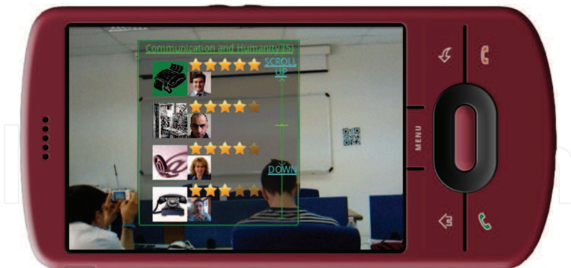
Fig. 4. An example of an Augmented Reality interface for a mobile location-based pervasive content sharing application