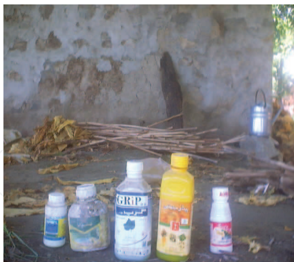
Fig. 5. Poor house keeping of pesticides