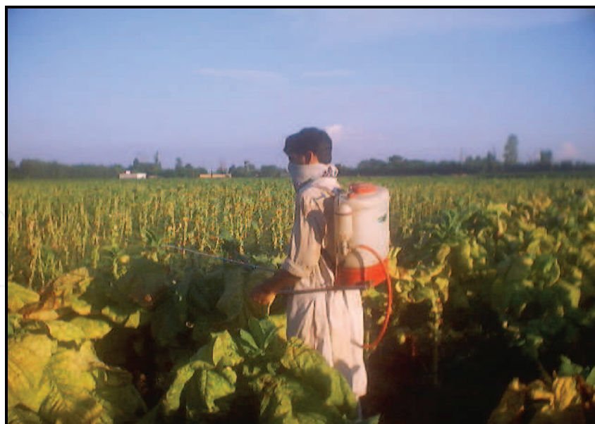
Fig. 3. Extensive pesticide usage