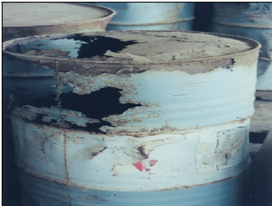
Fig. 2. Corroded pesticide container