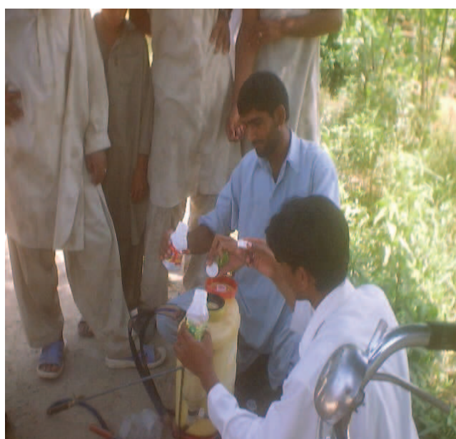
Fig. 4. Improper handling of pesticides