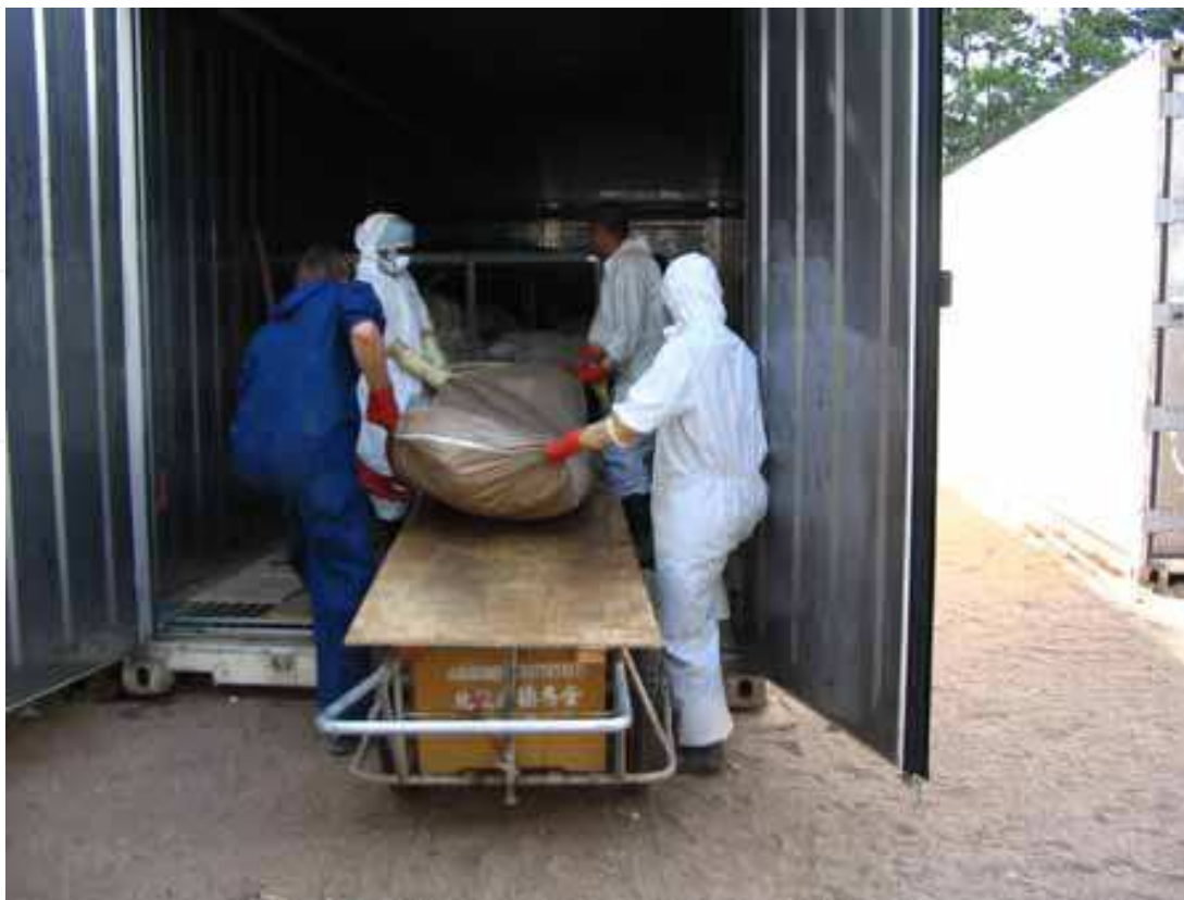
Fig. 22. Bodies' conservation (with repertory) in containers – after all PM techniques.

numbered samples with the given body number ; (iii) assuring quality control of the dental X-rays (Goodman & Edelson, 2002; Kieser et al., 2006) and (iv) quality control of all documents.