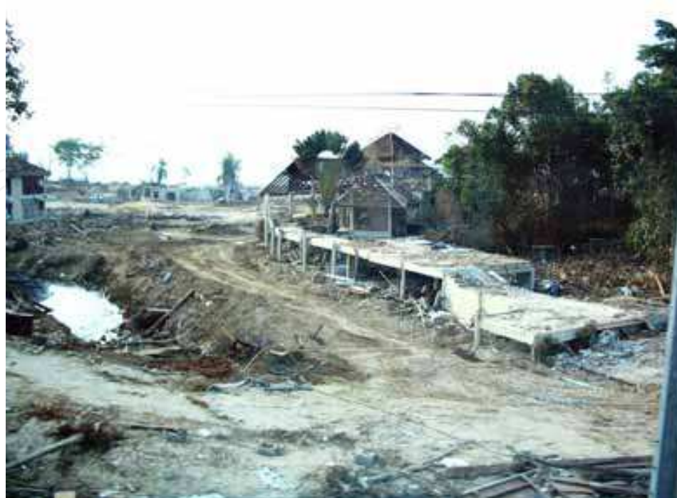
Fig. 1. General view of the disaster (Phang-Nga province).

To illustrate the different activities of the reconstructive identification process of the Tsunami victims, we refer to the activities of the Belgian Disaster Victim Identification (DVI) Team, working at “Wat Yan Yao” (Buddhist temple in Takuapa village, near Khao Lak beach, Phang-Nga province) as part of the world wide DVI community which brought assistance to the Thai government (see Fig. 1, 2 and 3).