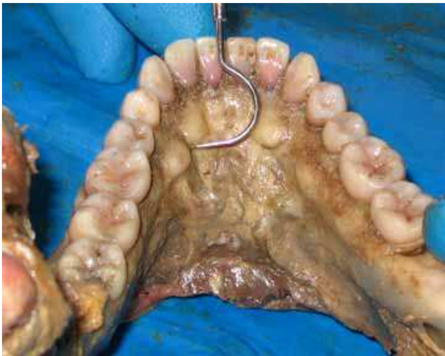
Fig. 19. Particularities – torus mandibularis .