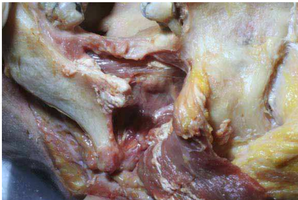
Fig. 16. Mandibular dissection, sixth step: complete disarticulation of the temporomandibular joint and muscles sections along the medial border of mandibula (left and right dissections) which can be deposited.