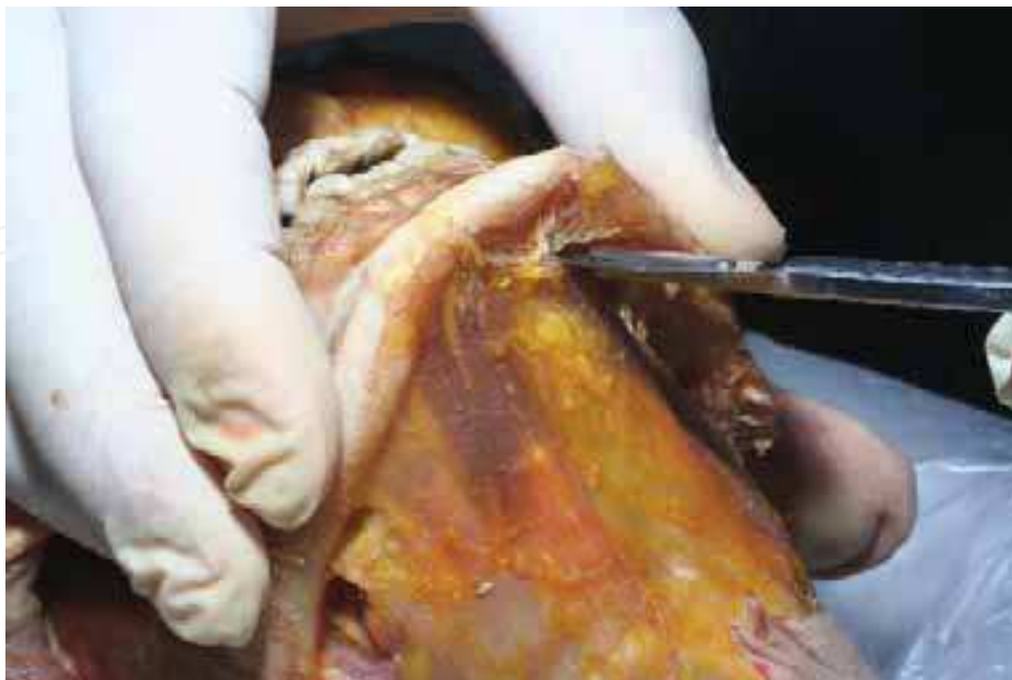
Fig. 12. Mandibular dissection, second step: buccal floor section along the inner border of mandibula .