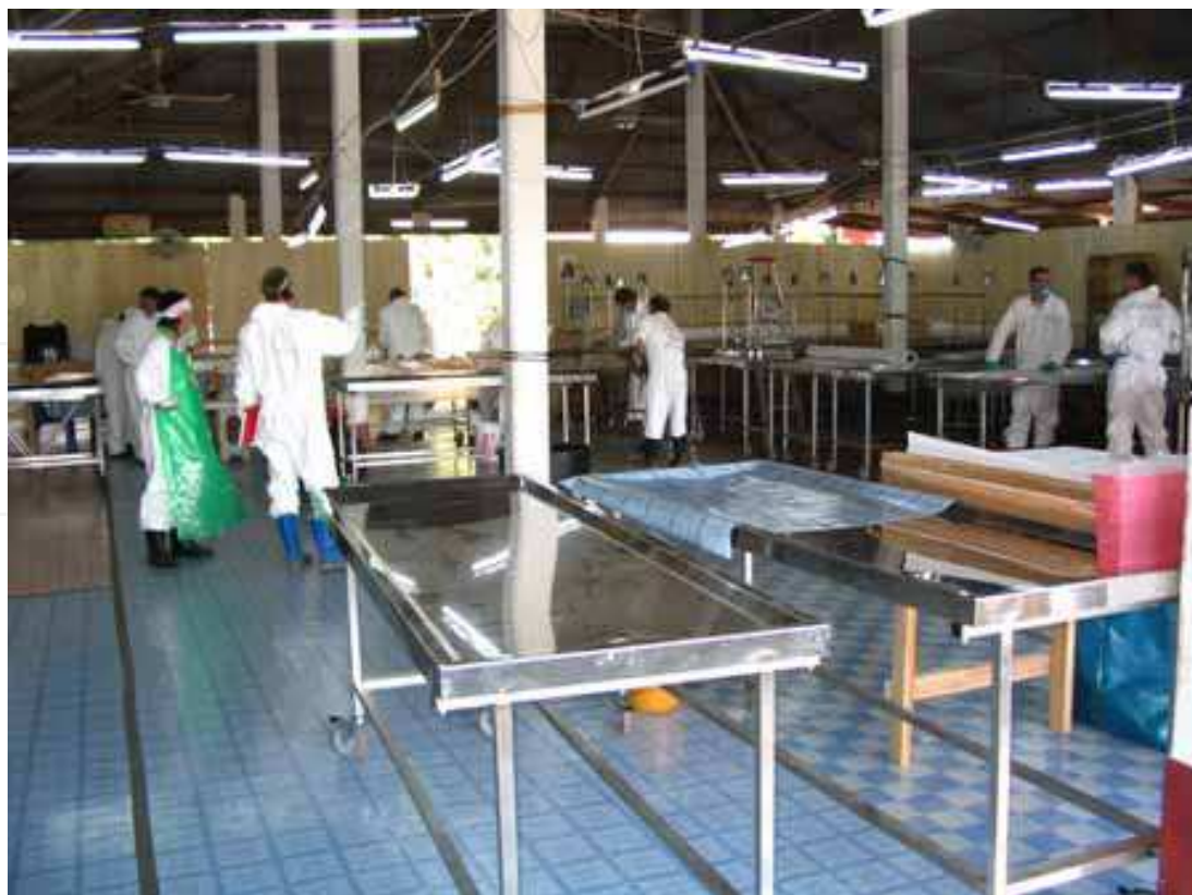
Fig. 9. Second autopsy room.