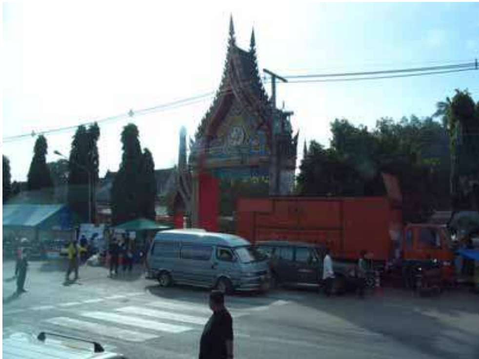
Fig. 2. Wat Yan Yao Site 1a – Khao Lak: the entry to buddish temple.