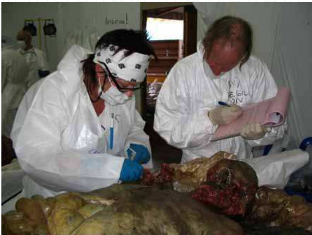
Fig. 17. Dental first examination.

This anatomical technique facilitated the forensic odontologist's PM work, with an easy access to both the maxillar and mandibular dentition (Fig. 17). Separate pictures were taken of the upper and lower jaws and teeth in occlusal position, as well as with articulating jaws (Fig. 18). The complete dentition was described using Interpol protocols, nomenclature and forms (Bajaj, 2005; Sweet, 2006) (sound teeth, pathological teeth, restored teeth, absent AM or PM teeth, attrition and oral anatomical abnormalities) (Fig. 19).