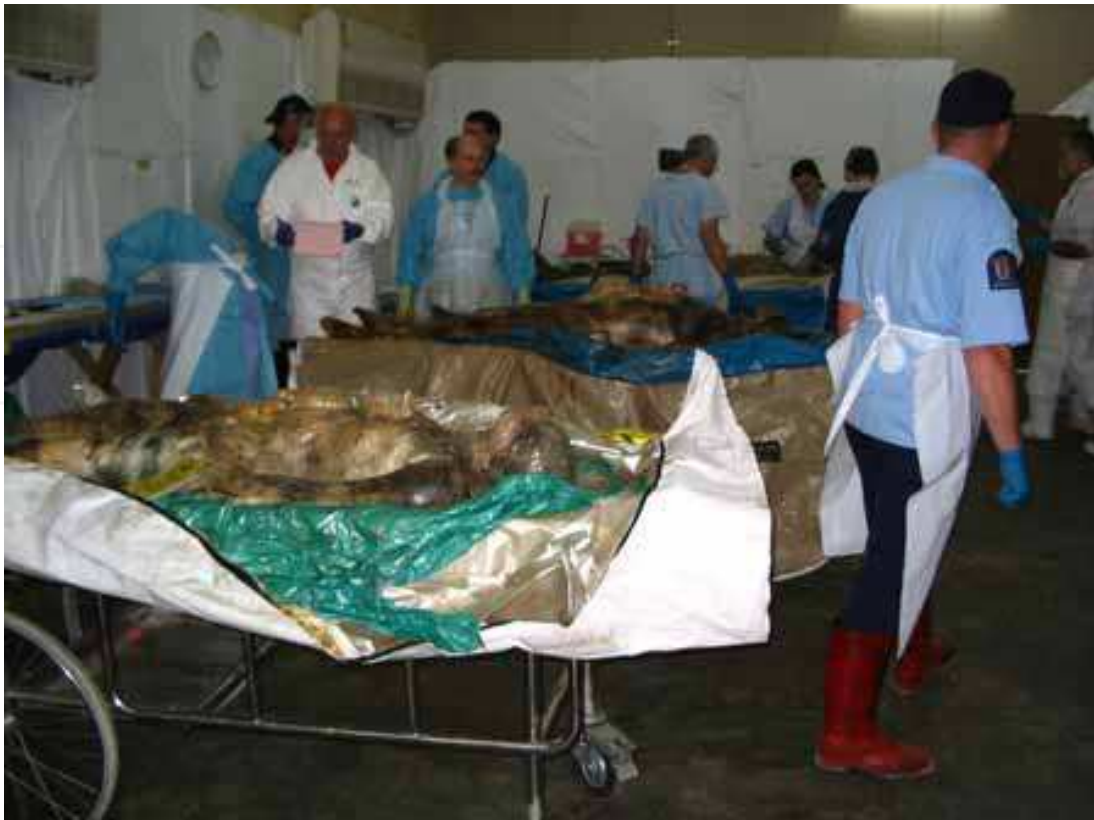
Fig. 8. First autopsy room.