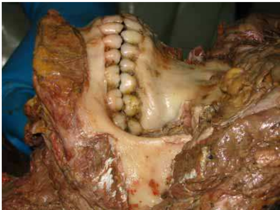
Fig. 14. Mandibular dissection, fourth step: complete cranial evidence of the mandibula .