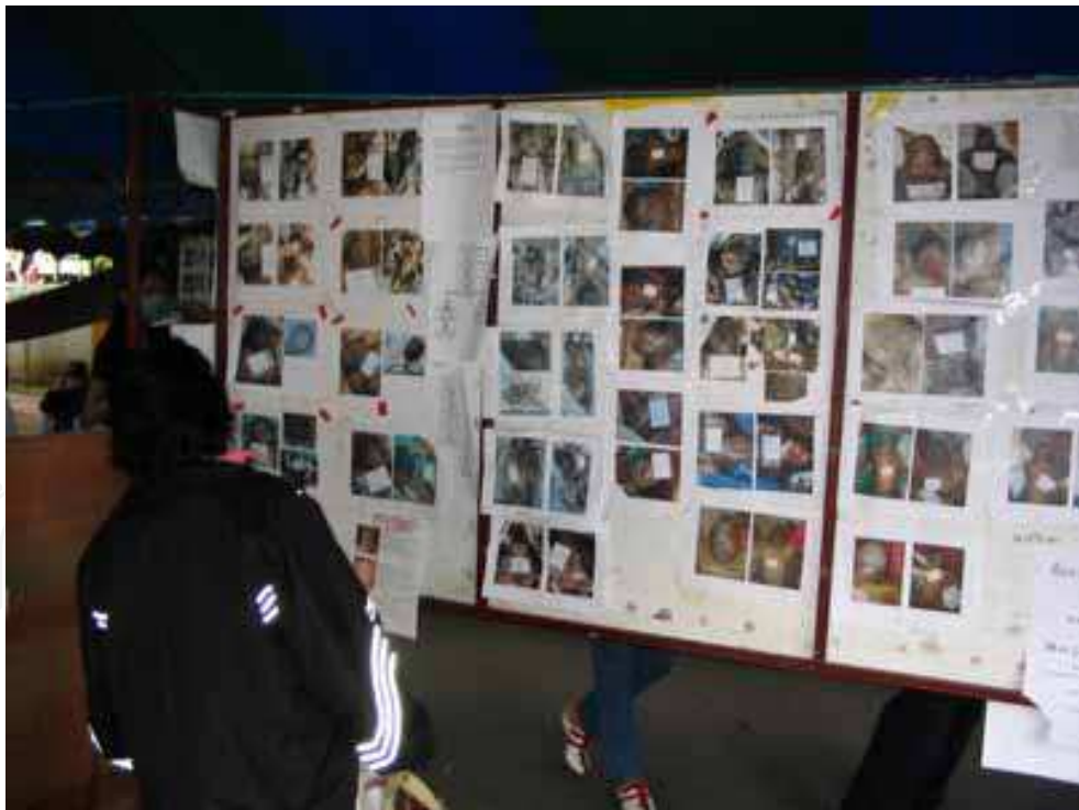
Fig. 3. The pictures: exposition of the decedents.

For a proper post mortem (PM) examination and from a logistic point of view, it is recommended that a DVI team be multidisciplinary so that, immediately after deployment and regardless of local conditions and facilities, it can operate autonomously. This requires not only the presence of specialized forensic experts on the team but also a strong added