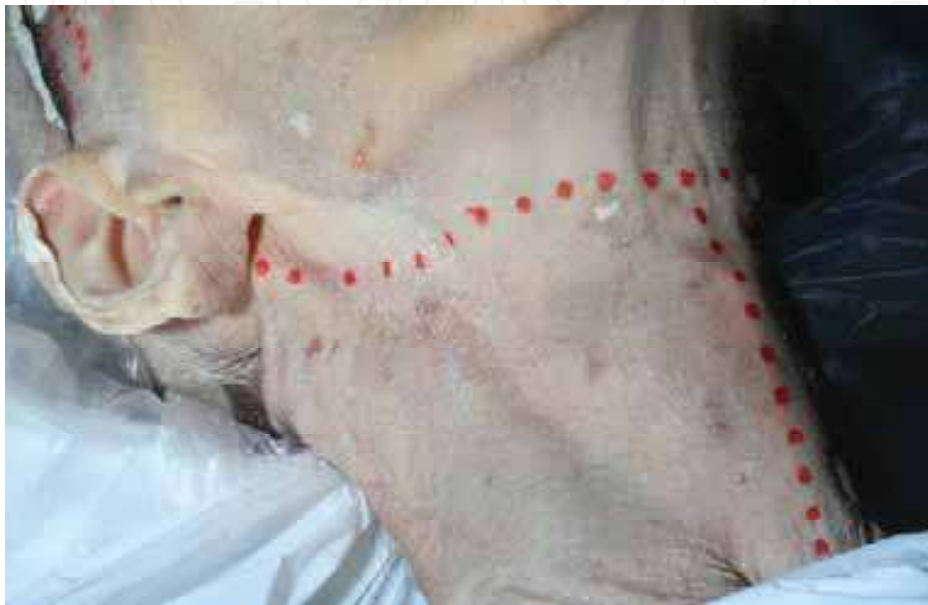
Fig. 11. Mandibular dissection, first step: cutaneous incisions.

The mandible was thus completely released (Fig. 16), without any destruction, allowing an easy repositioning in order to obtain a complete correct facial reconstruction (Beauthier et al., 2009).