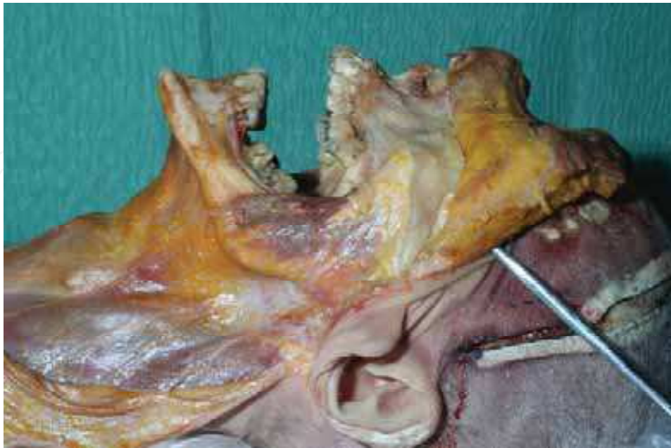
Fig. 13. Mandibular dissection, third step: facial cutaneous flap and section of masticator muscles ( m. masseter ).