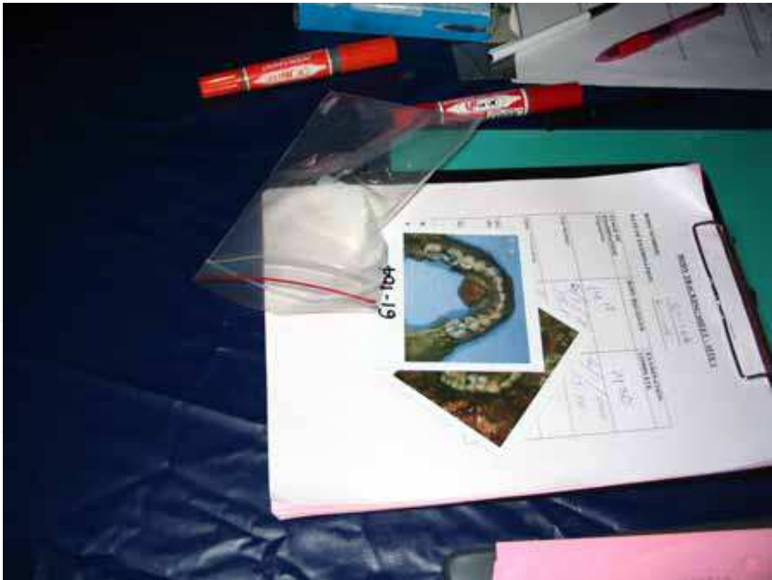
Fig. 21. Final desk.

On a DNA level, it is useful to systematize the sampling of the dental and femoral diaphysis parts. In Thailand costal samples were taken from numerous bodies in the early days, but at a later stage instructions were given to start all over and instead collect the SOP approved femoral samples and/ or teeth. Only performing an external body examination has limitations and we all were well aware of that. In this particular case and because of the body conditions the search for scars for example proved to be inadequate, but tattoos however were more easily detected and of great value. The assistance of the local Thai auxiliary personnel in interpreting or translating some of the tattoo material was of great added value. The benefits of a separate X-ray room (Ludes et al., 1994) where radiological examination of the body by X-ray amplification 4 would allow to locate the presence of foreign bodies (e.g. osteosynthesis, prosthesis, tubar clips, vascular stents or pacemakers) are without any doubts and this idea should be taken into consideration at all times. Radiology could be complementary - or even replace - the limited internal autopsy which provided very little helpful information as to validly evaluate anatomical characteristics under these difficult conditions (Hirsch & Shaler, 2002). An important place in the PM information gathering was located at the final desk (Fig. 21) by (i) checking if all examinations were carried out; (ii) checking concordance of all