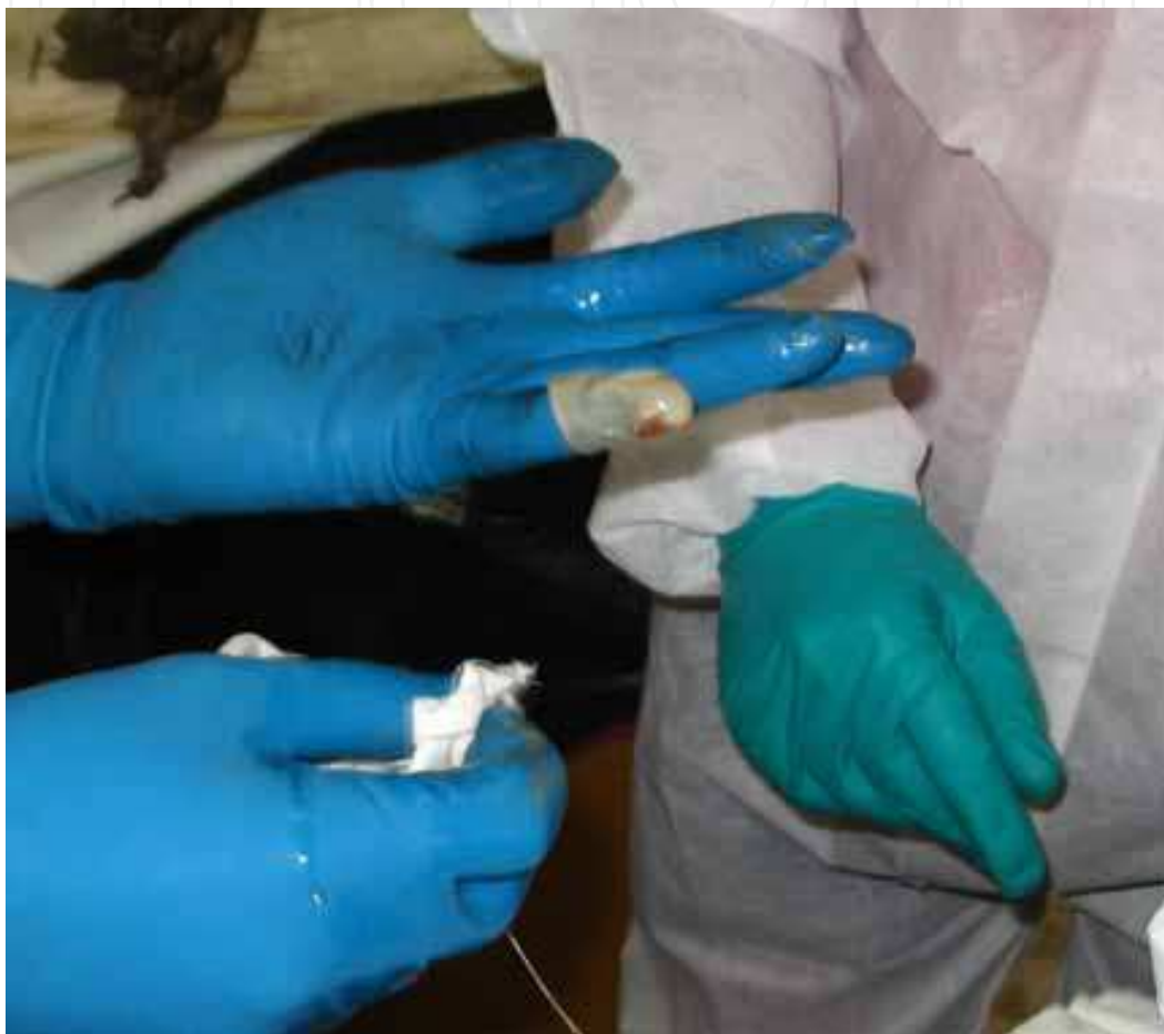
Fig. 7. Fingerprinting technique: “degloving” and “glove-on” method.

Fingerprinting was very difficult due to the condition of the bodies but was successfully realized by specialists of the technical and scientific laboratories of the different national law enforcement agencies. Finger skin was removed by “degloving” and placed on the fingertip of one of the two operators. After powdering, the fingerprints were then transposed onto paper (Fig. 7). The use of separated fingerprinting rooms proved to be very practical and useful.