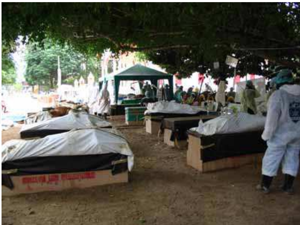
Fig. 5. Wat Yan Yao Site 1a – Khao Lak: first examinations’ activities.