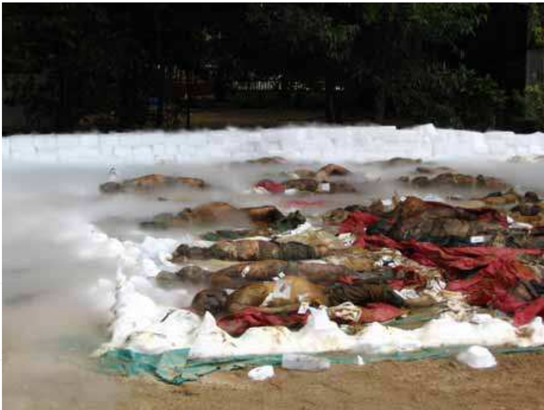
Fig. 4. Wat Yan Yao Site 1a – Khao Lak: innumerable bodies protected by dry ice (before autopsy).

The recovery of the bodies was carried out by the local Thai population prior to the time of the international teams' arrival in Thailand (Fig. 4).