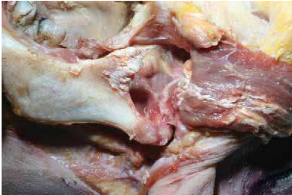
Fig. 15. Mandibular dissection, fifth step: lateral aspect of the mandibular condyle and coronoid section of the m. temporalis .