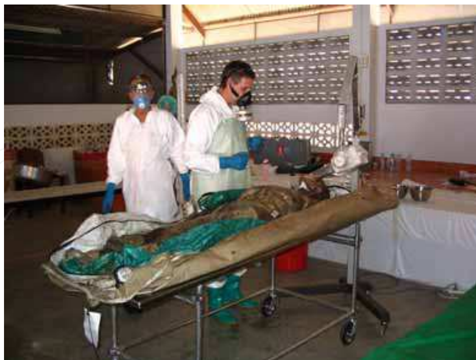
Fig. 20. Dental X-ray examination.