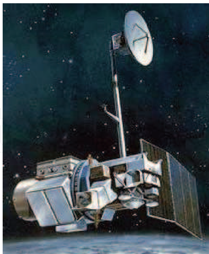
Fig. 5. Landsat Satellite TM.

The research has been carried out in USM with the utilization of satellite images from passive sensors in our analysed. Images acquired by Landsat TM 5. Landsat 5 was launched by NASA on March 1 1985 in order to replace Landsat 4. Landsat 5 was designed and built at the same time as Landsat 4 and carried out the same payload: the Multispectral Scanner System (MSS) and the Thematic Mapper (TM) instruments.