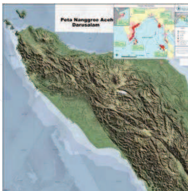
Fig. 1. The study area of NAD province, Indonesia.

The Landsat TM imageries used in this study were acquired on 24 December 2004 and 27 March 2005. The selected study area was Nanggroe Aceh Darussalam (NAD) province, Indonesia. Figure 1 shows the study area. The study area is in the Sumatra Peninsula, located between latitudes 2°N and 6°N and longitudes 95°E and 99°E (Figure 1), at the northern tip of the island of Sumatra. NAD province is located in equatorial region and enjoys a warm equatorial weather the whole year. Therefore, it is impossible to get the 100 % cloud free satellite image over NAD province. But, the satellite image chosen is less than 10 % cloud coverage over the study area.