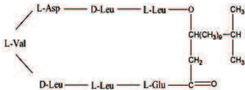
Fig. 1. Primary structure of surfactin

The molecular assembly of surfactin in an aqueous solution and the conformation of the molecules in aggregates condition its physicochemical activities and biological properties. Surfactin adopts a \beta -turn, forming a \beta -sheet with a characteristic horse-saddle conformation, which is probably responsible for its broad spectrum of biological activities, even at such low concentrations. The \beta -turn may be formed by an intramolecular hydrogen bond, whereas the \beta -sheet may depend on an intermolecular hydrogen bond (Bonmatin et al., 1994; Han et al., 2008; Zou et al., 2010). The two charged side-chains are gathered on the same side and form a "claw", providing a polar head opposite to the hydrophobic domain (Tsan et al., 2007).