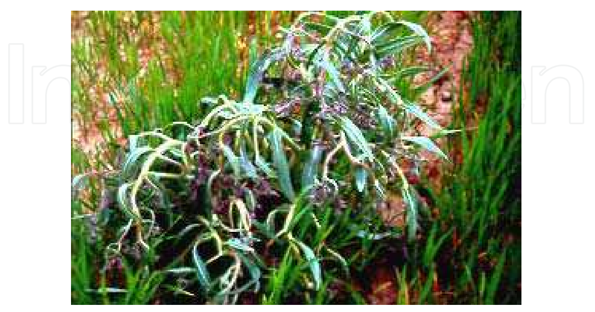
Fig. 2. Selective control of broad-leaved weeds by 2, 4-D in wheat field.

(Qasem, 2005). On the other hand, 2,4-D and MCPA are best applied at full tillering stage of cereal (wheat and barley) crops and when crop plants are at resting stage and exhibit low physiological activities. Weeds at the same time are physiologically active; their cell division and cell elongation rates are high and thus accumulate lethal doses from these herbicides in embryonic tissues (Fig. 2). Differences in selectivity between legume crops and their associated broad-leaved weeds to 2,4-DB depends mainly on the ability of these to accumulate and convert large amounts from this herbicide to 2,4-D (more toxic) and the rapid conversion process. Weeds accumulate and convert larger amount within a relatively short period and thus affected more rapidly than crop plants that escape injuries because of