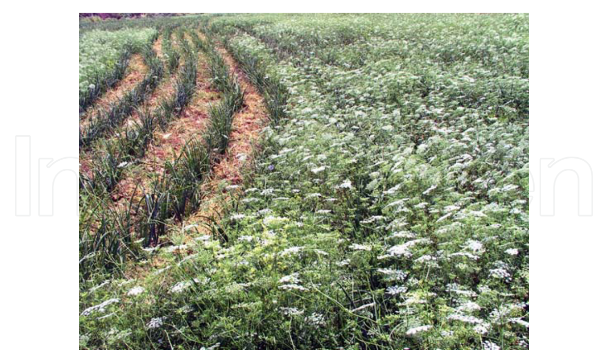
Fig. 1. Selective control of Ammi majus L. in onion with post-planting treatment of oxadiazon. Treated onion rows (left) and untreated rows (right).

(Qasem, 2005). On the other hand, 2,4-D and MCPA are best applied at full tillering stage of cereal (wheat and barley) crops and when crop plants are at resting stage and exhibit low physiological activities. Weeds at the same time are physiologically active; their cell division and cell elongation rates are high and thus accumulate lethal doses from these herbicides in embryonic tissues (Fig. 2). Differences in selectivity between legume crops and their associated broad-leaved weeds to 2,4-DB depends mainly on the ability of these to accumulate and convert large amounts from this herbicide to 2,4-D (more toxic) and the rapid conversion process. Weeds accumulate and convert larger amount within a relatively short period and thus affected more rapidly than crop plants that escape injuries because of