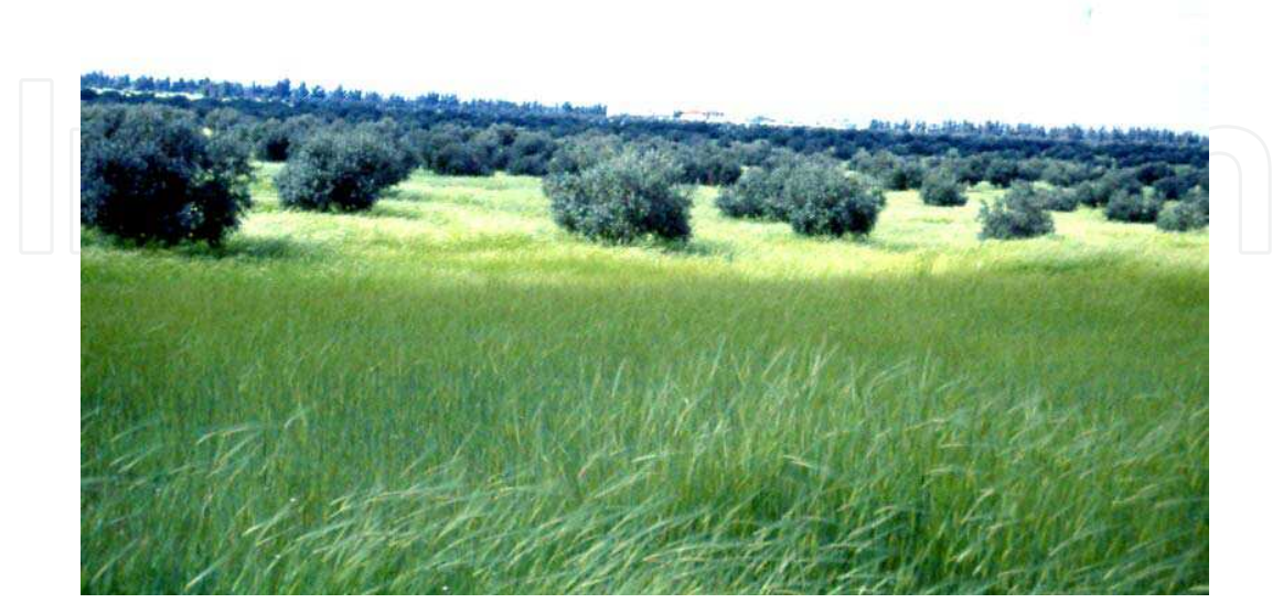
Fig. 3. Weed population shift to narrow-leaved weeds (Mainly bulbous barley, Hordeum bulbosum L.) resulted from continuous application of broad-leaf killers in olive orchard.

One of the causes of herbicide tolerance/resistance in weeds is the continuous application of the same herbicide or herbicides of the same mechanism of action year after another in the same field (Caseley et al., 1991; Duke, 1996). This practice imbalances weed population at which certain group of weeds (broad or narrow-leaved) is affected while the other is not harmed (Fig. 3). This is usually resulted from use of selective rather than general herbicides. However, within the affected weed group sensitive species are the first harmed and disappear later. The less affected species may include some individuals within populations that withstand the rate of herbicide applied or may be partially affected but could recover late in the season and set seeds. Continuous use of the same herbicide impose a selection pressure that force some individuals within the weed population to physiologically, morphologically and may be biochemically distinct and adapt themselves to tolerate the rate of herbicide used (Powles & Holtum, 1994; Pline et al., 2003; Qasem, 2003). This will lead later to development of individuals within the same weed population that resists chemical