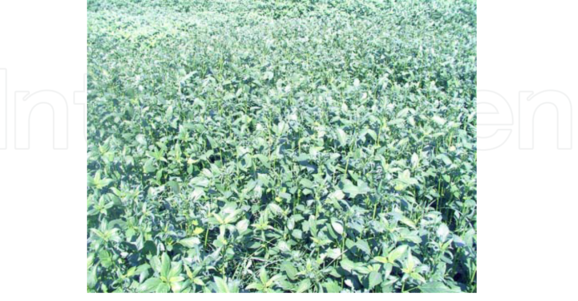
Fig. 5. Toxicity symptoms on Jute ( Chorchorus olitorius L.) resulted from 2,4-D traces left in the sprayer tank used for insecticide application. Plants showed abnormal growth (malformed leaves, twisting and yellowing).