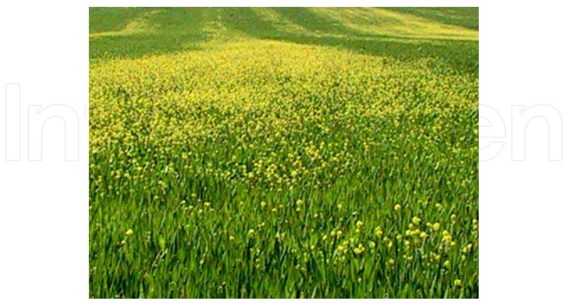
Fig. 4. Wild mustard ( Sinapis arvensis L.) grown in strips after escaped from control by 2, 4-D in wheat due to low boom height level.

3. Sprayer boom height. Nozzle height has obvious effect on the area covered by herbicide solution. The higher the boom height the wider is the spray swath and the larger is the area covered with spray solution of different nozzles mounted on the sprayer boom. Changing boom height from above the soil level during spray operation may easily result in a non-uniform coverage leads to overlapping between spray swath of different nozzles fixed on the boom and thus crop may be injured or killed since received a double dose of the herbicide solution which could be easily observed in the field . When nozzles are placed at low height from the soil level possible gaps left uncovered by the herbicide solution are mostly resulted and thus weeds in these gaps may continue growing in regularly spaced strips in the field (Fig. 4). In both situations lack of uniform coverage by the herbicide solution could result in equally spaced strips of growing weeds or killed crop plants under