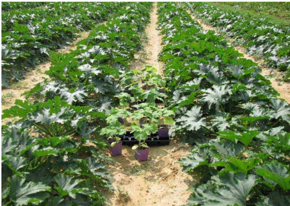
Fig. 8. Fungicide-treated Cucurbita pepo seedlings left with non-treated seedlings for at least 4 hours in a squash crop affected by powdery mildew for an in-field fungicide sensitivity bioassay