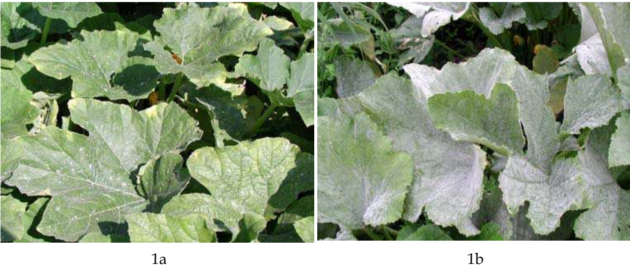
Fig. 1. a,b. Symptoms of cucurbit powdery mildew developing under field conditions (a – limited infection, b – serious infection)

Application of fungicides continues to be the principal approach for managing powdery mildews around the world (Hollomon & Wheeler, 2002). This is due to the limitations of resistance and lack of other management practices. Systemic and translaminar fungicides are especially important for controlling CPM because they provide adequate protection of abaxial leaf surfaces, where conditions are more favorable for disease development than on adaxial surfaces (McGrath, 2001). These fungicides have specific single-site mode of action, thus they are active at one point of one metabolic pathway of the pathogen, and therefore are generally more at-risk for resistance development than other fungicides (McGrath, 2001). Several reports have been published about the appearance and increase of CPM populations (mainly Px ) resistant to six groups of single-site inhibitors (benzimidazole, DMI, morpholine, hydroxypyrimidine, phosphorothiolate, QoI) (Hollomon & Wheeler, 2002; McGrath, 2001, 2006; Sedláková & Lebeda, 2008). On the other hand, contact fungicides have