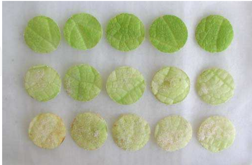
Fig. 6. Three types of assigned reactions: a – sensitive (degree of infection, DI = 0-10%), b – tolerant (DI = 10.1-34.9%), c – resistant (DI \geq 35%)

= the maximum level of sporulation, N = the total number of evaluated discs. Three types of reactions were assigned: sensitive (degree of infection, DI = 0-10%); tolerant (DI = 10.1-34.9%); and resistant (DI \geq 35%) (Fig. 6).