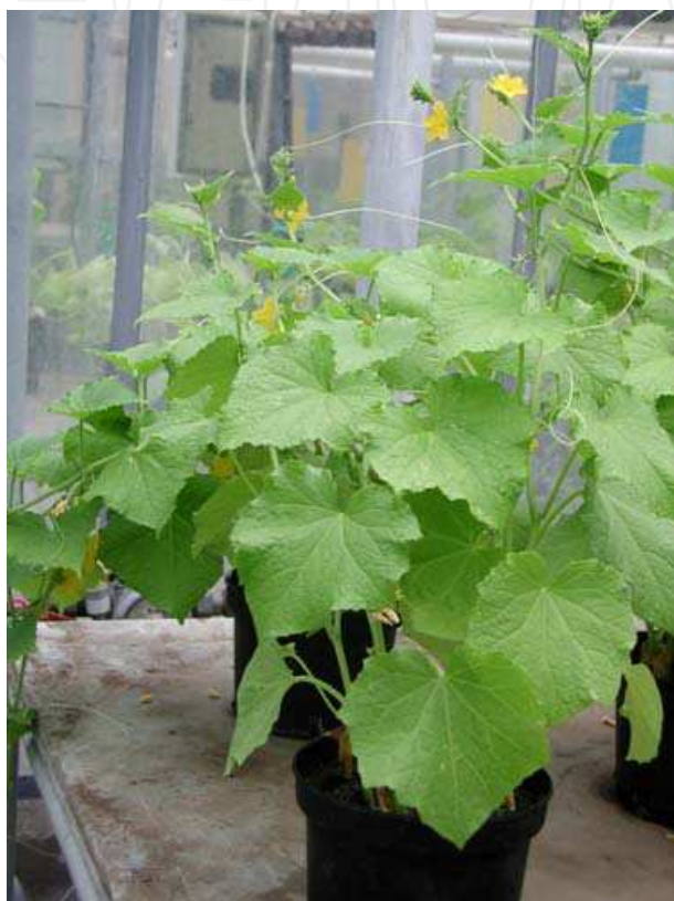
Fig. 12. Highly susceptible cucumber cv. 'Stela F 1 ' used for preparation of leaf discs

Highly susceptible cucumber 'Stela F 1 ' was used for leaf discs. Plants were grown in mixed substrate (ratio of volume 2 : 1) containing mould and Florcom SB (horticultural substrate based on peat; produced by BB Com, s.r.o., Letohrad, Czech Republic) and under optimal growth conditions (25°C/15°C day/night, with daily watering and weekly fertilization by Kristalon Start (NU3 B.V., Vlaardingen, the Netherlands), 10 ml/10 l of H 2 O) in the glasshouse and without any pesticide treatment (Fig. 12). Discs were cut with a cork borer from the leaves of 6- to 8-week-old plants (3- to 6-true-leaf stage) (Lebeda, 1986).