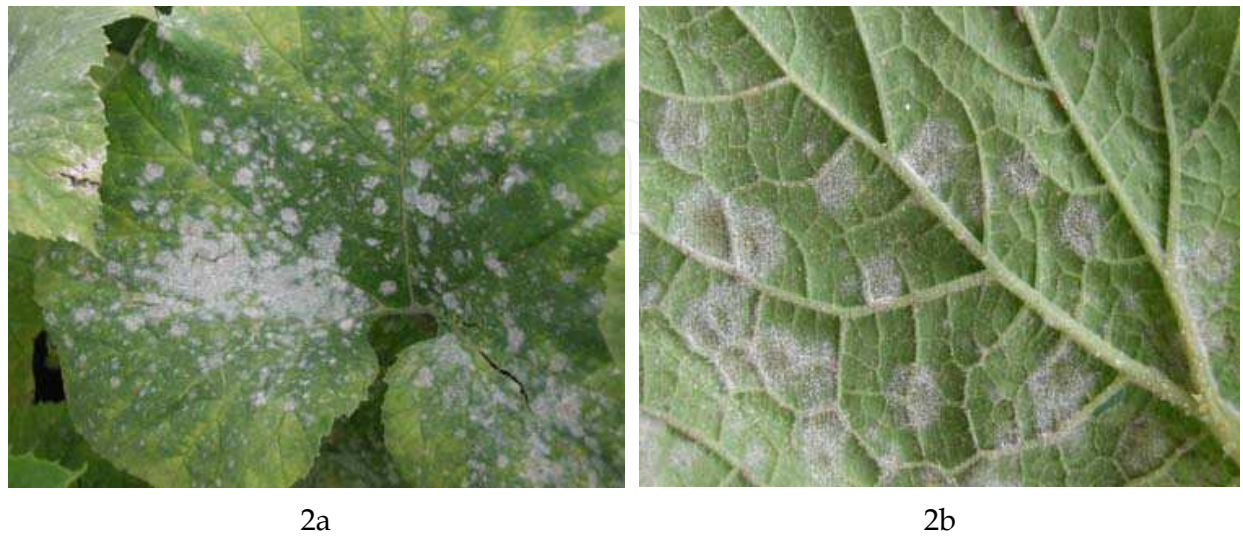
Fig. 2. a,b. Cucurbita pepo leaf with powdery mildew (a – adaxial leaf surface, b - abaxial leaf surface)