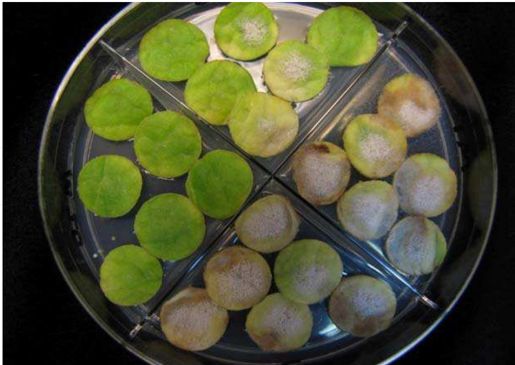
Fig. 7. Leaf-disc bioassay conducted in segmented Petri dish with sensitive reaction in section of dish on left (no growth of tested CPM isolate), tolerant reaction in upper section (limited growth on some discs), and resistant reaction on right (isolate growth on treated discs similar to growth on non-treated discs in lower plate section)