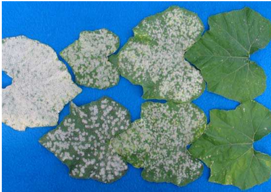
Fig. 9. Leaves from in-field bioassay seedlings eleven days after exposure to a cucurbit powdery mildew pathogen population (treatments clockwise from severely-affected non-treated control leaf at left: 50 ppm thiophanate-methyl, 80 ppm myclobutanil, 100 ppm boscalid, 1 ppm quinoxyfen, 80 ppm triflumizole, and 50 ppm trifloxystrobin)