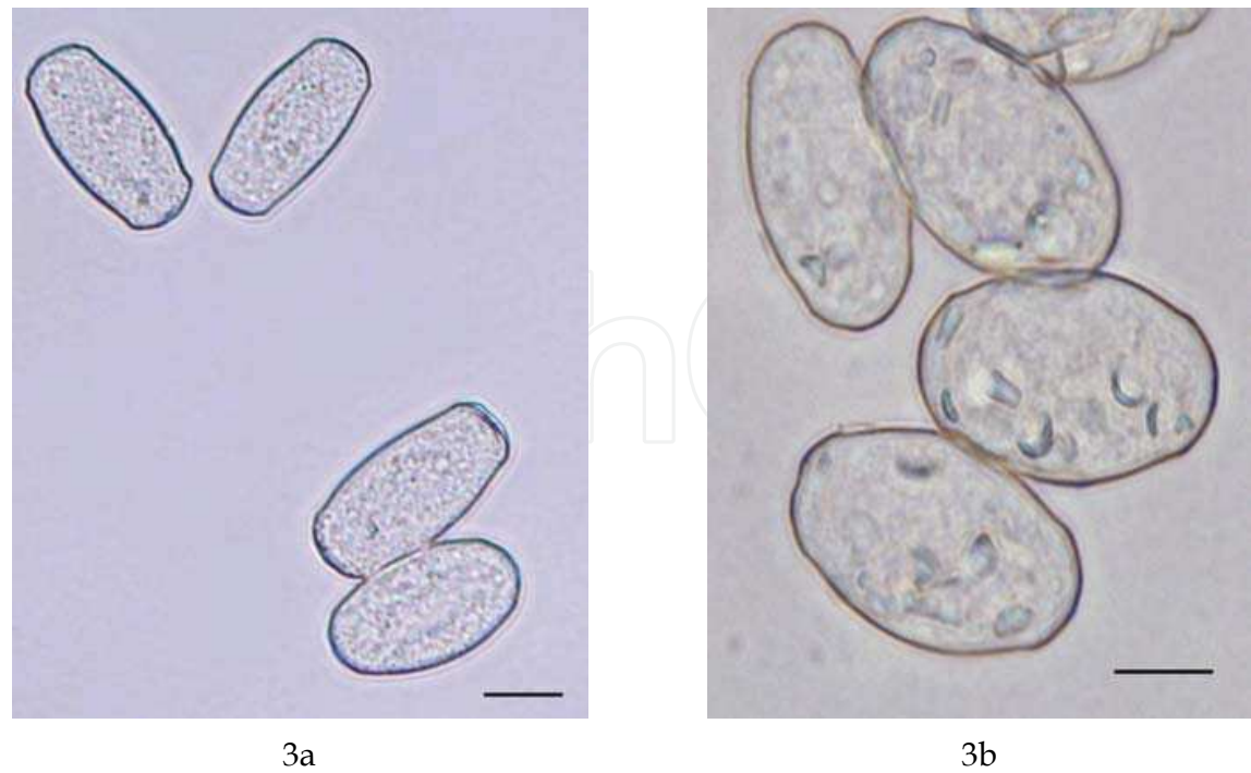
Fig. 3. a,b. The cucurbit powdery mildew fungi. a - conidia of Golovinomyces cichoracearum lacking fibrosin bodies, b - conidia of Podosphaera xanthii with fibrosin bodies (scale bar: 10 \mu m)