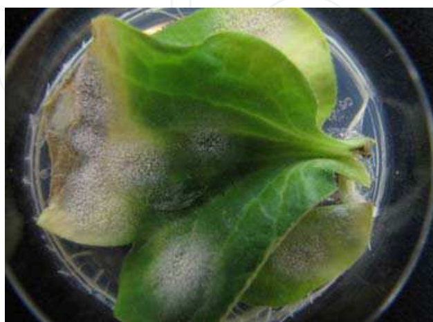
Fig. 11. Maintenance of a cucurbit powdery mildew (CPM) isolate on cotyledon in 60-mm Petri dish containing 1.5% water agar