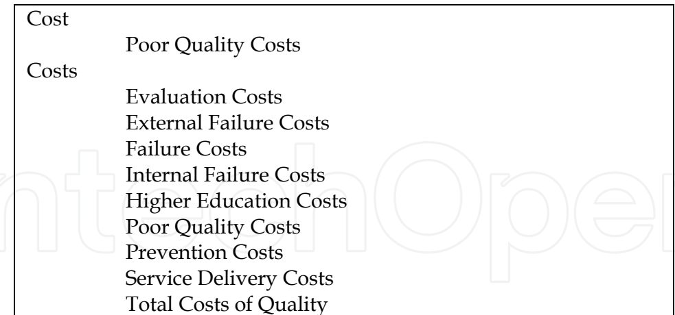
Table 15. KWOC permutation presentation