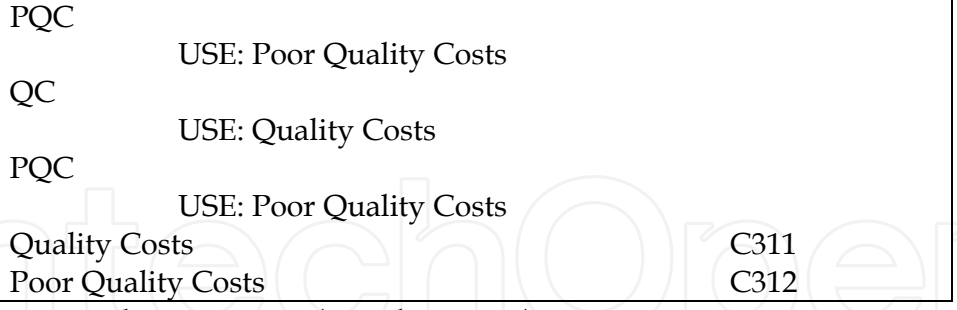
Table 14. Conceptual presentation (non-descriptor)