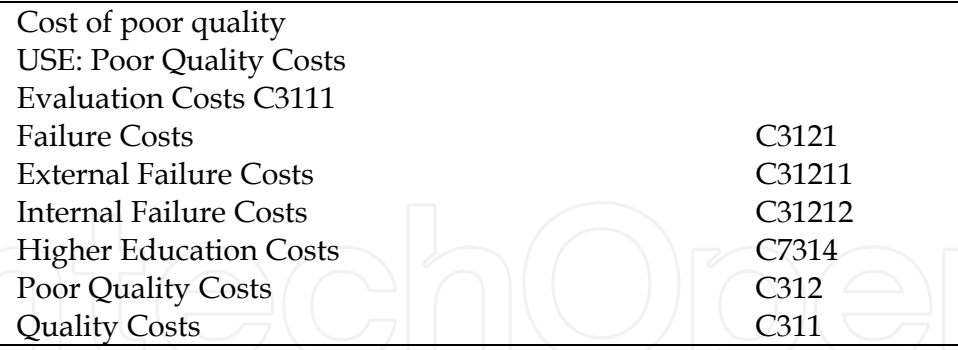
Table 11. Alphabetical presentation