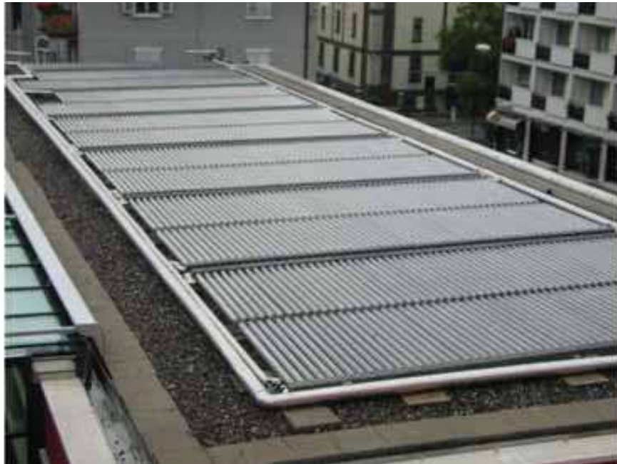
Fig. 10. Solar collectors system on the roof. It needs for hot water and heating. In the summer contributes to air conditioning inside the building.

raises the temperature of the incoming flow, before passing through the heat exchanger. In summer often cooled air can be placed directly inside.