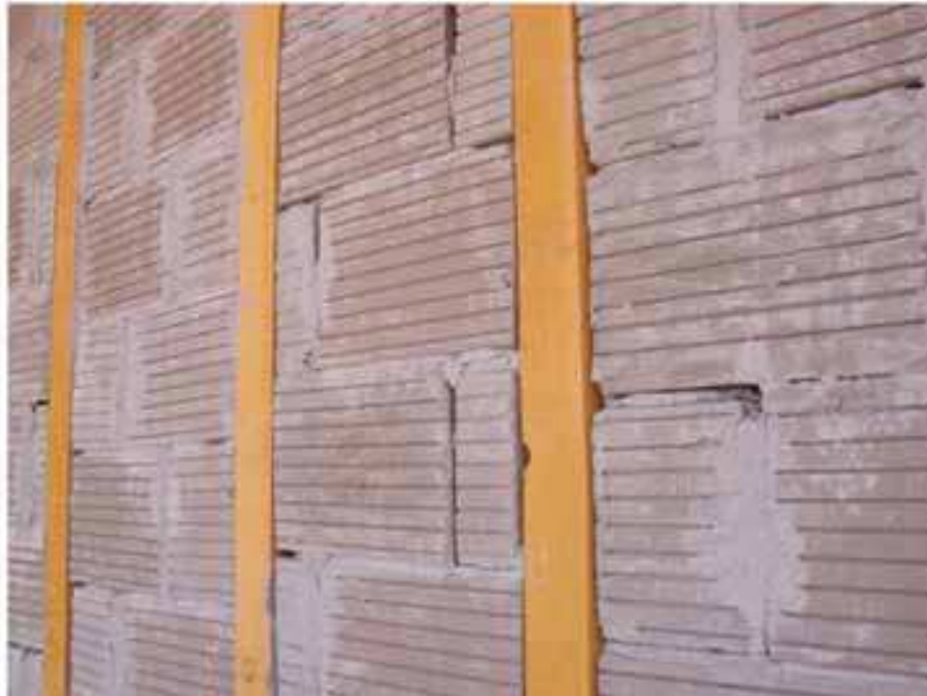
Fig. 6. The raw clay brick wall, with high heat capacity, helps to maintain equilibrium of humidity inside the building.

thermal resistance of the structure, the effects of the external changes of temperature on the indoor microclimate.