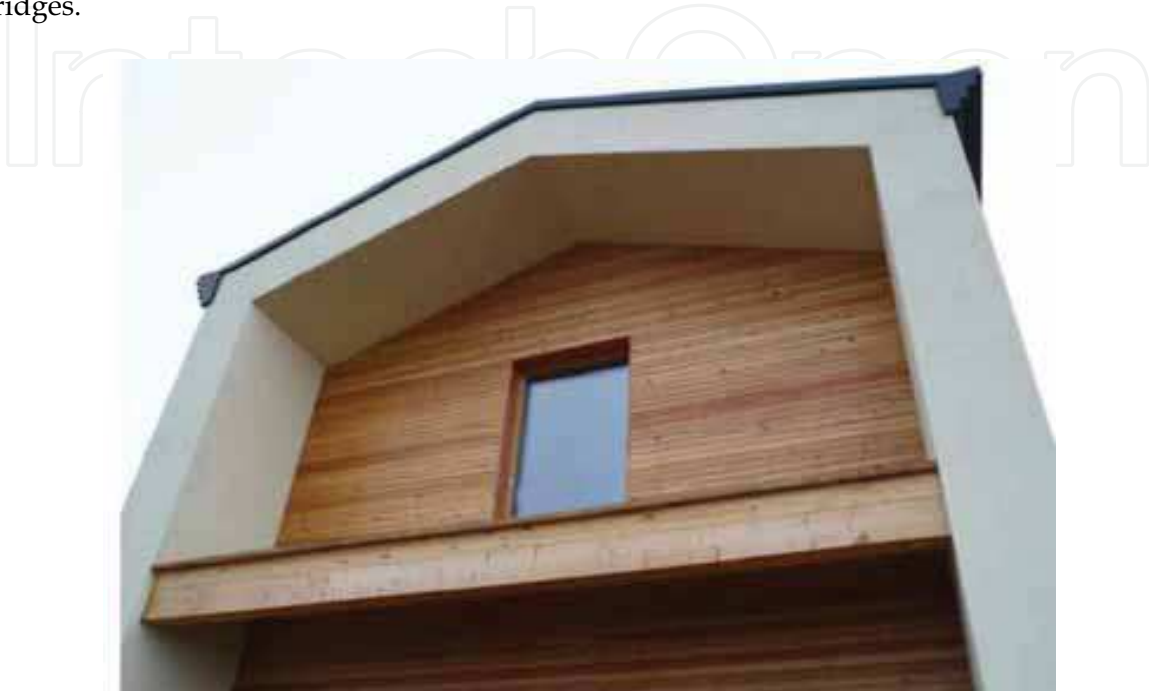
Fig. 5. Passive residential building in Montiano (FC - Italy), designed by Oficina 4, arch. G. Borghetti. The regular and compact shape helps the energy control; the orientation and limited size of transparent surfaces limit summer overheating.

So, the designer has to determine insulation thickness of building envelope and avoid heat bridges.