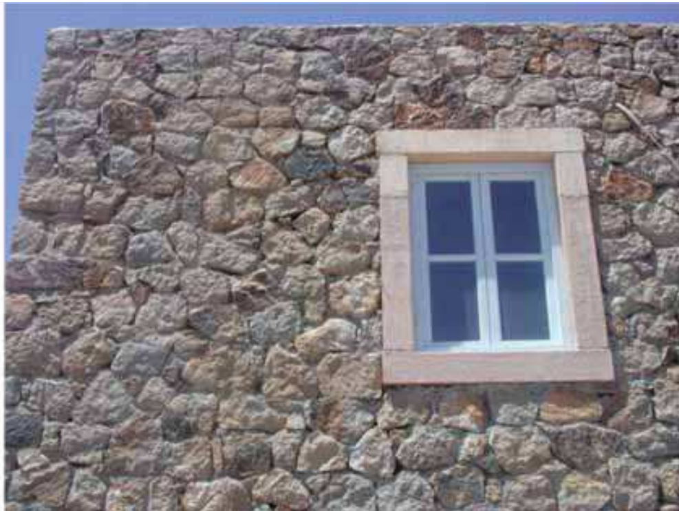
Fig. 16. In hot weather the problems related to overheating in summer exceed those for winter heating. Cooling systems increase consumption and tends to cause critical energy peak.

The role of heat inertia, although extremely important in the characterization of energy efficiency of buildings in summer, cannot leave aside a more general design strategy aimed to a correct relationship with the environment. Among the main parameters the most important are the location, the shape and orientation of the building; southern orientation and shade considerations are some of the basic features that distinguish passive house construction.