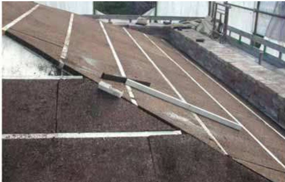
Fig. 7. Isolated and ventilated roof in historical building. The lack of adequate insulation causes excessive heat dispersion, the ventilation system favours a better summer behaviour.

In order to reduce heat transmission through the shell, subjected to direct solar radiation, to the inside layers, is appropriate to use ventilated solutions for the walls and especially the roofs, which are subjected to excessive sunshine in the summer.