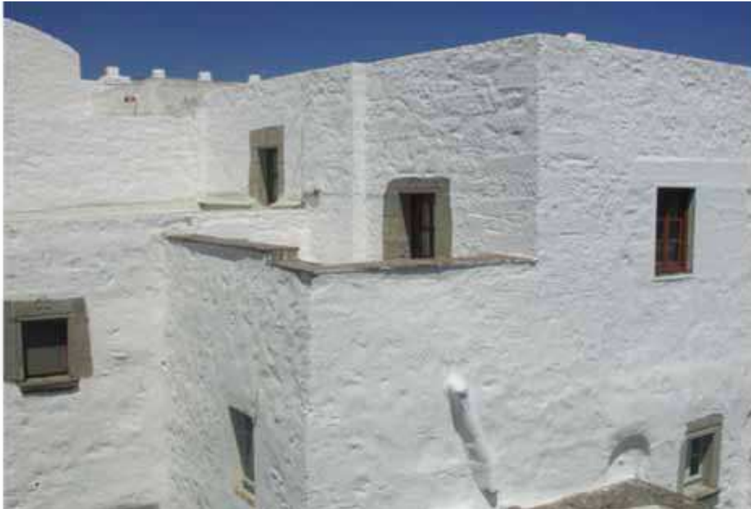
Fig. 15. Architecture and climate. The relationship with the climate and building traditions, often linked to local material availability, connotes typical construction

It makes equal to the value 0, corresponding to the minimum acceptable performance, the time lag of 8 hours; the value 3, corresponding to a significant improvement of the common mainstream practice, the time lag of 11 hours. Beyond 12 hours it will be assigned 5 points, equivalent to considerably advanced performances compared to best practice in use. The strategies tend to the use of heavy masonry shell, characterized by high thermal capacity and low conductivity. So, the combined action of thermal insulation and capacity of the system contributes to mitigate the indoor effects of external thermal variation. The D.L. 311/06, in force in Italy since February 2007, while focusing attention on the thermal transmittance of the envelope and on the winter heating of the building, establishes some requirements referring to the role of the mass related to the energy efficiency of buildings in summer.