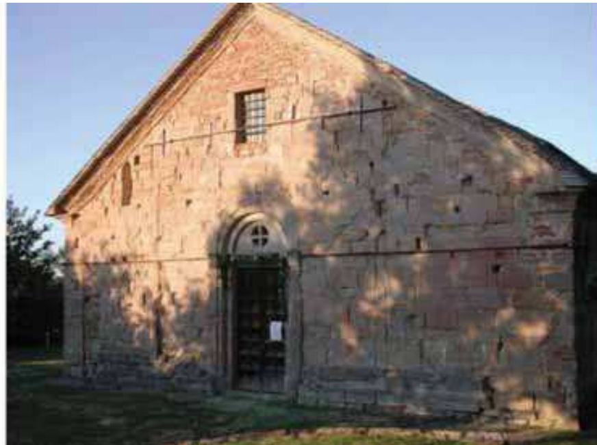
Fig. 2. Historical building. The Italian traditional architecture is characterised by envelopes built with considerable mass materials.

Other regulatory issues include the requirement of shielding systems for glazed surfaces to reduce the contribution of solar heat due to radiation in the summer and the use of external environmental conditions and characteristics of distribution of spaces to promote natural ventilation, possibly supplemented by mechanical ventilation systems.