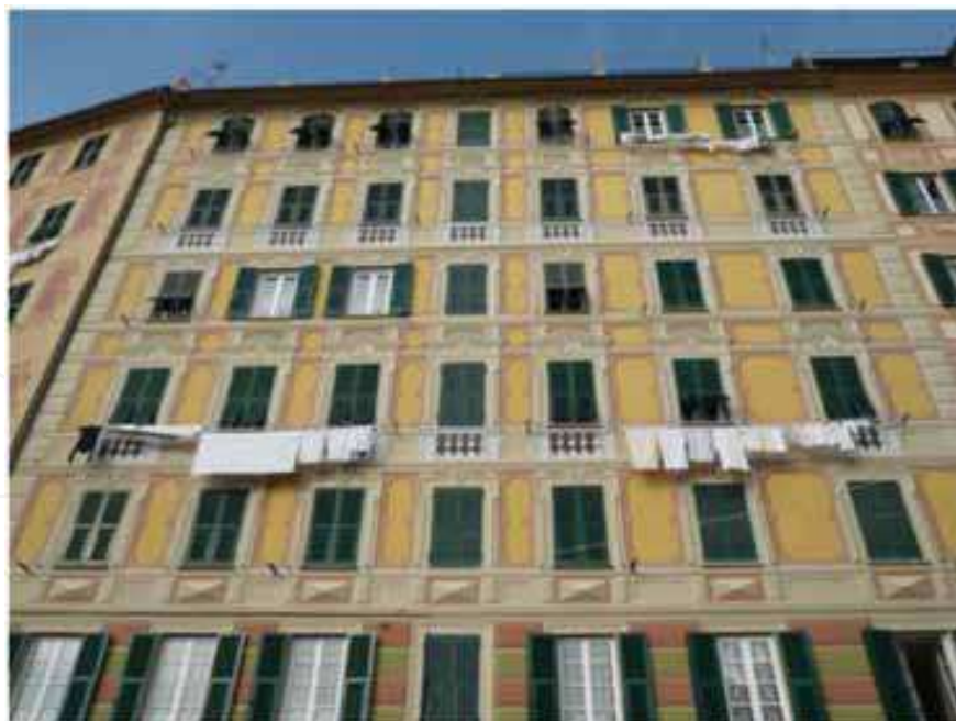
Fig. 1. Typical buildings of the Ligurian coast

Italian territory is characterized by different climates, variables from predominantly cold (Alpine) to warm (southern regions and islands) ones, and areas with temperature variations related to significant seasonal cycles. The recent growing attention to the issue of buildings energy efficiency puts the stress on the technical and regulatory problems related to the search for solutions adapted to specific environmental conditions. Therefore it is necessary to define design solutions to respond to different climatic conditions, to contain energy consumption during the winter and to limit the interior overheating during the summer. The main energy consumption in management phase of buildings regards the need of heating during the winter and/or cooling in the summer. The national decrees, transposition of European Directive 2002/91/EC, providing different limits for indicator of energy performance for the winter climate, expressed in kWh/year per unit of area or volume depending on the climatic zone of reference, apply an early diversification according to the weather conditions. The six climatic zones of Italy comprise the range from A, hotter with less than 600 HGT to F, with colder than 3000 HGT, through four intermediate zones. The different prescription of thresholds of consumption for heating in the winter responds to different climatic conditions on the country, a factor to be considered in regulations or energy efficiency classification.