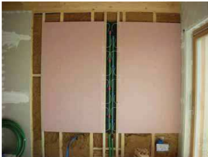
Fig. 11. Hydrothermal control system. The PCM Micronal panels contain microscopic capsules of wax that change phase between 22 and 26 ° C, accumulating latent heat and contributing to maintain internal temperature limiting overheating

The buildings should ensure high levels of thermal insulation to contain the dispersion in the winter; the transparent parts should allow the entry of solar radiation, useful for lighting and important for its contribution for passive heating of the interiors without raising the transmittance of the building shell.