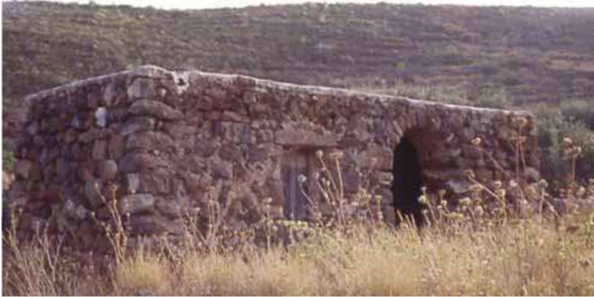
Figs. 13 - 14. Traditional building typologies. The use of appropriate materials, the bioclimatic relationship with the context contribute to maintain a constant internal microclimate without integration systems. "Dammusi" of Pantelleria and Apulian "trulli" are known as references in hot climates: the light painting favours the reflection of solar incident radiation.