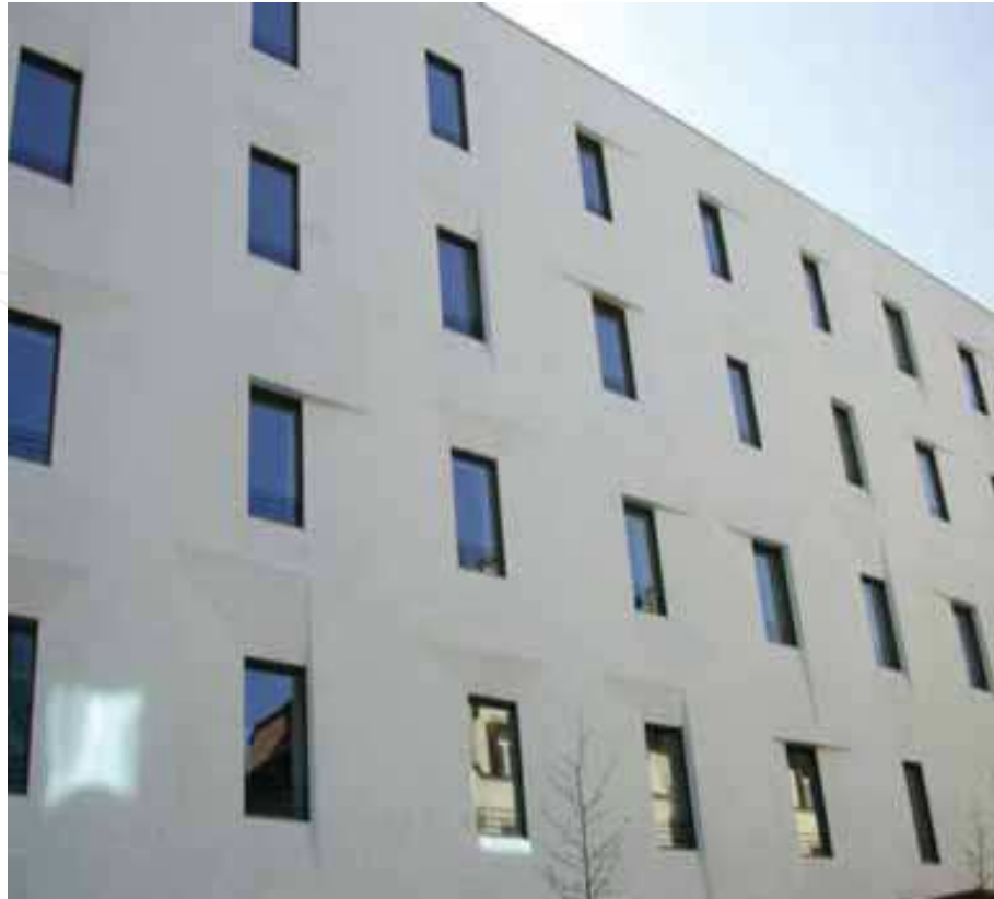
Fig. 4. Energy retrofit of the new headquarters of the Autonomous Province of Bolzano, arch. M. Tribus. This is the first national public building with a consumption of only 12 kWh/m 2 year for heating. It reaches the European standard of passive house. There is an outer coat of sintered polystyrene insulation 35-cm thick.