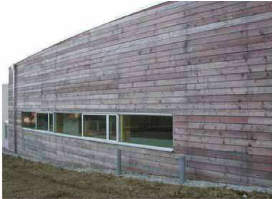
Figs. 8. - 9. The design of the School of Children in Ponticelli (Imola - Italy), arch. A. Contavalli, is characterised by energy efficiency. The north facade is extremely compact, the south one is glazed and protected by a system of external shields.

To prevent heat dispersion and infiltration through the building envelope it is necessary to drastically reduce its permeability. Passivhaus standard requires a value of waterproof less than 0.6 volumes/hour of air change measured with a pressure difference of 50 Pa between inside and outside. This is a very small value: in light dry constructive solutions is possible to apply a waterproof layer under the thermal insulation; for masonry solutions is important to require the continuity of plaster. Great care should be taken to assure that insulation layers are continuous, and without air pockets, to eliminate any discontinuity of different elements of the shell (it is important to have a building shell pressure test performed). In warm climate areas the infiltration, even if negative, have less impact on energy loss, and the value of permeability can be increased to 1 volume/hour.