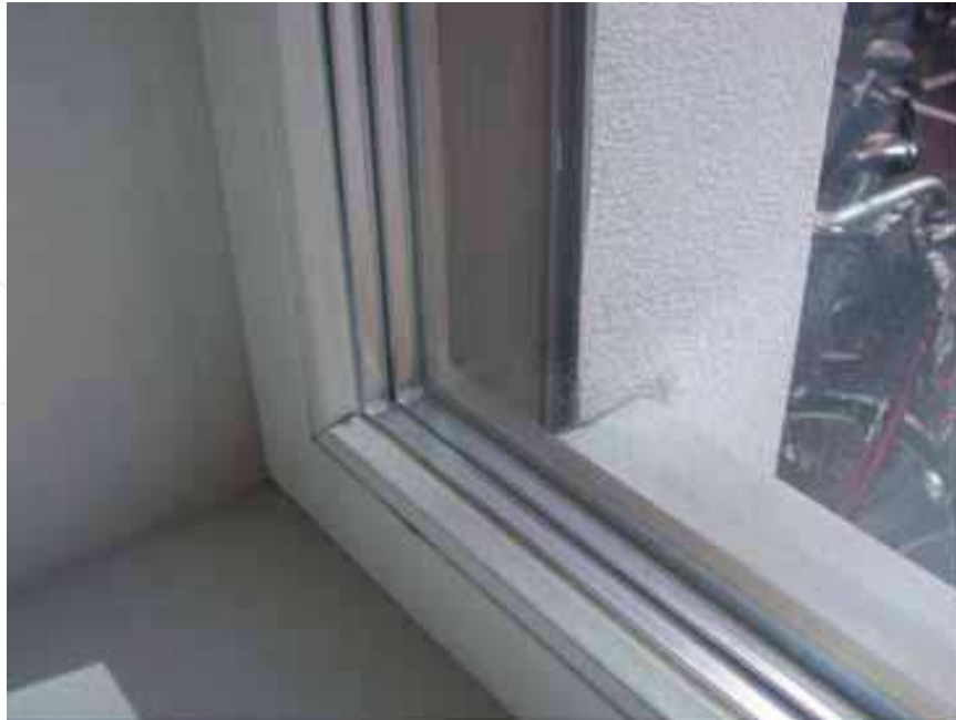
Fig. 12. External insulation. Detail of a window with triple glasses and double air interspaces

For instance, for a natural stone wall 60 cm thick, plastered on its sides, you can assume a value of thermal transmittance of 2, 20 W/m 2 K, about sevenfold higher than what it would be necessary to have a benefit in terms of discrete containment of energy. To limit the transmission of heat is necessary to apply appropriate layers of insulating material: in general, the monolayer constructive solutions, even using efficient elements in brick, are not sufficiently insulating in cold climates.